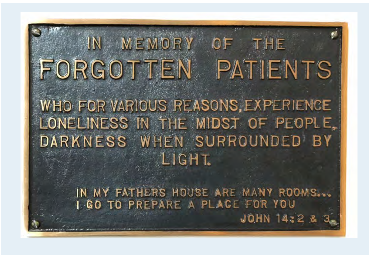
Photo: Karakia i te koroha, Prayer in the Wilderness, Chapel at Kenepuru Hospital, Porirua

We were reminded of the forgotten patients in our system.