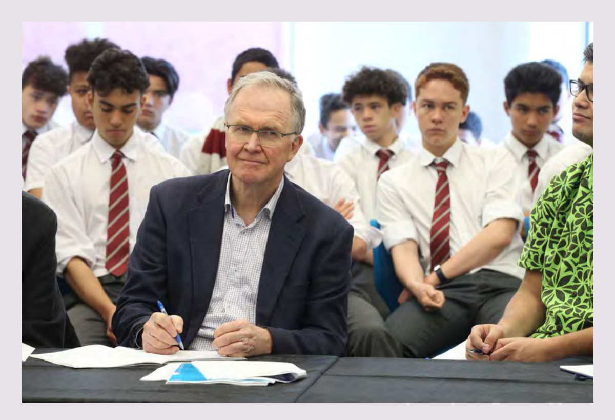
Photo: Panel members listening to students at St John's College, Hastings, June 2018

St John's College and Whatever It Takes Trust (WIT) are based in Napier. Students and staff of St John's College have used their business enterprise class as a vehicle to connect with WIT clients. In their class, students designed an early warning tool to detect flooding and donated all profits from the products sold to WIT. Nine students and school staff regularly visit clients at WIT. The regular contact has enabled some of the young men to open up about the challenges they face. St John's shows the opportunity schools and other organisations have to form relationships with people who face mental health and addiction challenges. It also illustrates practical ways to be connected in the community and what a future of community care could be – the community providing care and support for people in distress and facing challenges.