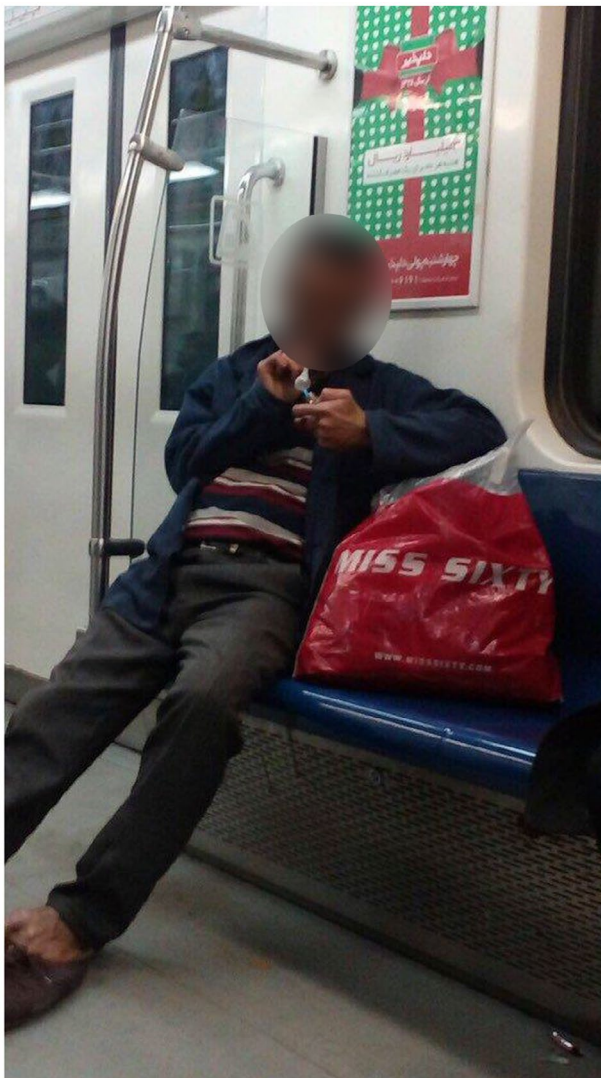
Figure 2. Meanwhile on the Tehran Metro: a shisheh smoker.

Note: This photograph circulated widely in September 2015 among Telegram App users. I received it in the drugs policy group (which includes leading members of the drugs policy community) 'The Challenges of Addiction'.