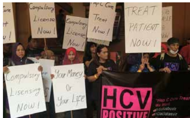
International Harm Reduction Conference 2015 From Malaysia with Inspiration