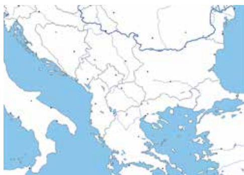
News from the organizations of the Network