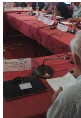
UNGASS 2016 and its significance for South East Europe