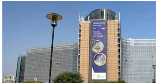
Civil Society Forum meeting in Brussels