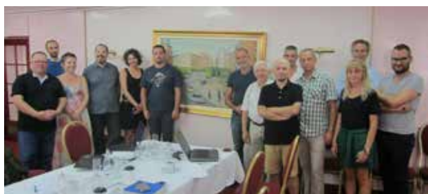
Foundation of Drug Policy Network in South East Europe DPNSEE