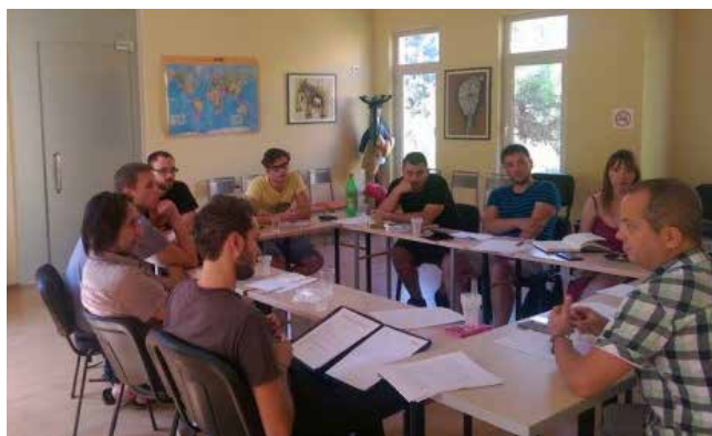
Meeting of young people in Tirana, Albania