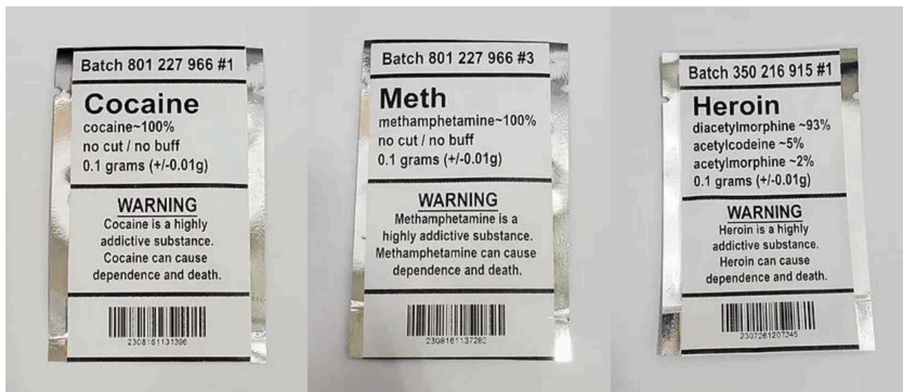
Fig. 1. DULF tested drugs packaged and labelled for contents.

DULF's project drew participants via lottery from a pool of self-referred applicants who were over 19 years of age, current people who use drugs at risk of overdose, and members of one of five different drug user groups in Vancouver's Downtown Eastside: (1) BC Association of People on Opiate Maintenance (BCAPOM); (2) The Coalition of Peers Dismantling the Drug War (CPDDW); (3) The Tenant Overdose Response Organizers (TORO); (4) Vancouver Area Network of Drug Users (VANDU); (5) Western Aboriginal Harm Reduction Society (WAHRS).