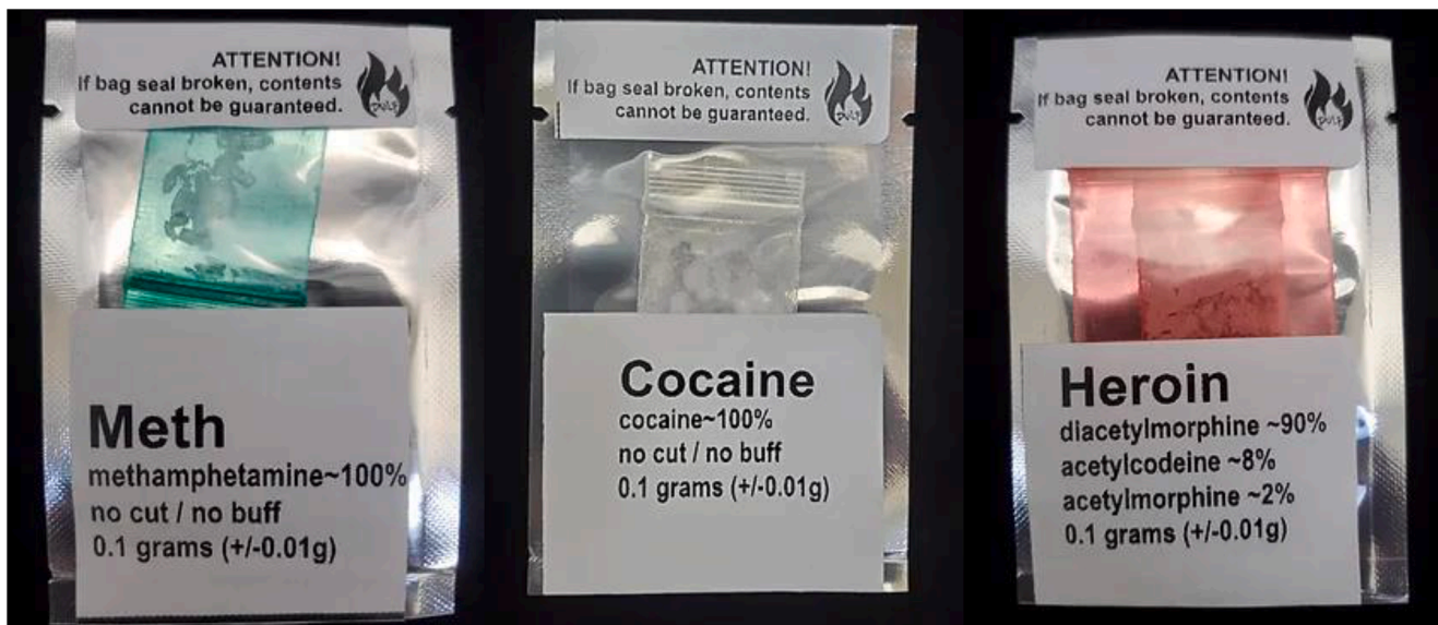
Fig. 2. DULF tested drugs packaged and labelled for contents.

Given the extreme contamination of the local drug supply, as well as the high incidence of overdose death, all individuals using drugs in our setting can reasonably be regarded as being at risk of overdose. Indeed, recent coronial reports indicate that 86% of recent overdose deaths involved fentanyl, 43% involved crystal methamphetamine, and 39% involved cocaine (BC Coroners Service, 2023a). Enrolment was staggered over time as capacity of the DULF Club grew to serve more individuals. Participants completed either 1 or 2 surveys prior to enrolling in the club (with those waitlisted completing a maximum of 2 pre-club-enrolment surveys), and a maximum of 5 surveys after enrolling in the club.