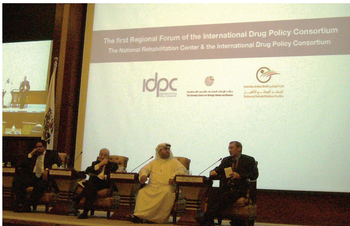
First IDPC seminar in the Middle East and North Africa, Abu Dhabi, United Arab Emirates, January 2011

Our extensive expert and multi-lingual publications. The IDPC publications brand is now well recognised for providing quality and accessible drug policy information and analysis. Over the years, IDPC has collated and published more than 60 expert reports, advocacy notes and briefing papers on a wide range of drug policy issues. In terms of analysis, we produce annual responses to the UNODC World Drug Report and to the INCB annual report. Our advocacy notes are often produced at short notice to address a particular issue, for example in early 2011, we called on countries not to block Bolivia's request to remove the international ban on coca leaf chewing. Our briefing papers are usually more descriptive and include topics such as drug policy and