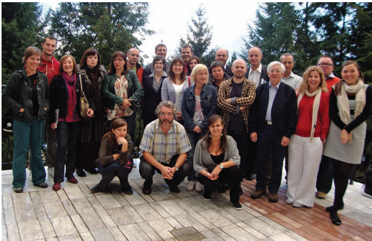
South East Europe Drug Policy Network, Ohrid, September 2010

have been steadily increasing in South East Asia. The IDPC Secretariat visits the region regularly to meet with members and policy makers and to participate in regional seminars, workshops and conferences. A key theme for IDPC work in South East Asia has been to encourage the refocusing of law enforcement activities and in 2010, we held a seminar on criminal justice reform in Kuala Lumpur in collaboration with the Malaysian AIDS Council. A second area of advocacy for IDPC in this region is to push for drug law reform. In 2010, we initiated a project to this end, in partnership with the Transnational Institute (TNI). The project focuses on possibilities for reform within Thailand and Burma through building networks and engaging with policy makers. Since January 2011, we have also become involved in a 4-year project led by the International HIV/AIDS Alliance to promote drug policy reform at national level in order to create an enabling environment for the provision of harm