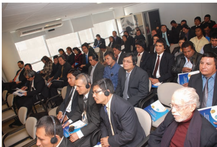
IDPC first training of police officers in Lima, Peru, September 2010