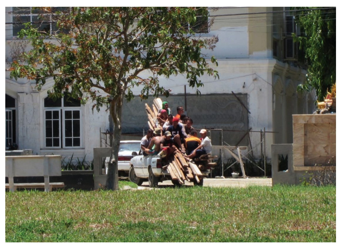
Young men who had been working under gendarme supervision on the construction site of a hotel in Battambang are driven in a pickup towards the gendarme-run drug detention center.

pickup truck with gendarme license plates and loaded with the young men then drove from the construction site in the direction of the gendarme center in Battambang town. However, the destination of the pickup could not be confirmed.