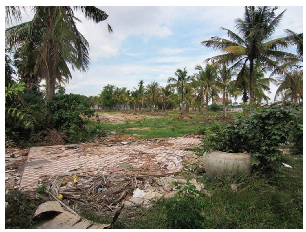
The frond-strewn floor of a former building inside the Choam Chao "Youth Rehabilitation Center" in Phnom Penh. Cambodia closed the center in 2010.

One of the three centers closed since 2010 was the Choam Chao "Youth Rehabilitation Center," which was situated in Phnom Penh and run by the Ministry of Social Affairs up until 2010. The center had the capacity to detain approximately 100 people. It ceased to operate in mid-2010 after the United Nations Children's Fund, UNICEF, which had provided funding since 2006, confirmed reports of abuses against detainees and stopped funding the center.<sup>26</sup> In late 2012, the center's buildings were demolished.