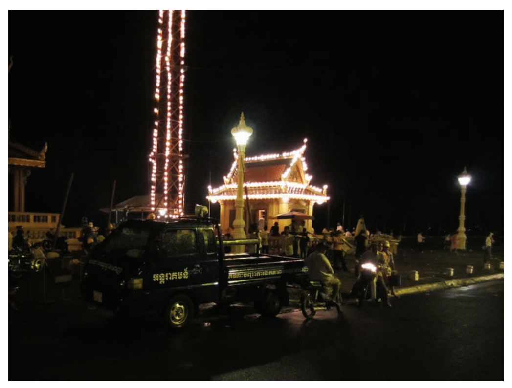
An "intervention" truck from the Daun Penh district police in Phnom Penh. Such trucks are used to transport the police who carry out "street sweeps" of drug users and other people considered "undesirable" by authorities.

People who use drugs in Cambodia are not the only people considered "undesirable" by authorities. In early 2012, local media quoted an official at Phnom Penh's Social Affairs department explaining that beggars and sex workers make the city "messy" and that rounding them up was necessary to "keep public order and make the city beautiful for ASEAN." He said, "We've taken them for training."<sup>48</sup> In fact, homeless people, beggars, street children, sex workers, and people with actual or perceived disabilities are routinely held in drug detention centers.