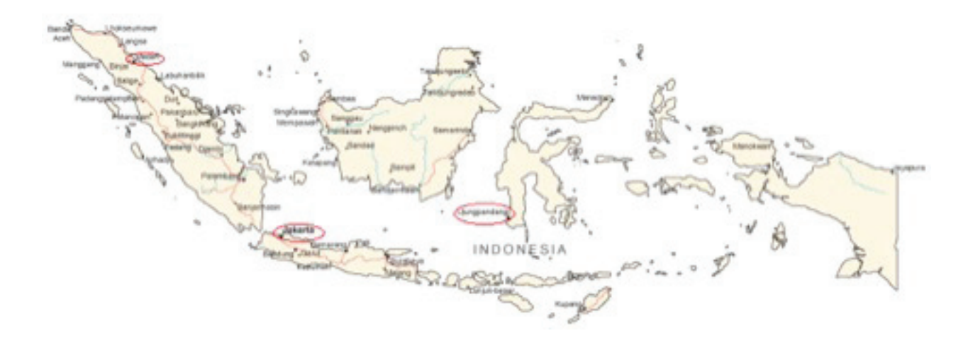
Figure 1: Study sites

Jakarta, Medan and Makassar were chosen as the sites of the study. The selection of these cities was based on the National Narcotic Board Report (2014) that showed these cities had the highest number of crystal-meth users in Indonesia. Moreover, the selection of the cities is also expected to provide a better picture of meth using patterns and other characteristics of meth users in different regions of Indonesia, as shown in figure 1.