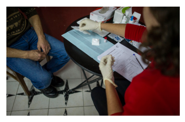
Outreach testing: "European HIV Testing Week" in Mouraria Harm Reduction Centre, Lisbon, Portugal.

female peer workers in order to encourage women to access harm reduction and treatment services.<sup>19</sup> Nevertheless, much more remains to be done to ensure that the services available for people who use drugs are tailored to women and are provided in a nonjudgemental, non-discriminatory manner.<sup>20</sup> For instance, specific harm reduction and treatment services should exclusively target women, or those already available should have opening hours for women only, and should include childcare for women with children, incorporate sexual and reproductive health interventions, and provide social support for women and mothers.<sup>21</sup>