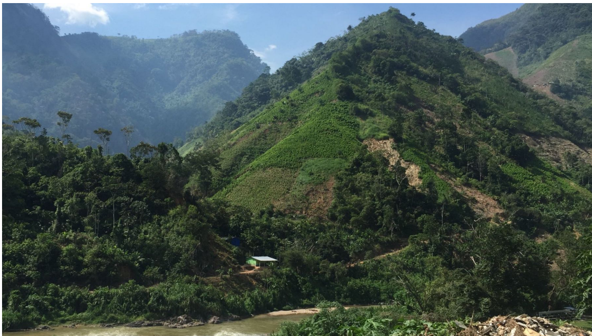
Catatumbo, Colombia.

Reports from disputed territories around Colombia point to competing armed and criminal groups prohibiting coca and coca-paste purchases in order to deny income to rivals. That leaves coca growers with no buyers. In Briceño, Antioquia, “if they sell to one group, they suffer retaliation from the other group,” a social leader told Cambio . In Nariño in 2022, El Espectador reported , FARC dissidents killed Sinaloa Cartel representatives who were buying “merchandise” in territory under a rival group’s influence, halting all purchases in that area. In Catatumbo, groups have destroyed each others’ processing laboratories and clandestine airstrips.