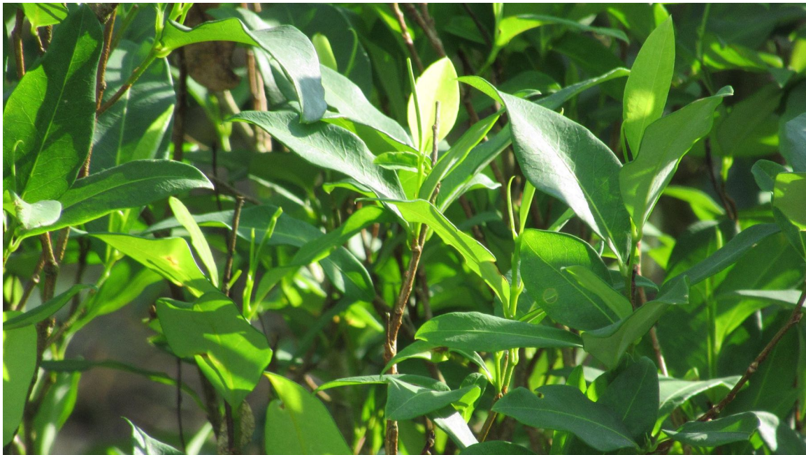
Putumayo, Colombia.

hungry and burying their product as the cocaine market struggled to adjust—which it did in a matter of months.