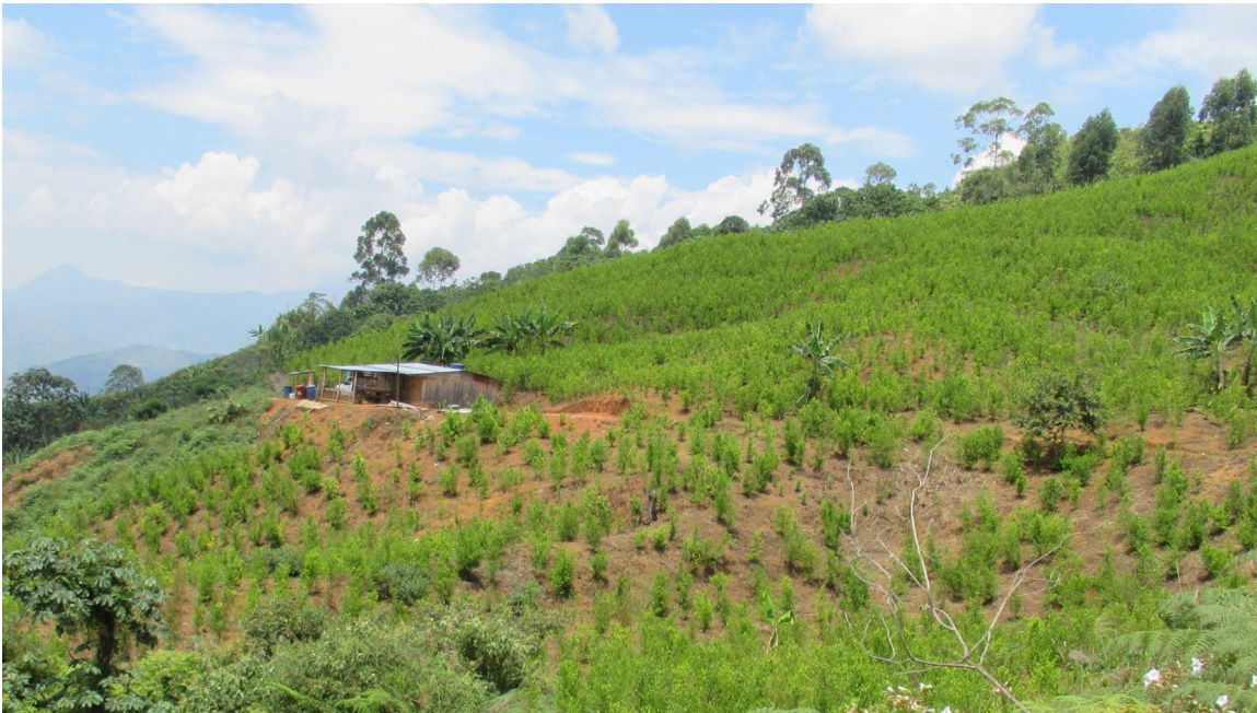
Cauca, Colombia.

Civilian state presence would mean greater access to education and health care. It would mean massive titling of land, a long standing demand. It would mean technical assistance and access to credit. It would mean introducing the judicial system to settle disputes and to bring accountability for corruption and human rights violations. And it would mean protecting local leaders who seek to have a say in how their communities are governed.