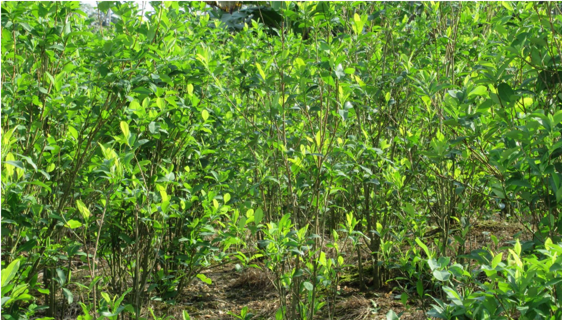
Putumayo, Colombia.