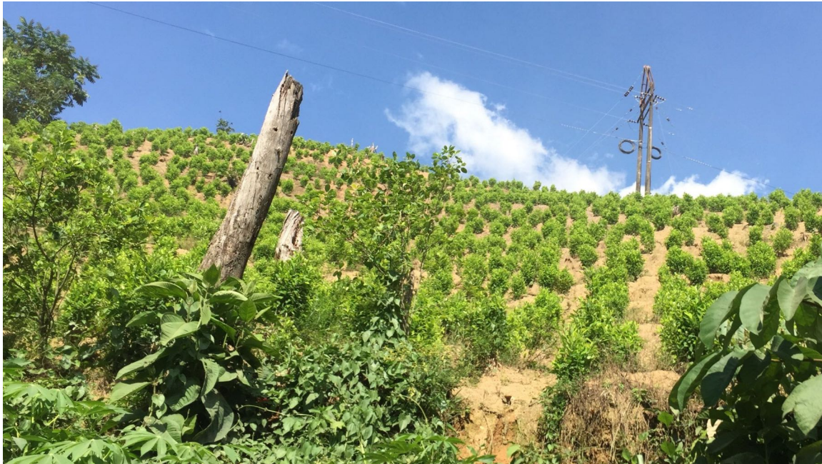
Catatumbo, Colombia.