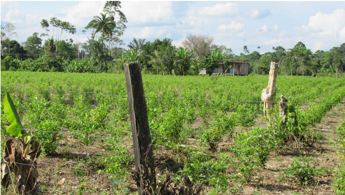
Putumayo, Colombia.

Regardless of the reason, the crisis is sure to be temporary as world cocaine demand remains robust. The Colombian government, and partner and donor governments including the United States, should take maximum advantage of this window of opportunity before it closes. The humanitarian crisis offers a chance for Colombia to fill vacuums of civilian government presence in territories where insecurity, armed groups, and now hunger are all too common.