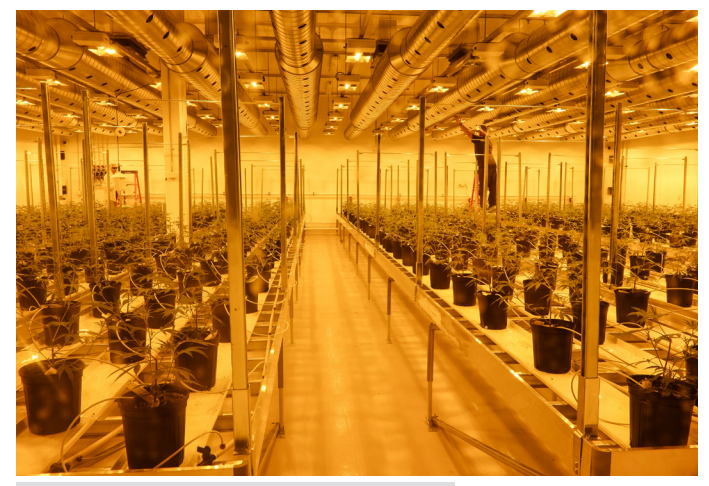
An indoor cannabis cultivation facility in Ontario

Unfortunately, the social justice and equity components of the Cannabis Act were inadequate, and something of an afterthought in the legalisation process. For example, it failed to address the problem of the many thousands of Canadians who have historical criminal records for selling or possessing cannabis - an activity that is no longer criminal. Post-legalisation, new legislation (Bill C-93) was passed, which sought to expedite and remove cost-barriers from the criminal records suspension process. However, more than 500,000 continue to live with criminal records and the stigma stemming from prior convictions.<sup>21</sup> Bill C-93 was criticised for not providing a fair and effective amnesty as it only provides for criminal record suspensions, so does not amount to full 'expungement'.22 In comparison, law reform in California has enabled automatic expungement of past marijuana convictions and an estimated 218,000 individuals are due to benefit as a result.<sup>23</sup> The Canadian Bill itself was only implemented after the 'tireless advocacy' of civil society groups.<sup>24</sup> The fact that black and indigenous groups have carried a disproportionately greater burden of criminalisation from repressive drug policies has only added to the sense of injustice related to this failure.