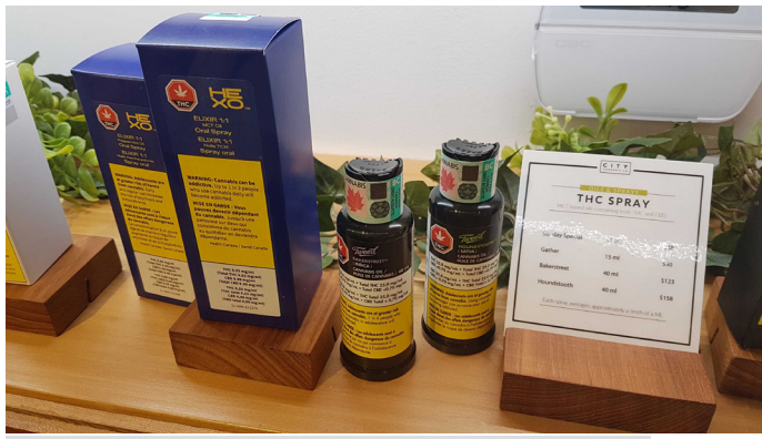
Legal cannabis product packaging in a Vancouver retails store

problematic. As noted, self-reporting survey data may be biased against reporting of illegal supply. Furthermore, even prior to legalisation there were numerous retail outlets (both 'brick and mortar' and online) that were selling medical cannabis illegally, albeit at least partially tolerated in many cases. This blurred distinction between legal, quasi-legal (informal/ tolerated/'grey-market' dispensaries from the prelegalisation era, but still in operation), and illegal market created a significant degree of confusion that may have also affected survey responses. And while the scale of legal recreational sales is relatively easy to measure (9,747 kg of dried cannabis and 5,558 litres of cannabis oil were sold in July 2019) estimating the size of the quasi-legal and illegal markets is much harder.<sup>10</sup>