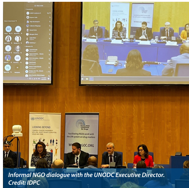
Informal NGO dialogue with the UNODC Executive Director.