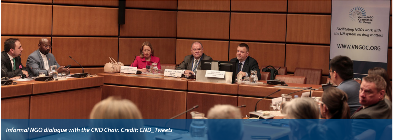
Informal NGO dialogue with the CND Chair.

the Youth Forum in the Plenary the day prior to the Dialogue as ‘the best possible defence I have ever heard to the fight against drugs, which is prevention’. The Ambassador went on to acknowledge the futility of wasting billions trying to curb drug supply and instead encouraged youth-led civil society to focus on prevention as the crux of their arguments going forward.