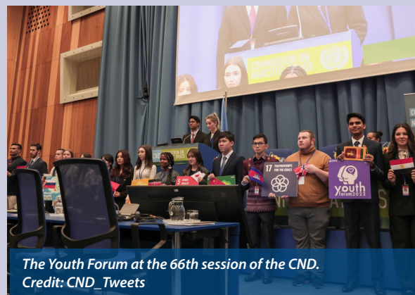
The Youth Forum at the 66th session of the CND.

ways in which its members are nominated (by Member States), and its primary focus on prevention, to the detriment of harm reduction. In practice, this means that the Youth Forum is often disconnected from other existing efforts led by young people at the CND. Interestingly, the CND was an opportunity for the VNGOC to launch the Youth Working Group, bringing together young people from all sides of the drug policy spectrum to draft a common position for youth-led drug policy organisations. This initiative will hopefully contribute to bringing more balance and visibility to the diverse views of young people at the CND.