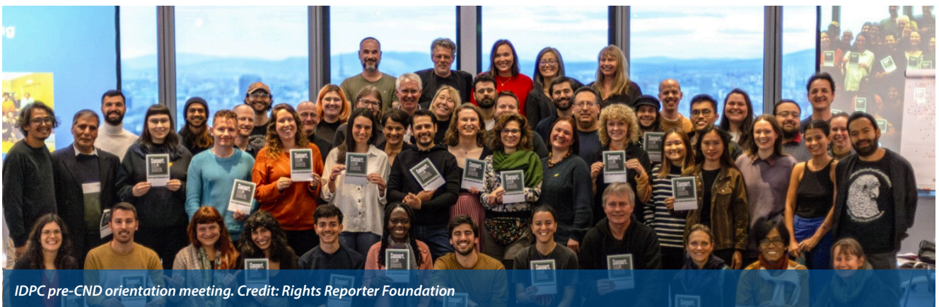
IDPC pre-CND orientation meeting.

The VNGOC – which celebrated its 40 th anniversary – played an important role in supporting civil society engagement (see Box 5). On the reform side, IDPC continued to play a key coordination and strategising role. The Consortium facilitated civil society participation by securing more than 70 ECOSOC passes, held a multilingual pre-CND webinar 71 and in-person strategising meeting to discuss key advocacy avenues at the 66 th session (including coordinating NGO statements at the Plenary, elaborating our recommendations for the resolutions, etc.) and managed various tools to help NGOs and Member States alike to follow the proceedings, including the CND Blog 72 and the CND App. 73