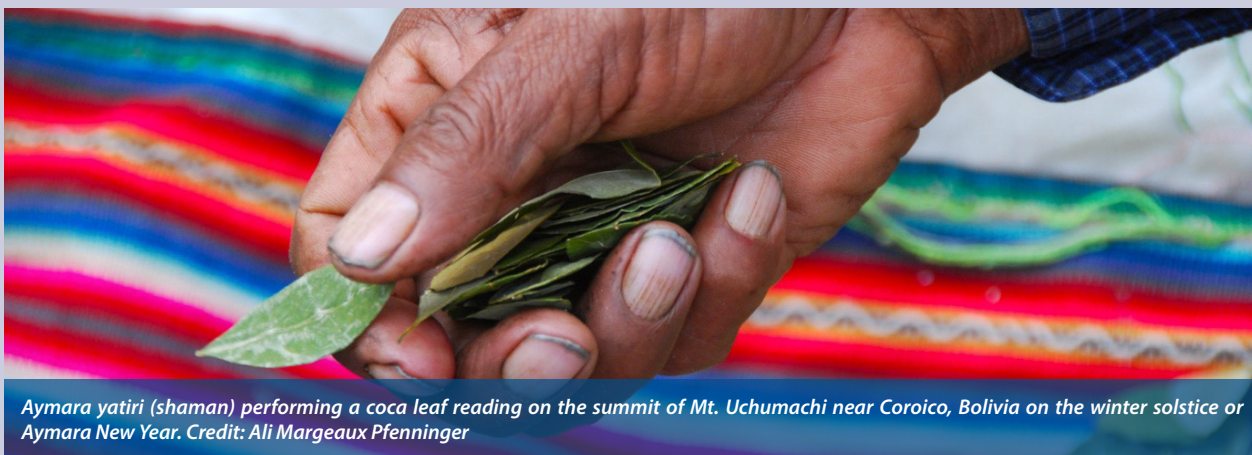
Aymara yatiri (shaman) performing a coca leaf reading on the summit of Mt. Uchumachi near Coroico, Bolivia on the winter solstice or Aymara New Year.

This conflict needs to be resolved as a matter of urgency, by amending the international and national legal provisions that ban traditional plants or preparations, or that create legal grey areas in which people are prosecuted. The initiative to trigger a critical review by the WHO’s Expert Committee on Drug Dependence (ECDD) of the classification of the coca leaf under the 1961 Single Convention should be regarded as a first step to finding a structural solution to such tension.