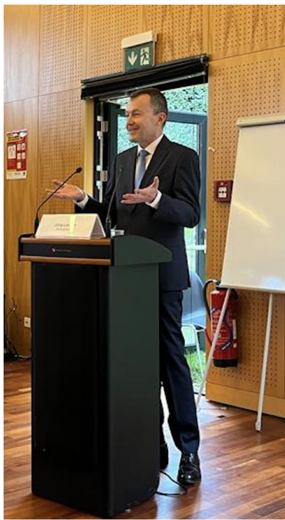
H.E. Ambassador Jürg Lauber of Switzerland addresses the plenary of the Forum

High Commissioner Bachelet reiterated the urgency of placing human rights at the centre of drug policies, and welcomed important progresses at the national level – such as the growing number of countries that have decriminalised drug possession for personal use. Areas for further improvement were identified, namely: access to controlled medicines, availability and funding of harm reduction services, the abolition of the death penalty for drug offences, and reform of drug laws to tackle inequality and discrimination, particularly against racial minorities. After pointing to supporting resources, such as the UN Common Position on drug policies, High Commissioner Bachelet called for further engagement of the Human Rights Council on drug policy, possibly by requesting her Office – through a resolution – to regularly report on the implementation of UNGASS 2016.