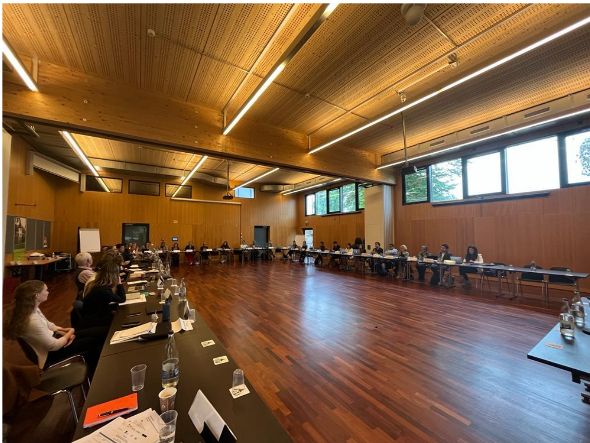
The plenary session of the Forum unfurls during the afternoon of the 1st June 2022

The first day of the Forum ended with a panel discussion, which gathered insights into key issues and opportunities toward human rights-centred drug policies from differing perspectives – community, civil society, academia, government, and the UN. The essential need to ensure the meaningful engagement of communities for a more just but also effective response was emphasised by several panellists. Recent developments, including the 2021 Political Declaration on HIV/AIDS, provide opportunities for new and ambitious targets on which to focus advocacy efforts and increase community-led responses, and a new Human Rights Council resolution should converge with these goals. The role of criminalisation in driving rights violations was also reiterated, together with the need to avoid pathologising and disempowering language when talking about people who use drugs.