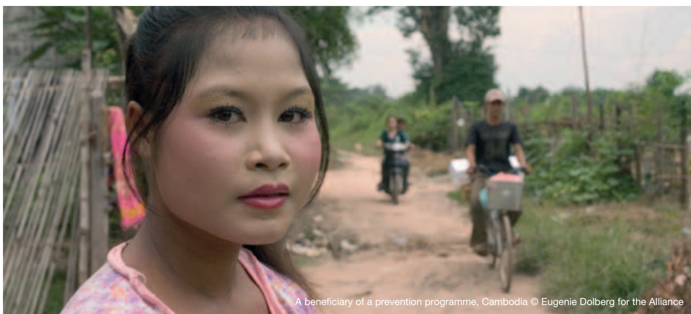
A beneficiary of a prevention programme, Cambodia