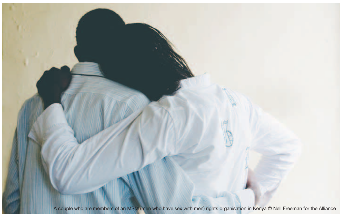
A couple who are members of an MSM (men who have sex with men) rights organisation in Kenya