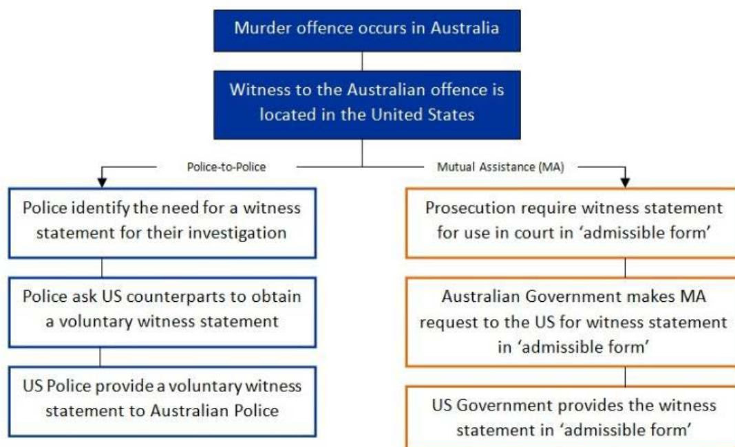
Figure 3.1 Difference between mutual assistance and police-to-police assistance

32