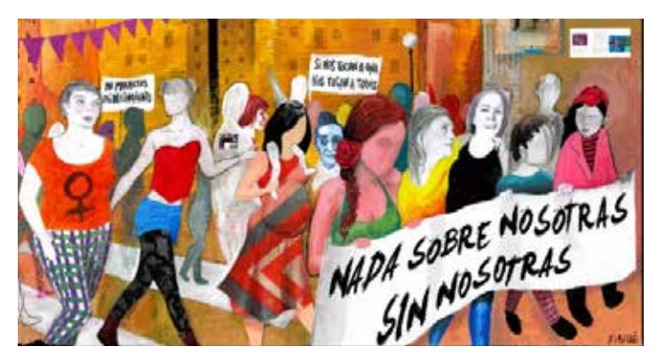
"Nothing About Us Without Us."

The all-female team that makes up Metzineres is interdisciplinary, with two experts in drug policy, gender mainstreaming, and harm reduction; a project officer specialized in law; a coordinator of Women Promoters of Harm Reduction (Mujeres Impulsoras de Reducción de Daños, DIRD); a doctor; a social worker; a social educator; a nursing assistant and Kundalini Yoga workshop facilitator; a social integration specialist who is also a graphic artist and designer; and workshop facilitators, volunteers, interns, and neighbors who offer their collaboration and skills.