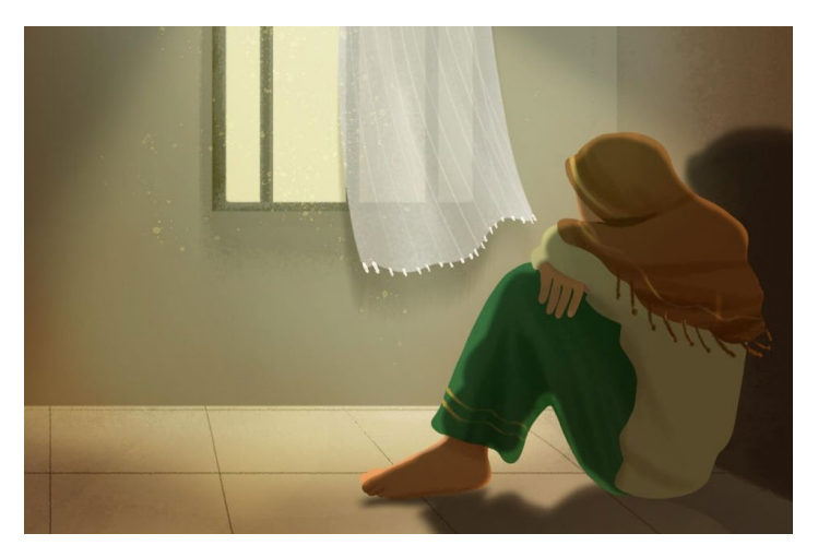
Source: International Drug Policy Consortium (2022), Decriminalisation of People who use Drugs: A Guide for Advocacy, IDPC Report , https://idpc.net/publications/2022/02/ decriminalisation-of-people-who-use-drugs-a-guide-for-advocacy

This paper traces the roots of these barriers faced by womxn who use drugs to the international drug control system and drug policies subsequently implemented at national level, and outlines international standards on public health and human rights that provide guidance on the reforms that governments must urgently pursue. To elaborate on the reforms needed, the paper also sets out country-specific recommendations from civil society organisations to governments in Southeast Asia.