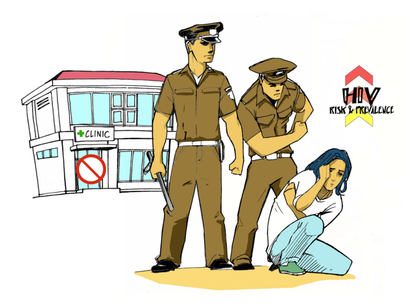
Source: Stoicescu, C. and Pantelic, M. (June 2022), Women who use drugs in Indonesia: The harmful impacts of drug control , https://idpc.net/publications/2022/06/women-who-use-drugs-in-indonesia-the-harmful-impacts-of-drug-control

Harsh penalties, the overuse of pretrial detention for drug offences,<sup>13</sup> bias amongst judges against women accused of drug offences, and lack of access to legal aid are all contributing factors to the high rates of incarceration of womxn for drug-related activities. In Indonesia, a study among women and transwomen who use drugs found that only 17% of the respondents had received legal assistance during legal proceedings against them.<sup>14</sup> Similarly, a 2014 study conducted by the Thailand Institute of Justice among 533 women incarcerated in Thailand underscored that 45% did not have access to a lawyer during trial.<sup>15</sup> Even when a woman might be able to afford legal aid, in some contexts lawyers refuse to represent them due to the stigma associated with drug offences.<sup>16</sup>