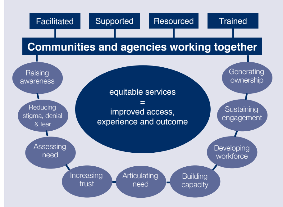
Figure 1. Centre for Ethnicity and Health Community Engagement Model