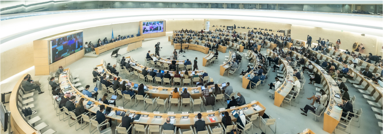
General view of the Human Rights Council.

be noted – with a marked improvement in the 2018 resolution. Resolution 28/28 had a procedural focus and was almost apologetic in tone; it avoided substantive references to drug policies and human rights, and limited itself to introducing drug policies within the agenda of the OHCHR and the Council – already a huge step forward in itself. While still deferential to the CND, the 2018 resolution departs from the 2015 text by introducing substantive language on the role of human rights in the development of drug policies, on the need to address the root causes of the drug phenomenon, on the urgency of mainstreaming a gender perspective in drug policies, and encouraging the increased involvement of human rights mechanisms in drug policy debates. In another important departure, it explicitly encouraged human rights mechanisms ‘to continue, within their respective mandates and through the appropriate established channels with the Commission on Narcotic Drugs, their contribution to addressing the human rights implications of the world drug problem’.