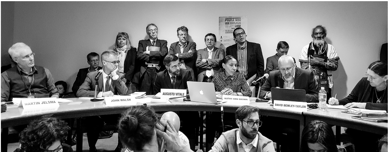
Civil society roundtable at the 2016 UNGASS.

problem on the enjoyment of human rights’ and called for a thematic session dedicated to the issue. The resolution showcased the influence that Human Rights Council can have on global drug policy debates, with three tangible outcomes. Firstly, the resolution resulted in a landmark OHCHR report on the human rights consequences of drug policies – the first ever. 66 Secondly, it directed the High Commissioner to contribute to the preparatory work of the 2016 UNGASS. Lastly, the resolution created space within the agenda of the human rights system to explicitly consider the human rights impacts of drug policies, and resulted in greater involvement by human rights mechanisms in drug policy debates, including the UNGASS.