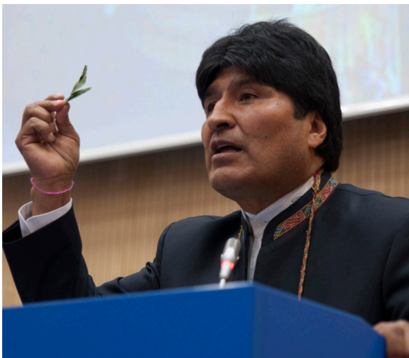
Bolivian President Evo Morales holds a coca leaf at the 2012 session of the Commission on Narcotic Drugs.

Also in 2008, the then UNODC Executive Director, Antonio Maria Costa, published a landmark report which, for the first time, openly acknowledged the negative ‘unintended consequences’ of drug control, including in terms of human rights, suggesting the need for national-level reforms. 32 Importantly, when presenting the report, Mr. Costa concluded: ‘Although drugs kill, I don’t believe we need to kill because of drugs.