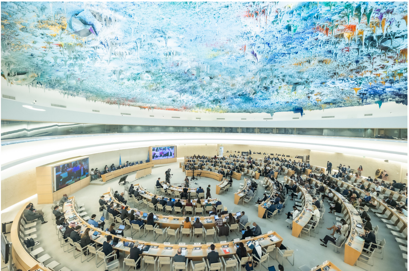
General view of the Human Rights Council.

Adrià Cots Fernández 1 & Marie Nougier 2