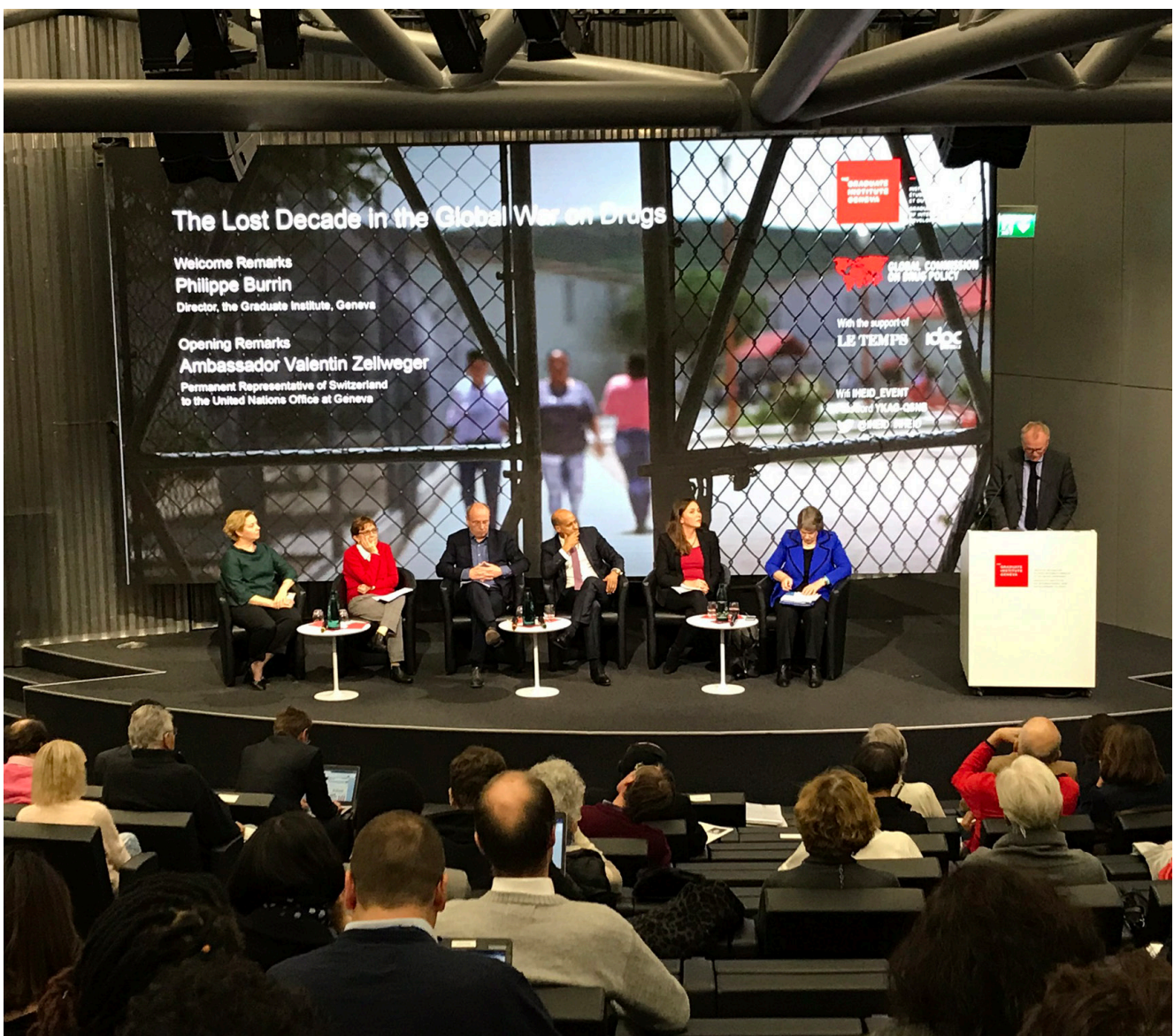
2019 Human Rights Council side event on the human rights impacts of drug policies.

The progress made at the Human Rights Council and with special mandates has run parallel with an unprecedented increase in the scope and