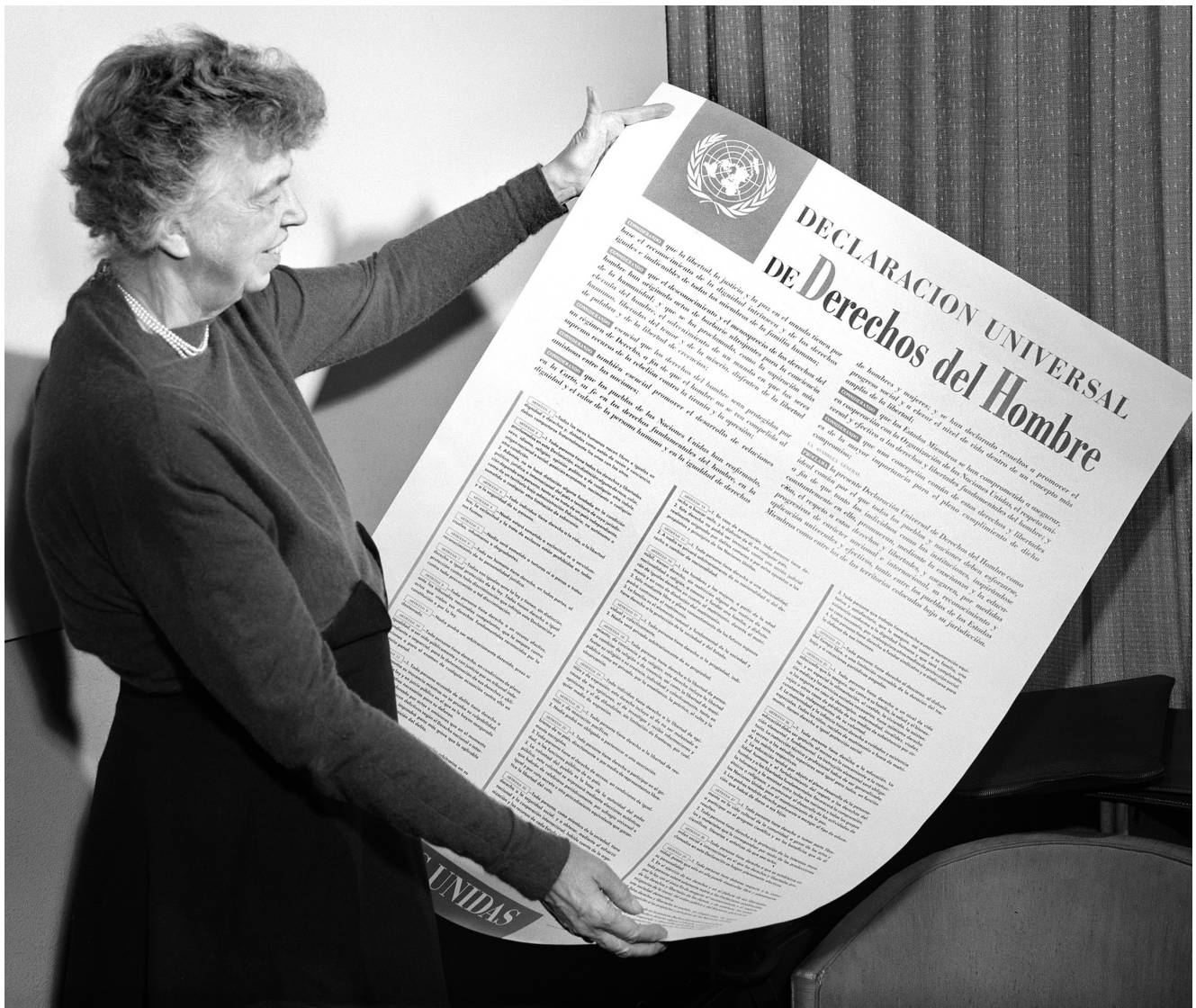
Eleanor Roosevelt of the United States holding a Universal Declaration of Human Rights poster in Spanish.

In contrast, the drug control bodies nested within the UN were explicitly framed as a continuation of the pre-existing international institutions. In 1946, the Economic and Social Council (ECOSOC) established the UN Commission Narcotic Drugs (CND) as a successor to the Opium Advisory Committee of the League of Nations, with a formalised transfer of responsibilities. 17 The international drug control treaties that had been developed since 1912 remained in force, in large part consolidated within the 1961 Single Convention on Narcotic Drugs and expanded in 1971 and 1988, all overseen by the CND.