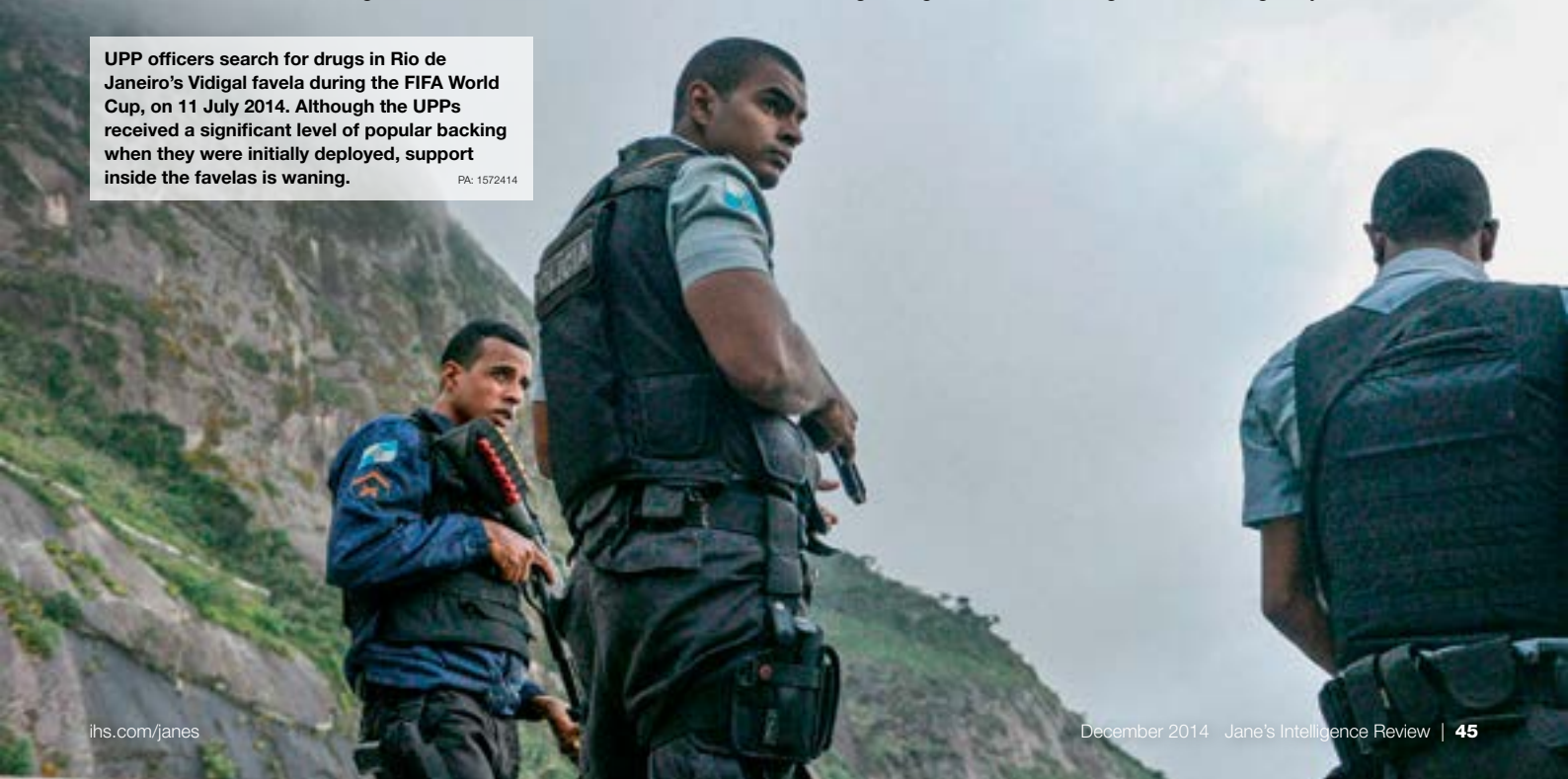
UPP officers search for drugs in Rio de Janeiro's Vidigal favela during the FIFA World Cup, on 11 July 2014. Although the UPPs received a significant level of popular backing when they were initially deployed, support inside the favelas is waning.

However, the pacification programme did fulfil its original aim of deterring bold attacks during the FIFA World Cup (12 June–13 July), especially the previously common practices of criminal groups attacking civilians and blocking tunnels and highways close to