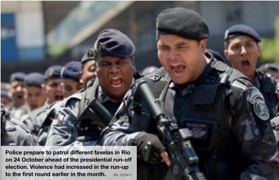
Police prepare to patrol different favelas in Rio on 24 October ahead of the presidential run-off election. Violence had increased in the run-up to the first round earlier in the month.

but lack the sheer numbers and impressive displays of hardware that usually take place during the initial occupations.