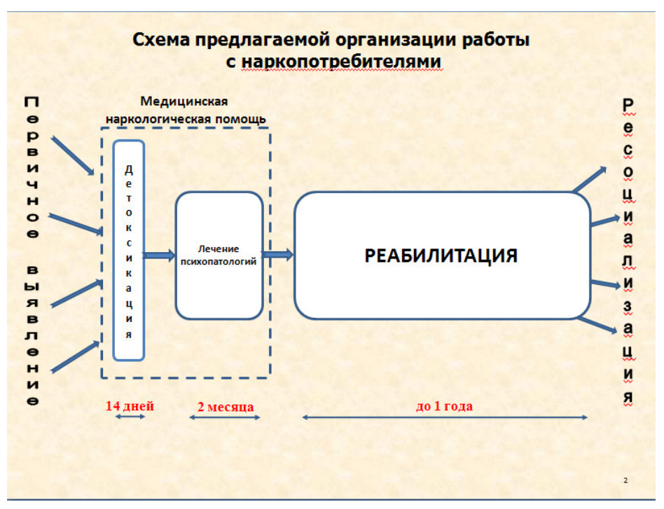
Diagram 1. Ivanov's proposed 'Scheme of organizing work with drug users' from 2011, incorporating 14 day detoxification, 2 months psychological support, and up to a year of rehabilitation leading to 're-socialization'

Despite a diversification of measures to treat addiction, one of the biggest gaps in existing capacity remains at the level of social rehabilitation; state efforts to create rehabilitation centres only began in 2000, and in 2006 they still only existed in 26 regions.<sup>39</sup> Most strikingly, this fact was also acknowledged in 2011 by the current serving head of the FSKN, Viktor Ivanov, as the area where most change needed to occur. In connection with a new law of 23 August 2011 allowing state support to non-commercial organisations engaged in drug rehabilitation, Ivanov publicly recognized catastrophically high existing remission rates amongst addicts undergoing treatment, as a result of which 'existing models of treatment are simply not