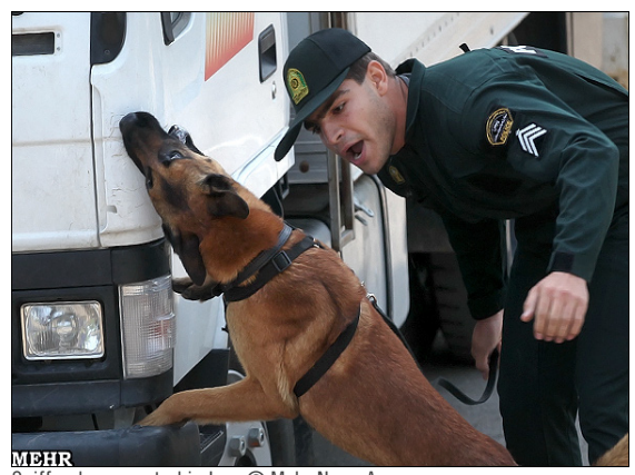
Sniffer dog on patrol in Iran

In November 2006, the former head of UNODC said that UNODC would give US$22 million to the Iranian authorities to bolster their efforts to combat drug trafficking. These funds were said to be intended to strengthen Iran's eastern border against drug traffickers and for intelligence activities by police in that part of the country. According to UNODC, the help it has given the Iranian authorities, <sup>22</sup> such as supporting training projects for counter-narcotics forces, aiding sniffer dog programmes – supported by donations from