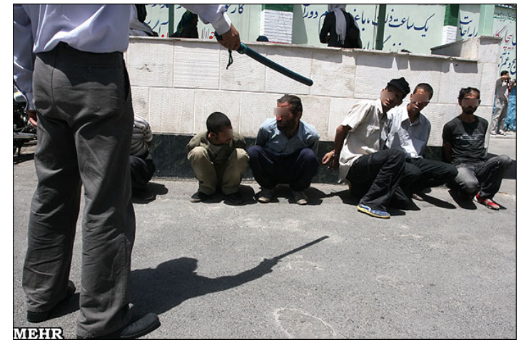
Iranian police rounding up drug addicts in June 2011

In December 2010, the Interior Ministry announced plans to set up five new rehabilitation centres to treat thousands of drug addicts in the provinces of Esfahan, Kerman, Khorasan, Sistan-Baluchistan and Tehran, and said that 36,000 inmates serving time for drug-related offences would be transferred there.39 In August 2011, the Minister of Justice,