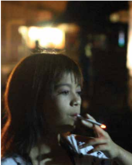
Indonesian Planned Parenthood Association, an IPPF Member Association, is integrating HIV and harm reduction services for people who use drugs within sexual and reproductive health services.