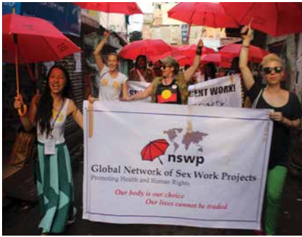
Global Network of Sex Work Projects protest in Kolkata.

The Department for International Development's position on HIV and AIDS was outlined in their 2011 position paper Towards Zero Infections . In 2013, STOPAIDS was a partner to DFID on the review of that paper and broadly welcomed Towards Zero Infections – Two Years On 12 (herein Towards Zero Infections ). In particular, we strongly support DFID's focus on key populations as one of three policy priorities to 2015, alongside women and girls and integration. In line with that priority, one of DFID's key targets is to reduce HIV infections in most-at-risk populations, with the aim of maintaining general HIV prevalence at less than 1% in at least six countries. Towards Zero Infections lists eight countries in Asia where DFID has supported key population programmes including Cambodia, Nepal, India, Vietnam, Burma, Kyrgyzstan, Tajikistan and Uzbekistan. 13 Across these programmes DFID has targeted sex workers, men who have sex with men and people who inject drugs, distributing over 100 million condoms and 45 million needles and syringes, and providing more than 6,700 people with substitution therapy. These results testify to DFID's commitment to key populations in recent years. However, as we discuss below, all but one of these programmes will have closed by the end of 2014.