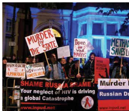
Harm reduction organisations, supported by the International Network of People who Use Drugs (INPUD), gathered outside the Russian embassy in London on World AIDS Day as part of a global unified Shame Russia Shame campaign.

people, DFID also has an important role to play, especially in countries such as Uganda and Nigeria where it funds significant HIV programmes. DFID's response to the introduction of anti-gay laws in these two countries was muted, but STOPAIDS hopes that the development of a government LGBT equality strategy will help the Department to do more. As should be the case with all policy development relating to key populations, the government must consult with LGBT people who face criminalisation and other human rights abuses, including those most affected by HIV, in developing this strategy.