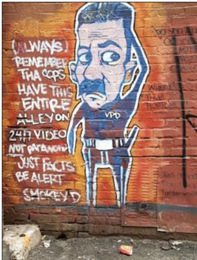
Fig. 2. Graffiti of policing in the alley behind the Street Market. Smokey D, artist | Alley behind the Street Market | Photograph by authors JB and RM (February 21, 2017).

Despite the entrance being in the alley, which falls within most participants' existing social-spatial practices and is thus widely accessed, this narrative magnifies the continuing visibility of such spaces due to police surveillance in the adjoining area. Such visibility was particularly worrisome for some participants at this OPS as it was established outside as a tent, and later trailer, and was thus viewed as more 'open' to police surveillance. While conducting fieldwork, we regularly observed police slowly driving through alleys both adjacent to and at OPS entrances and surrounding areas, or parking cars at alley entrances with the lights turned on. In these instances, individuals selling or using abruptly stopped, turned their backs, or left the area. These practices were further reflected by local graffiti. This particular alley was marked by a wall-sized mural of a police officer with a warning that "cops have this entire alley on 24/7 video" surveillance (see Fig. 2). As such, these surveillance practices remade spaces in ways that increased risk of drug-related harms for structurally vulnerable individuals and were in conflict with public health efforts that were aimed at addressing the overdose crisis.