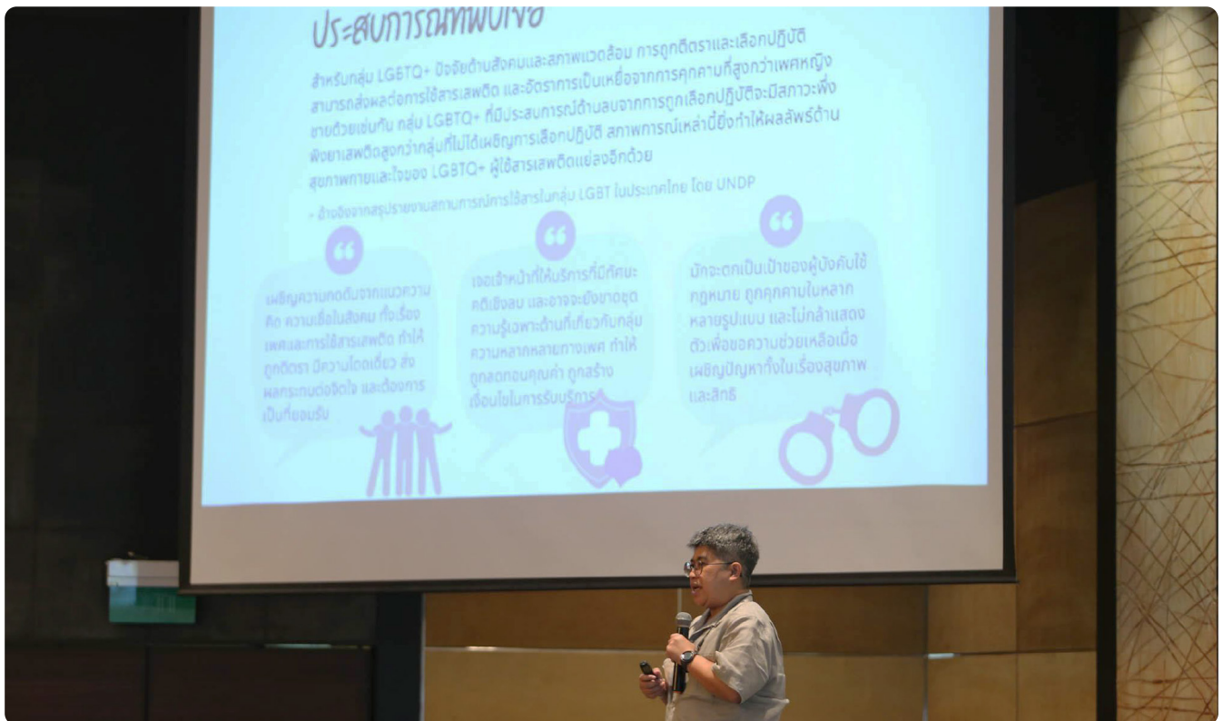
Seminar on access to health services and human rights protection for LGBTQI+ people who use drugs in 2022