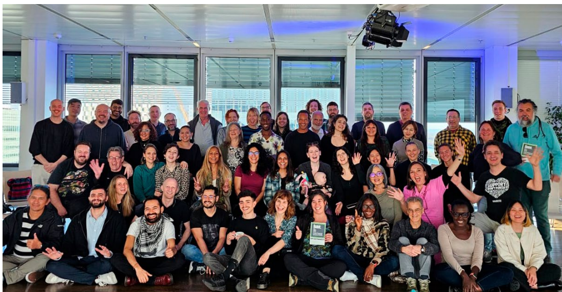
IDPC Members Meeting at the 67th session of the UN Commission on Narcotic Drugs, March 2024.