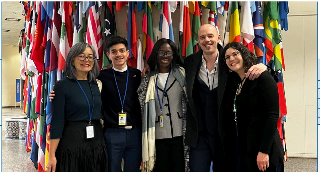
Members of the IDPC team, March 2024.

Fundraising will remain a key area as outlined above, with the aspiration to expand the donor portfolio for IDPC as an organisation as well as bringing new funding to the sector more broadly. Additional funds are required for IDPC’s core team of staff and consultants, as well as to strengthen our capacity to meet the needs and priorities of the network. Our well-functioning, two-tier governance system – comprising an appointed Board of Directors and a Members Advisory Council elected by the membership – will also continue to provide the legal, financial and strategic oversight needed to maintain IDPC’s organisational health.