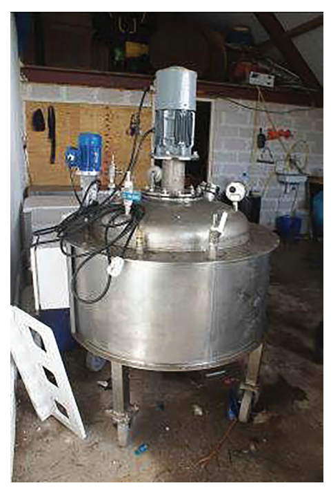
Similar equipment was seized in two locations, which was used for the illicit synthesis of mephedrone. As final product, 26 kg of mephedrone crystals were seized.

These combination sites (where two different products were being manufactured) clearly indicate that OCGs are not just limited to illicit sites where manufacture of traditional synthetic drugs takes place. They use opportunities and market demand to generate more profits.