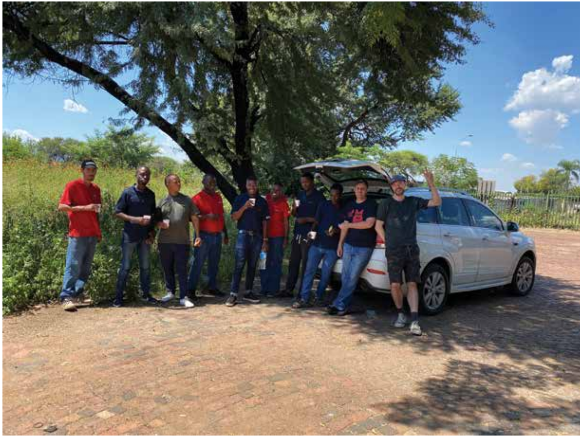
HarmLess outreach team, Pretoria, and Mainline staff, having a break in between site-visits.

It is essential to promote a respectful, open and trustworthy environment within the team. Unequal power relations and stigma among staff need to be recognised and addressed through discussions. It can be useful to rotate tasks and functions where possible. It is good practice to provide all staff with enough time to explore and learn about drug use and drug-using scenes especially in a mixed group comprising people with lived drug use experience and others. This can help to build understanding and cohesion (37).