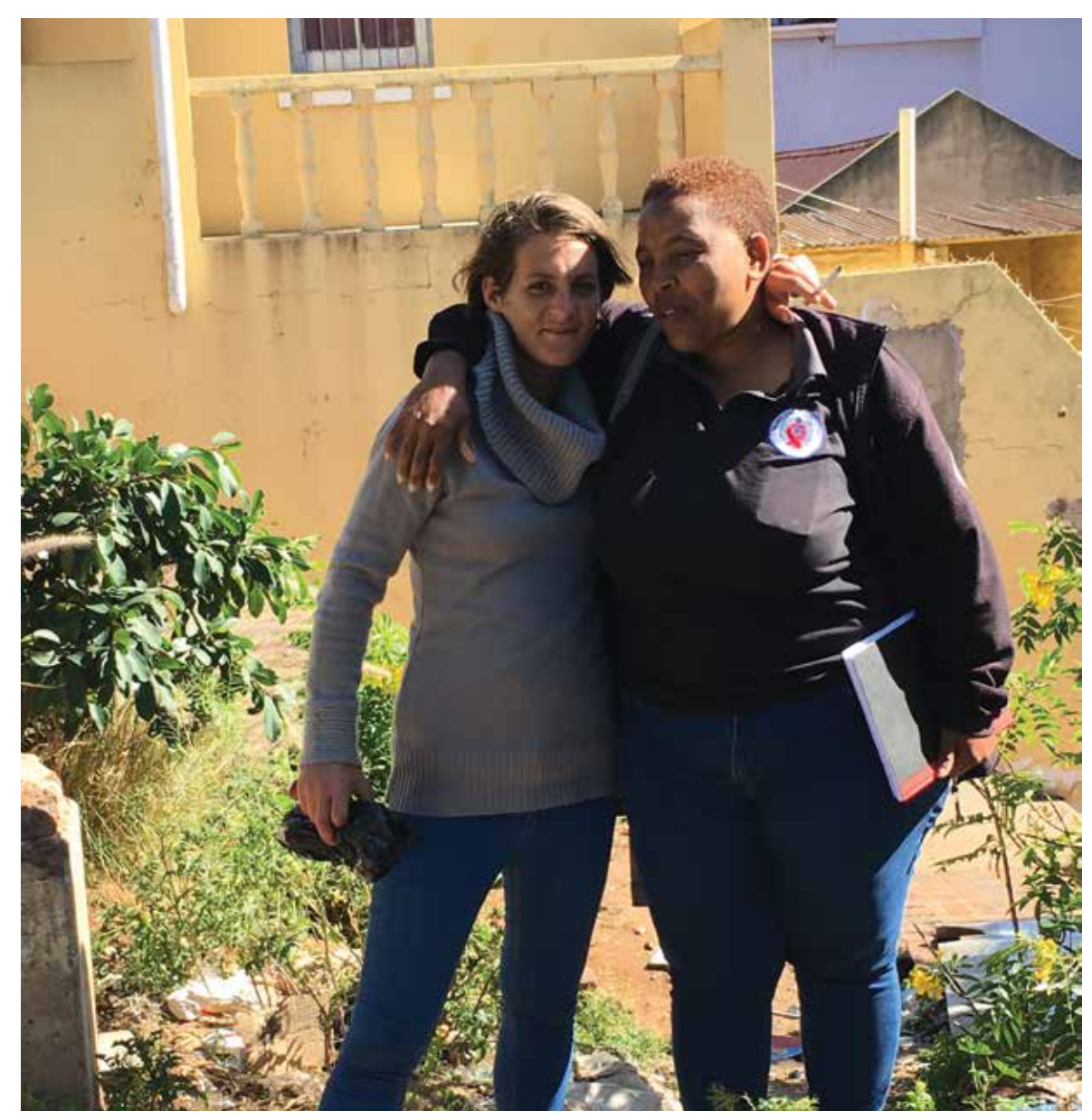
Meaningful involvement and respect. Outreach team, Port Elizabeth.

Good practices are already happening in South Africa and these must be fostered and disseminated widely. The StepUp project operating in Cape Town, Durban, Pietermaritzburg, and Port Elizabeth was developed through an intensive process of consultation and engagement with the PWUD community. PWUD contributed to the determination of the needs of the community, and continually engage in and evaluate service delivery, document and advocate against human rights violations of PWUD, and partake in national policy decision-making process, including the development of the National Strategic Plan and National Drug Master Plan (2,58).