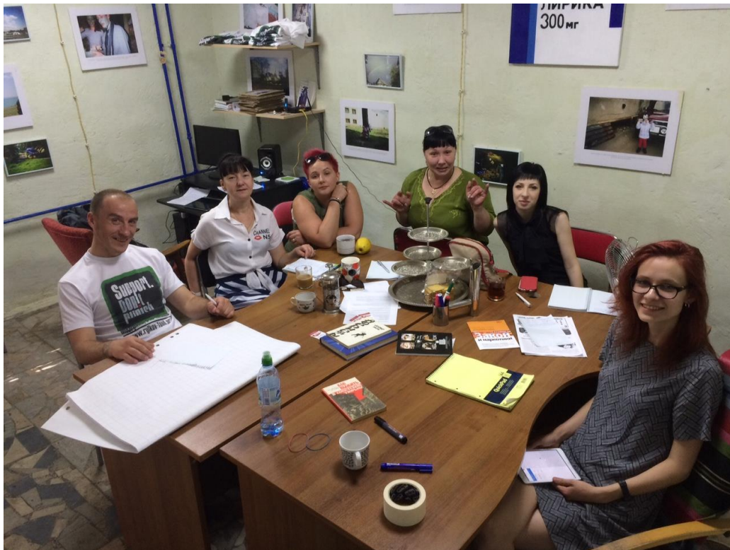
Working at ARF office

Since the participants' first contact with Street Lawyers occurs on the streets, it is very important for us to maintain and establish links between outreach work, health and legal counseling. Street lawyers generally provide legal assistance in drug-related criminal cases and in those cases related to the right to health (access to HIV treatment and hepatitis C treatment, protecting people who use drugs and live with HIV and hepatitis C and experience discrimination). We also receive requests for assistance from people in the penitentiary system, most of whom are detained or charged because of minor non-violent drug offences. We have helped to write solicitation letters based on these complaints. For example, in 2015 our social worker solicited the court to change a woman's pretrial restriction from detention to house arrest. As a result, the woman was released from detention. Later the court gave her a sentence with probation and she was able to avoid prison. More cases are described in this report and in the ARF Street Lawyers report .