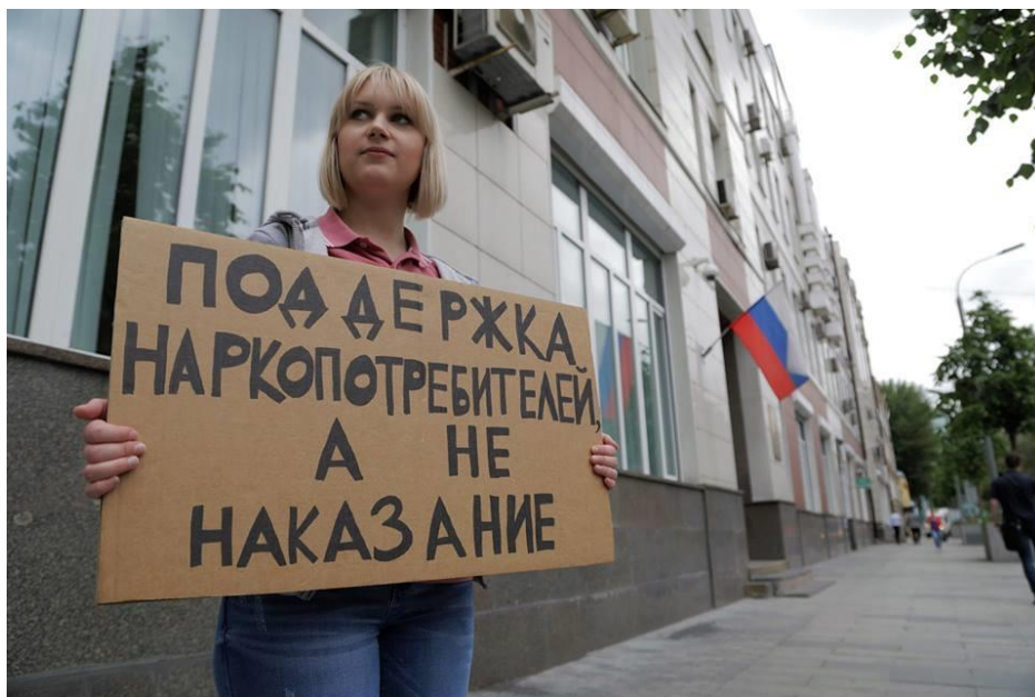
Support. Don't Punish campaign 2016

Advocating for humane drug policies, evidence-based treatment and human rights is a key area of our work. This work includes domestic strategic litigation (discussed below), protests aimed at attracting public attention to the need to change inadequate policies and practices, and communication with the government agencies.