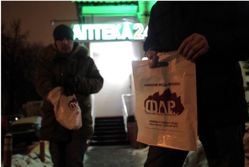
During the outreach work

The main difficulty with case management is the inability of medical and social institutions to adapt to the needs of people who use drugs (e.g. lack of substitution treatment, stigma and discrimination) and consequent human rights violations (e.g. denial of HIV treatment). When visiting medical facilities, drug users face restrictions of their right to health services and are subjected to moral condemnation. Recently there have been more and more such cases because the state has failed to ensure an uninterrupted supply of therapy. That is why we are helping people living with HIV obtain medical assistance and access to ARV therapy.