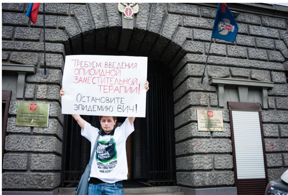
Picketing the office of the Federal Drug Control Services requesting for introduction of OST in Russia. 2015

Documenting and reporting on human rights abuses is an important part of ARF’s work. In 2015 the UN High Commissioner for Human Rights requested Russian civil society’s input in developing the agenda of the UN General Assembly Special Session on Drugs (UNGASS 2016). Responding to this request members of the Russian Civil Society Mechanism for Monitoring of Drug Policy Reforms in Russia, with technical assistance provided by the Andrey Rylkov Foundation and the Canadian HIV/AIDS Legal Network, developed a submission document "Russian Drug Policy as a Distorting Reflection of the UN Drug Conventions: Stigmatizing Language, Overreliance on Punitive Restrictions, Indifference to Human Rights, and Obliteration of Science" , highlighting factors that prevent positive changes in the Russian drug policy, including state promotion of stigma and non-scientific drug treatment methods, restriction of scientific and human rights information under the guise of fighting “drug propaganda”, overreliance on punitive restrictions, and indifference to human rights.