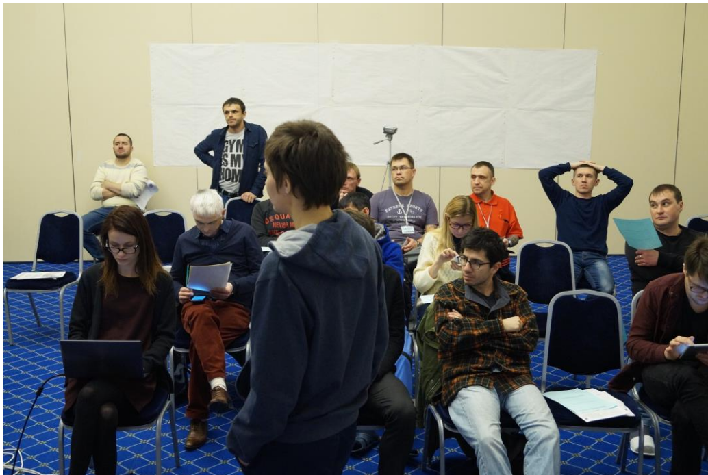
At the First National Forum of People Who Use Drug

Community systems strengthening is an important goal for ARF work. Together with representatives of other community groups, ARF participates in the National Dialogue that coordinates the GFATM funding in Russia and we are proud to have participated in this truly community-led and governed work that helped to sustain harm reduction work as well as work with other populations affected by HIV in Russia.