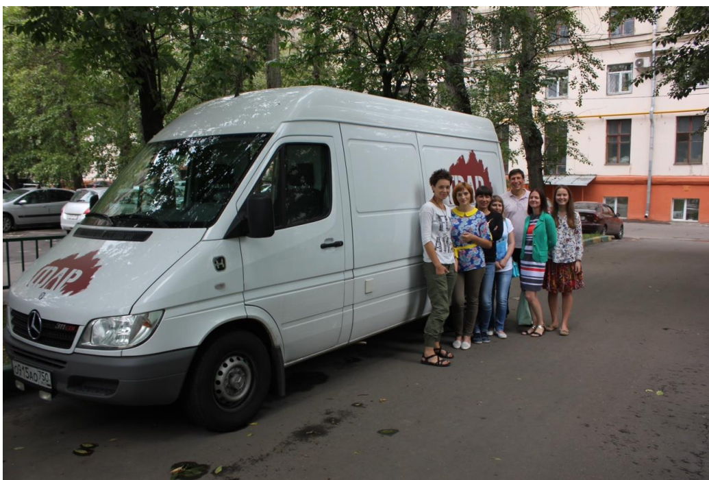
Hosting a study tour for social workers from Togliatti

We also participated in 3 study tours ourselves: to St. Petersburg, Kazan and Rome. The study tour to Rome took place in November 2016. It was organized by the Eurasian Harm Reduction Network and the International Red Cross Federation for Eastern European harm reduction programs. The study tour highlighted the difference between European and Russian approaches to drug use.