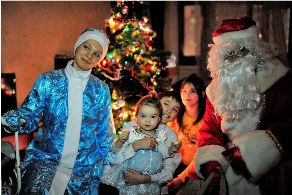
Happy New Year for children of drug users

Experimentanium, and the Children's Musical Theater that provide free tickets for our children. In addition, getting children ready for school can be really costly in Russia and for our project participants that can turn into a little family Apocalypse. That's why we have raised funds through a crowdfunding campaign to support the parents' efforts to send their children to school. As a result, we bought a lot of useful things for the kids: several school uniforms, backpacks, cold weather boots and shoes to wear at school or indoors, and other accessories.