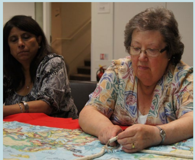
Older carers participating in an artifact-handling session at The British Museum

We are all very different and come from different perspectives, but it just works. Knowing others are going through it too, you don't feel so bad. I really value the information and advice that we get; that is the most useful for me.'