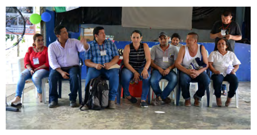
New board of directors of ANZORC, December 2018