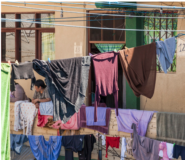
Clothes drying in the courtyard of the San Sebastian women's prison in Cochabamba, Bolivia.

procedures code eliminated special drug courts, strong state and societal pressure on judges to convict drug offenders persists. Similarly while pretrial detention is no longer mandated by law as a result of the 1999 reform, in practice it continues to be the norm for drug offenses.