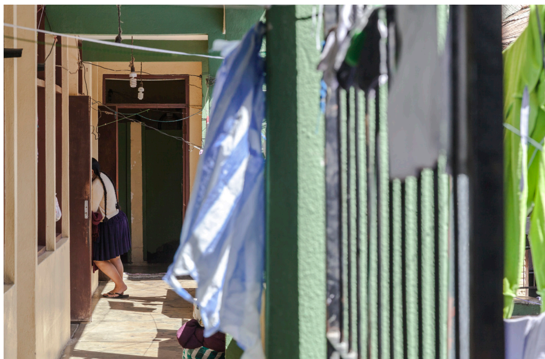
A woman incarcerated in the San Sebastian Prison in Cochabamba, Bolivia.

Finally, the voices of women impacted by drug policies must be included in the debate, in order to develop and implement more effective, humane and inclusive initiatives, grounded in public health and human rights.