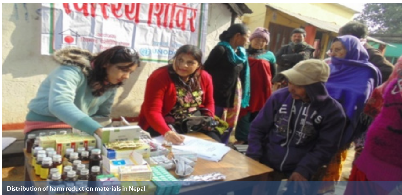
Distribution of harm reduction materials in Nepal