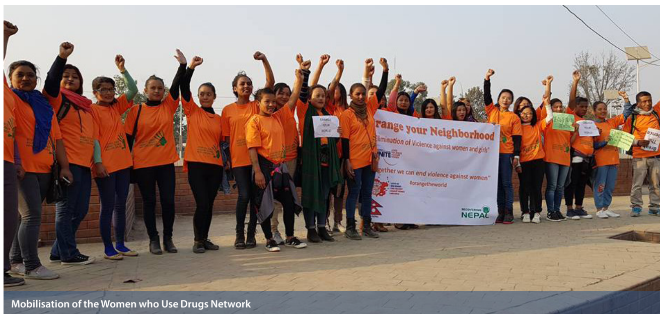
Mobilisation of the Women who Use Drugs Network

individuals are not detained against their will. 91 The UN Working Group on Arbitrary Detention has urged countries to investigate and remedy human rights abuses in so-called drug treatment and rehabilitation centres established and run by private individuals or organisations. 92