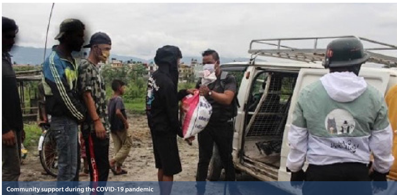
Community support during the COVID-19 pandemic

Nearly 11% of the respondents surveyed in the Nepal Drug Users' Survey, 2076 (2019) reported experiencing violence during treatment 81 – the extent and severity of which has been documented in independent reports. With little or no oversight, supervision and training, some private rehabilitation centres blatantly violate the rights of people who use drugs by inflicting 'torture' as 'treatment' and 'violence' as 'therapy'. 82 Practices documented at such centres include forcible detention and involuntary admission, denial of medical care and management of withdrawal, solitary confinement, forced labour, flogging, beating and other inhuman and degrading 'punishments' to 'discipline' and 'cure' people who use drugs. 83 Several cases of attempted suicide and even deaths of inmates have been reported from such centres. 84 Complaints of torture and brutality are rarely investigated by the authorities; on the contrary, it is the victims (i.e. people who use drugs) who are deemed to be morally debased and blameworthy. 85