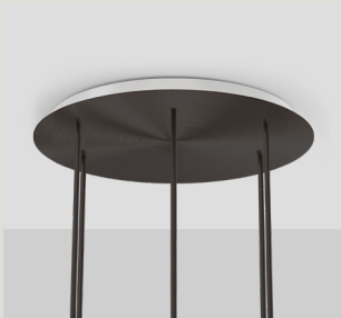
CIRCULAR FIXED CANOPY CAN.VC.CIR.X-XXX Ø600 X 37MM / 23.6" X 1.5" DRIVER HOUSED IN CANOPY

ALL ROSS GARDAM CEILING MOUNTED FIXTURES COME SUPPLIED WITH A CEILING CANOPY UNLESS OTHERWISE SPECIFIED. EACH CANOPY INCLUDES ELECTRICAL CONNECTORS, EARTH WIRE AND CABLE RETENTION TO CONNECT TO MAINS POWER. THE BELOW IMAGES DEPICT THE CEILING CANOPIES AVAILABLE WITH EACH FIXTURE TYPE. IF NO CANOPY IS SELECTED THE CIRCULAR CANOPY WILL BE SUPPLIED.