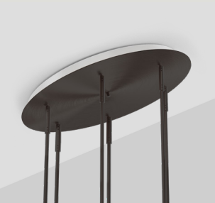
CIRCULAR FIXED SWIVEL CANOPY CAN.VC.CIR.SW.X-XXX Ø600 X 37MM / 23.6" X 1.5" DRIVER HOUSED IN CANOPY