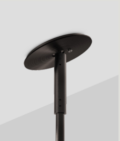
SLIM Ø14MM FIXED SWIVEL CANOPY CAN.SL.F14.SW.X-XXX Ø120 X 7MM / 4.7" X 0.3" DRIVER HOUSED IN CEILING