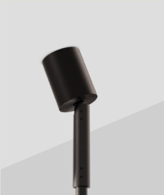
PUCK Ø14MM FIXED SWIVEL CANOPY CAN.PK.F14.SW.X-XXX Ø50 X 65MM / 2" X 2.6" DRIVER HOUSED IN CEILING