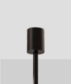
PUCK Ø14MM FIXED CANOPY CAN.PK.F14.X-XXX Ø50 X 65MM / 2" X 2.6" DRIVER HOUSED IN CEILING