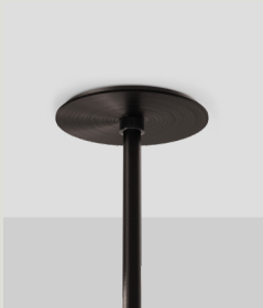
SLIM Ø14MM FIXED CANOPY CAN.SL.F14.X-XXX Ø120 X 7MM / 4.7" X 0.3" DRIVER HOUSED IN CEILING