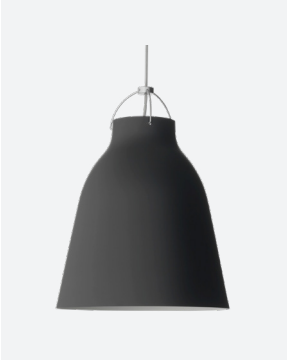
Color: Black (Matt) Cord: Grey45 Item: 14290208