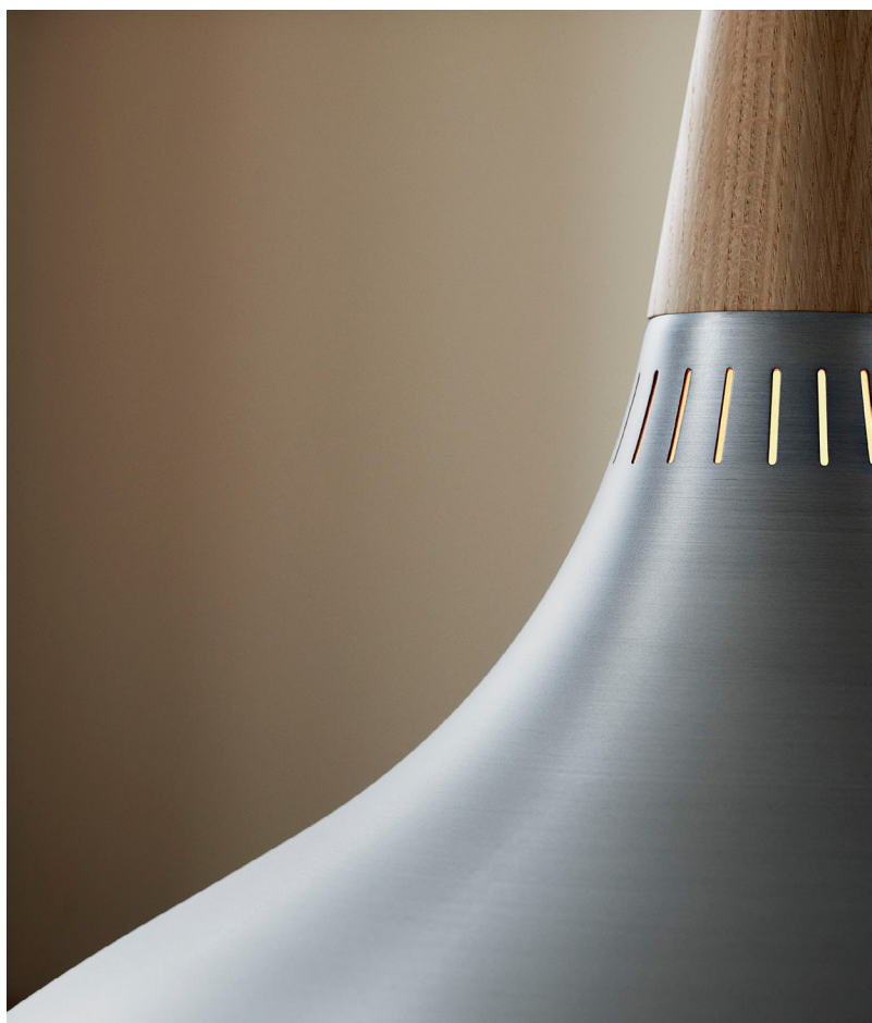
Orient™ pendant in Aluminum and Oak.