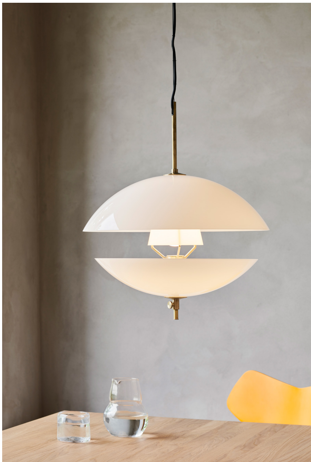
Clam™ pendant (Ø440).