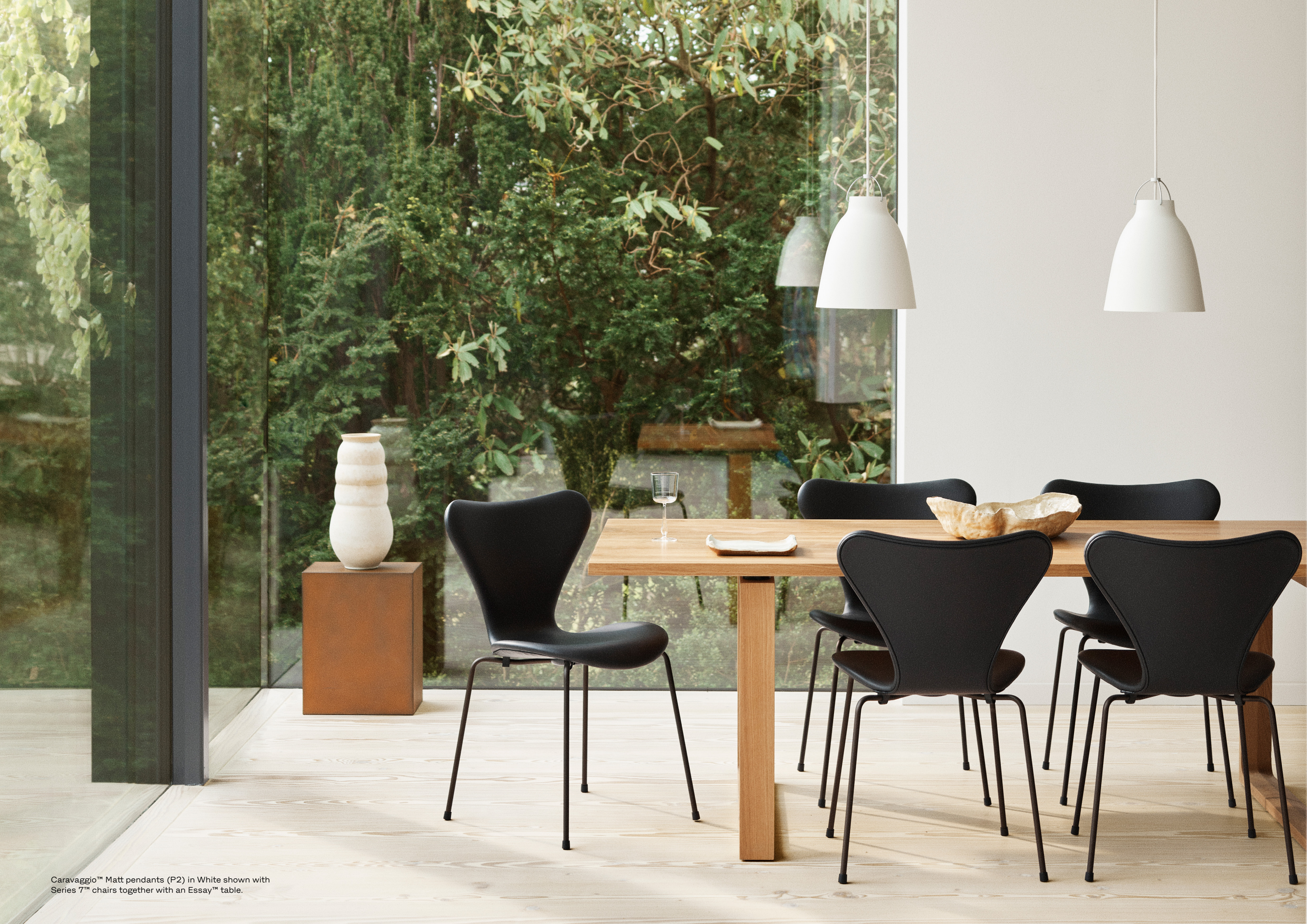
Caravaggio™ Matt pendants (P2) in White shown with Series 7™ chairs together with an Essay™ table.