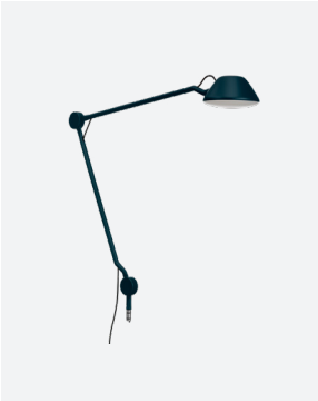
Color: Blue Cord: Blue Item: 62716106

Category: Table lamp (Plug-in) Dimensions: Height: 17.8 in Width: 17.7 in Cord specifications: Length: 98 in Material: PVC Materials: Shade/Base: Aluminum Diffuser: Polycarbonate (PC) Weight: 1,1 lb Light source: LED (Built-in) Features: Tilttable, Swivel, Dimmable