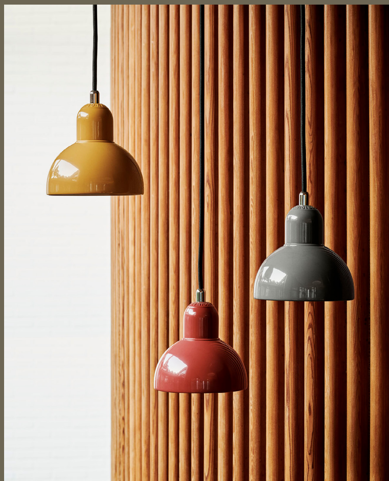
KAISER idell™ pendants (6722-P) in Soft Ochre, Smooth Slate, and Russet Red.