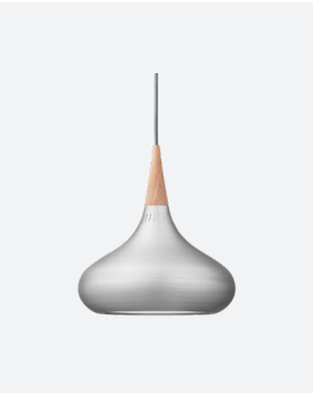
Color: Aluminium/Oak Cord: Grey Item: 84719072

Category: Pendant Model: P1 Dimensions: Height: 9.6 in Diameter: 8.8 in Cord specifications: Length: 118 in Material: Textile Materials: Aluminum/Oak Black lacquered aluminum/Rosewood Copper/Rosewood Weight: 1.5 lb (Copper: 2.6 lb) Socket: E26 max 60W