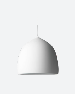
Color: White Cord: White Item: 74708805

Isolation class: Class II IP rating: IP20 (Dry location) Certification: cULus Canopy: Black (Black, Copper), White (White, Light Grey)