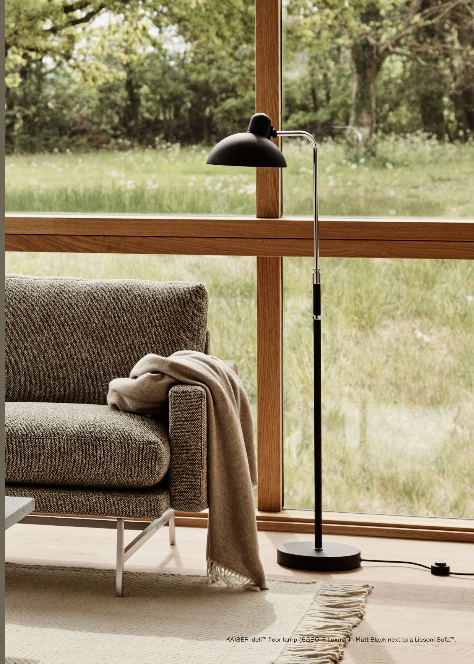
KAISER idell™ floor lamp (6580-F Luxus) in Matt Black next to a Lissoni Sofa™.

All KAISER idell™ lighting is characterised by Christian Dell's ability to create elegant design with the basic hallmarks of Modernism: geometric shapes. The entire lighting design series, while diverse in its expressions, is united by its Bauhaus origin, timelessness and clever details.