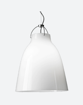
Color: Opal glass Item: 94272205

Category: Pendant Model: P2 Dimensions: Height: 13.2 in Diameter: 10.1 in Cord specifications: Length: 118 in Color: Silver-grey Material: Textile w. wire Materials: Shade: Opal glass Suspension: Steel Weight: 4.4 lb Socket: E26 max 100W