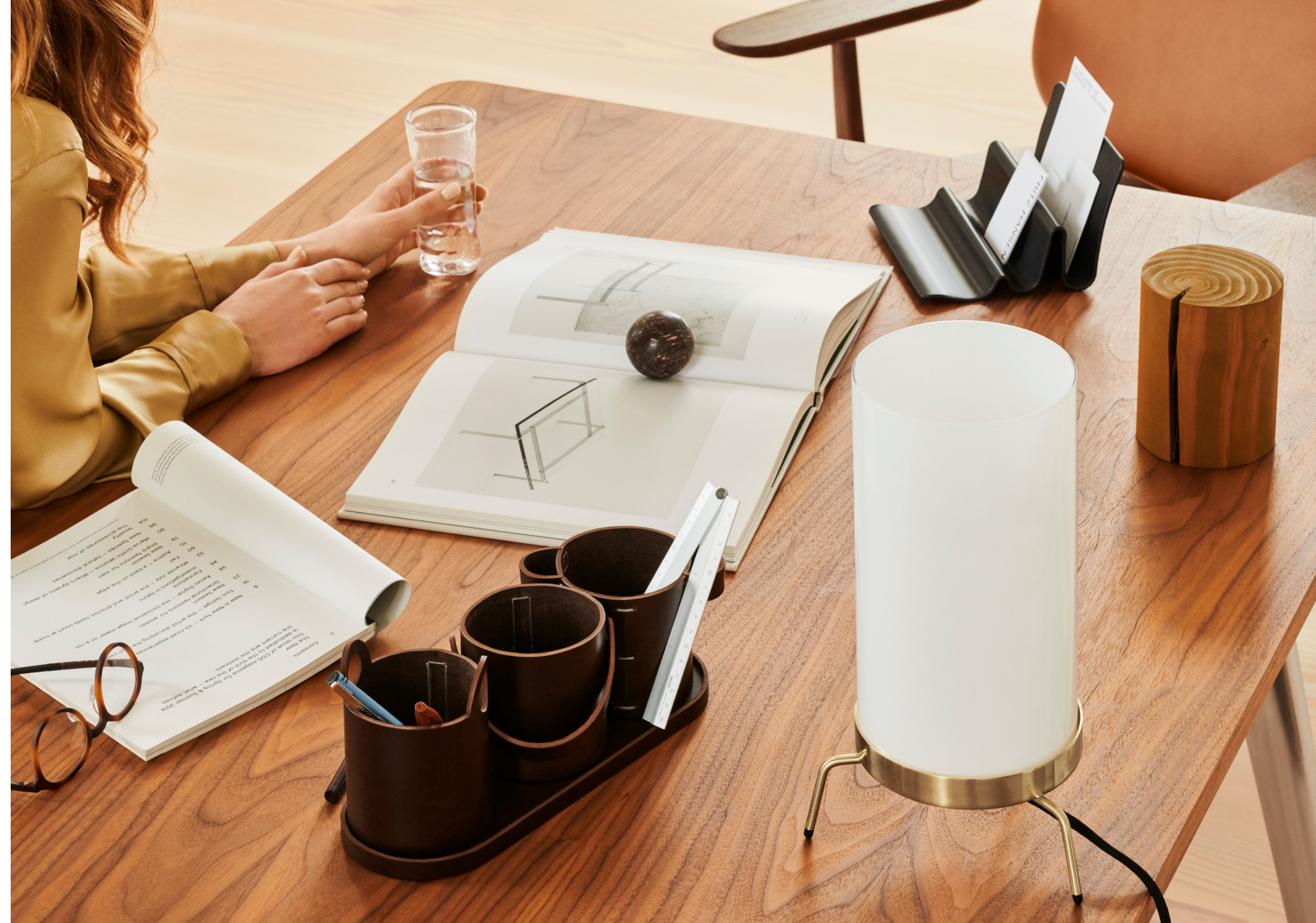
PM-02 table lamp in Brass.