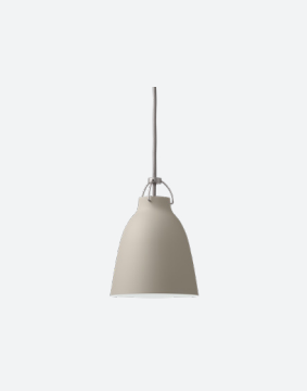
Color: Warm Silk (Matt) Cord: Grey45 Item: 74715012

Category: Pendant Model: P1 Dimensions: Height: 8.5 in Diameter: 6.4 in Cord specifications: Length: High-gloss: 118 in / Matt: 236 in Color: Varies w. shade Color Material: Textile Materials: Shade: Steel Suspension: Steel Weight: 1,8 lb Socket: E12 max 60W