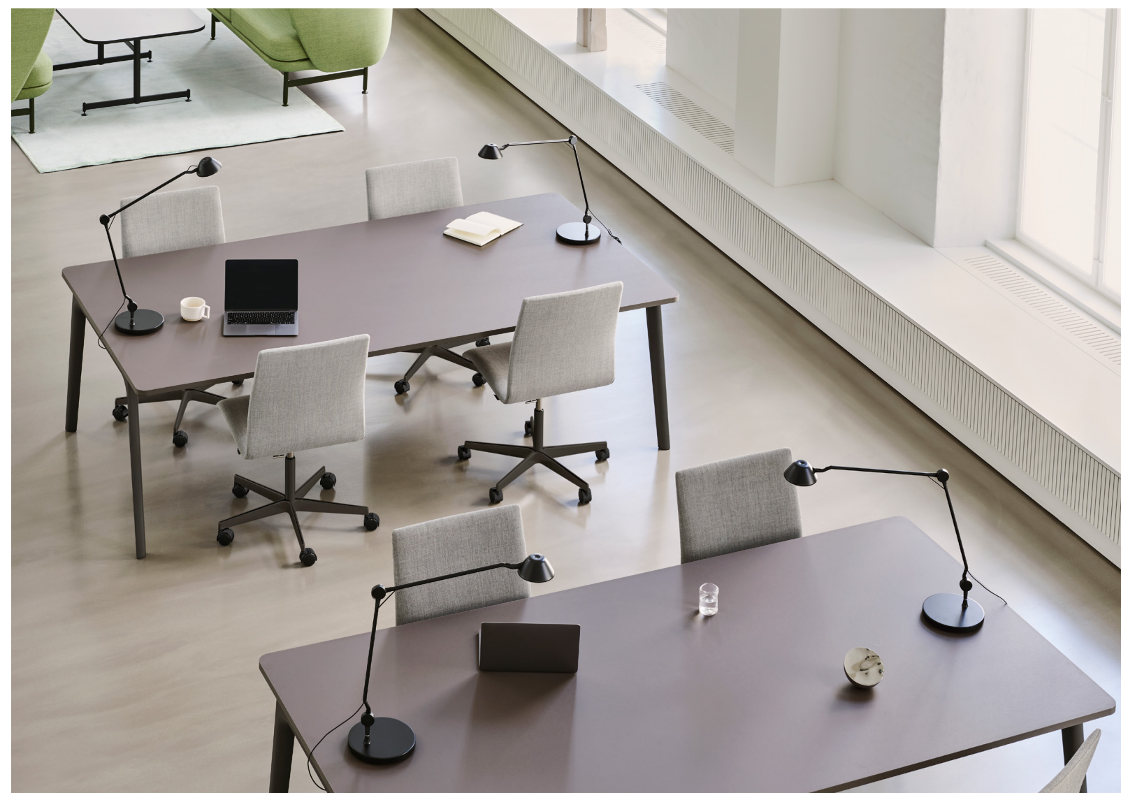
AQ01™ table lamp in Black on a Pluralis™ table paired with Oxford™ chairs.

The AQ01™ offers a fresh take on the classic architect's desk light. Distinguished by its delicate lines and matt finish, the light offers a refined elegance and genius utility. Technology allows springs to be hidden within the design and AQ01's shade to be switched on and off, or dimmed up and down, with the touch of a hand on the lamp's shade.