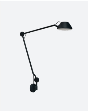
Color: Black Cord: Black Item: 62698708