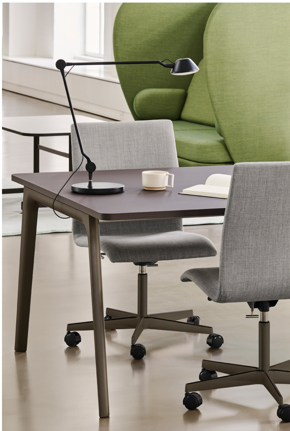
AQ01™ table lamp in Black on a Pluralis™ table paired with Oxford™ chairs.