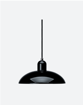
Color: Black Item: 64701008

Category: Pendant Model: 6631-P Dimensions: Height: 5.3 in Diameter: 11.2 in Cord specifications: Length: 118 in Color: Black Material: Textile Materials: Steel/Chrome Weight: 2.2 lb Socket: E26 max 60W