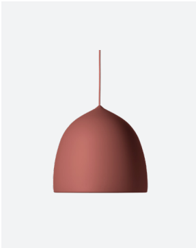
Color: Powder Burgundy Cord: Powder Burgundy Item: 84718301

Category: Pendant Model: P1.5 Dimensions: Height: 11.7 in Diameter: 12.6 in Cord specifications: Length: 236 in Material: PVC Materials: Shade: Aluminum Diffuser: Polycarbonate (PC) Weight: 2,1 lb Socket: E26 max 50W