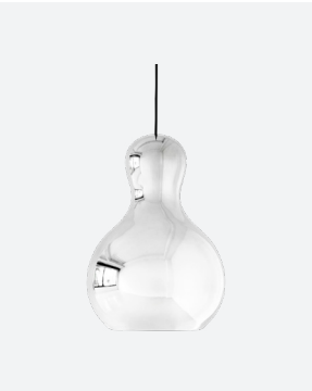
Color: Silver Item: 14285172

Category: Pendant Model: P2 Dimensions: Height: 12 in Diameter: 8.8 in Cord specifications: Length: 236 in Color: Black Material: Textile Materials: Aluminum Weight: 1,8 lb Socket: E26 max 60W