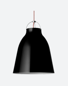
Color: Black (High-gloss) Cord: Red Item: 74271408