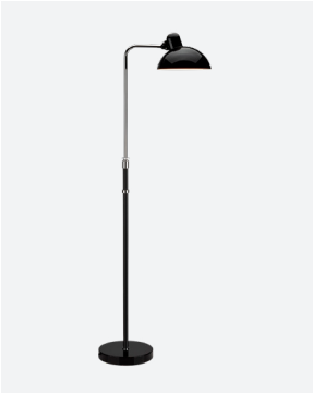
Color: Black Item: 61704508