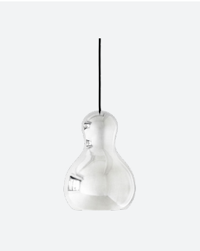
Color: Silver Item: 14284172

Category: Pendant Model: P1 Dimensions: Height: 8.3 in Diameter: 6.2 in Cord specifications: Length: 236 in Color: Black Material: Textile Materials: Aluminum Weight: 1,3 lb Socket: E26 max 40W