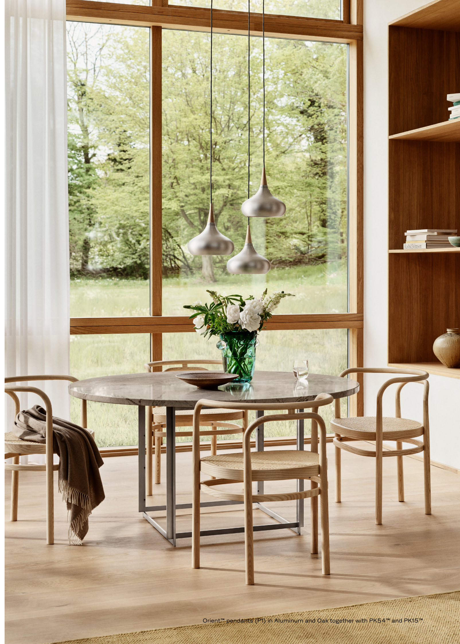
Orient™ pendants (P1) in Aluminum and Oak together with PK54™ and PK15™.

The Orient™ pendant was created by Jo Hammerborg in 1963 and relaunched by Fritz Hansen in 2013. The fitting elegantly conceals a low energy light source and ensures a soft, pleasant light without any glare. The shade is hand spun in a wooden mould, a feature that underlines the original, organic shape and true craftsmanship of this beautiful pendant design.