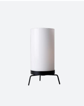
Color: Opal/Black Item: 82719808

Isolation class: Class II IP rating: IP20 (Dry location) Certification: cULus