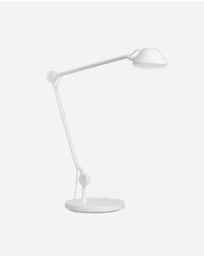
Color: White Cord: White Item: 62699105

Isolation class: Class II IP rating: IP20 (Dry location) Certification: cULus Energy label: G