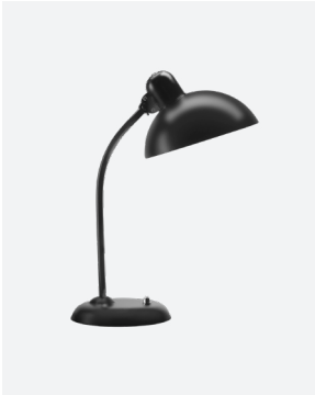
Color: Matt Black Item: 62703408

Category: Table lamp Model: 6556-T Dimensions: Height: 18.5 in Diameter (shade): 8.5 in Diameter (base): 7.3 in Cord specifications: Length: 78 in Color: Black Material: Textile Materials: Steel/Chrome Weight: 5,3 lb Socket: E26 max 25W Features: Tilttable