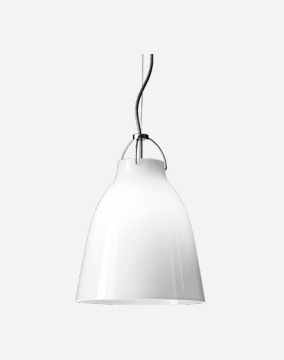
Color: Opal glass Item: 94272105

Category: Pendant Model: P1 Dimensions: Height: 8.5 in Diameter: 6.4 in Cord specifications: Length: 118 in Color: Silver-grey Material: Textile Materials: Shade: Opal glass Suspension: Steel Weight: 2.0 lb Socket: E12 max 60W