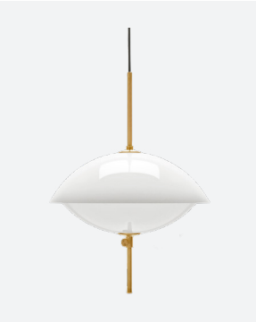
Color: Opal/Brass Item: 94724405

Isolation class: Class I IP rating: IP20 (Dry location) Certification: cULus Canopy: Brass (untreated)*