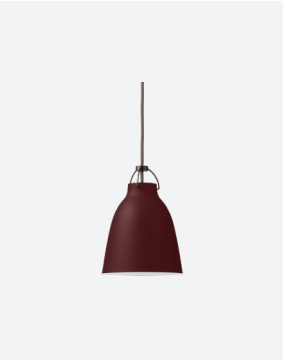
Color: Dark Sienna (Matt) Cord: Grey45 Item: 74715101