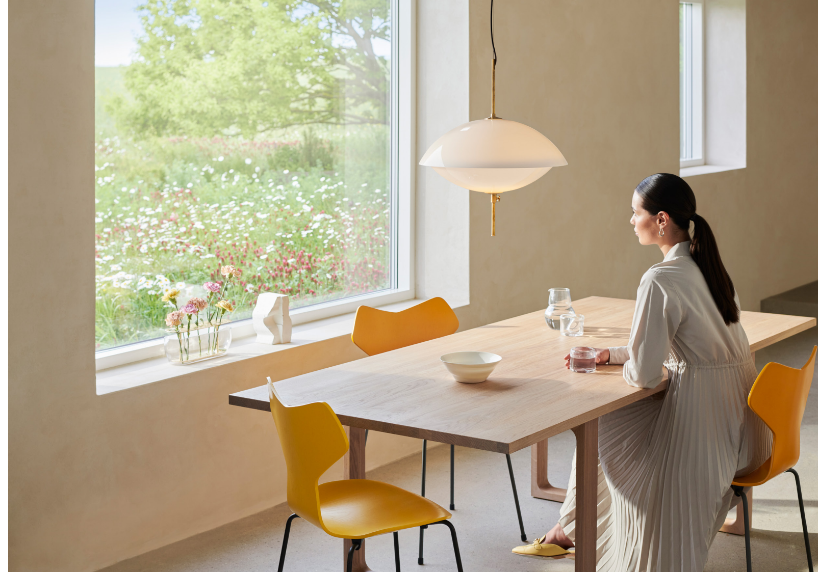
Clam™ pendant (Ø550) above an Essay™ table with Grand Prix™ chairs.