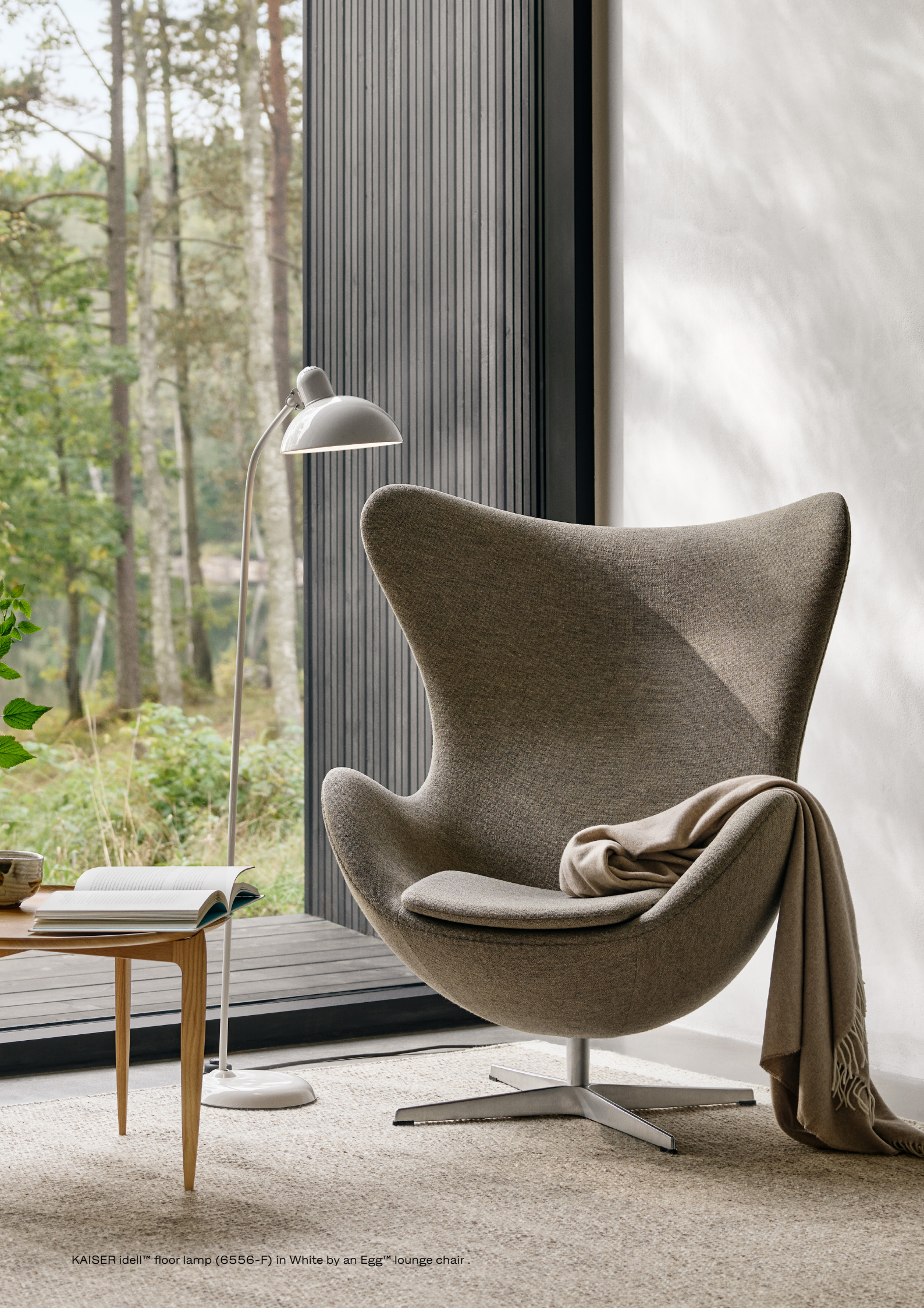
KAISER idell™ floor lamp (6556-F) in White by an Egg™ lounge chair .