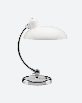
Color: White Item: 62701805

Isolation class: Class II IP rating: IP20 (Dry location) Certification: cULus Canopy: Chrome