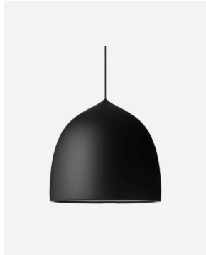
Color: Black Cord: Black Item: 74708908