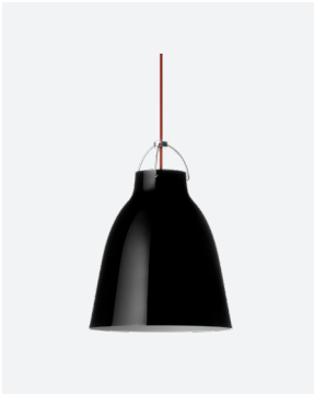
Color: Black (High-gloss) Cord: Red Item: 54270108