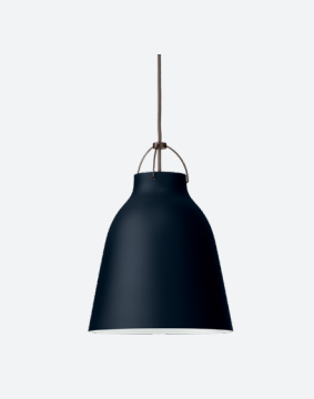
Color: Dark Ultramarine Cord: Grey45 Item: 74715203