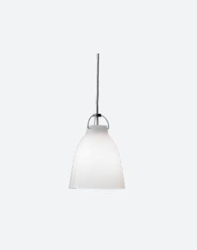
Color: Opal glass Item: 94272005

Isolation class: Class II IP rating: IP20 (Dry location) Certification: cULus Canopy: White