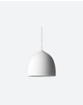
Color: White Cord: White Item: 74708405

Isolation class: Class II IP rating: IP20 (Dry location) Certification: cULus Canopy: Black (Black, Copper, Pale Pearl), White (White, Light Grey, Powder Burgundy)