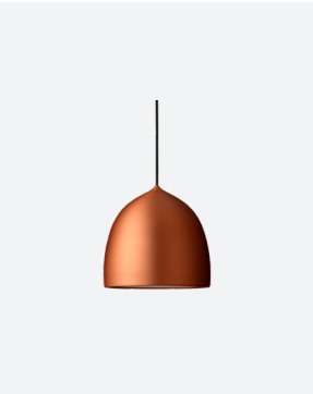
Color: Copper Cord: Black Item: 74708725

Category: Pendant Model: P1 Dimensions: Height: 8.8 in Diameter: 9.4 in Cord specifications: Length: 236 in Material: PVC Materials: Shade: Aluminum, Polished copper Diffuser: Polycarbonate (PC) Weight: 2,2 lb (Copper: 3,1 lb) Socket: E26 max 50W