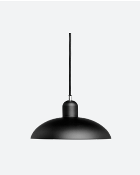
Color: Matt Black Item: 64701108

Category: Pendant Model: 6631-P Dimensions: Height: 5.3 in Diameter: 11.2 in Cord specifications: Length: 118 in Color: Black Material: Textile Materials: Steel/Chrome Weight: 2.2 lb Socket: E26 max 60W