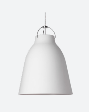
Color: White (Matt) Cord: White Item: 14288613