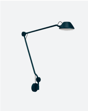
Color: Blue Cord: Blue Item: 62698906

Category: Wall lamp Dimensions: Height: 17.8 in Width: 17.7 in Cord specifications: Length: 98 in Material: PVC Materials: Shade/Base: Aluminum Diffuser: Polycarbonate (PC) Weight: 1,1 lb Light source: LED (Built-in) Features: Tilttable, Swivel, Dimmable