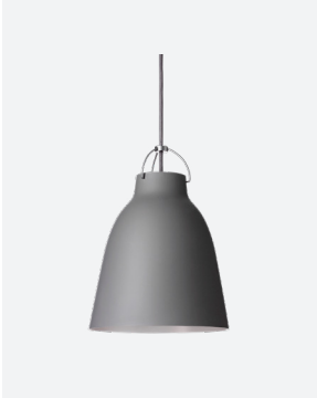
Color: Grey45 (Matt) Cord: Grey45 Item: 14288212

Category: Pendant Model: P2 Dimensions: Height: 13.2 in Diameter: 10.1 in Cord specifications: Length: High-gloss: 118 in / Matt: 236 in Color: Varies w. shade Color Material: Textile Materials: Shade: Steel Suspension: Steel Weight: 2,4 lb Socket: E26 max 100W