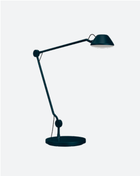
Color: Blue Cord: Blue Item: 62699206

Category: Table lamp Dimensions: Height: 7.3 in Width: 17.7 in Cord specifications: Length: 98 in Material: PVC Materials: Shade/Base: Aluminum Diffuser: Polycarbonate (PC) Weight: 1,1 lb Light source: LED (Built-in) Features: Tilttable, Swivel, Dimmable