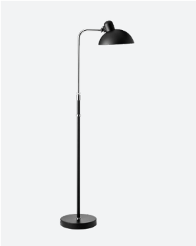
Color: Matt Black Item: 61704608

Category: Floor lamp Model: 6580-F Luxus Dimensions: Height: 49.2-53.1 in Diameter (shade): 8.5 in Diameter (base): 8.9 in Cord specifications: Length: 78 in Color: Black Material: Textile Materials: Steel/Chrome Weight: 14,3 lb Socket: E26 max 25W Features: Height adjustable, Swivel