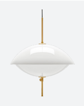
Color: Opal/Brass Item: 94722305

Category: Pendant Model: Ø440 Dimensions: Height: 20.5 in Width: 17.3 in Depth: 17.3 in Cord specifications: Length: 236.2 in Material: Textile w. wire Color: Black Materials: Shade: Opal glass Suspension: Brass (untreated)* Weight: 14.3 lb