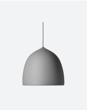
Color: Light Grey Cord: Matt Light Grey Item: 84718512