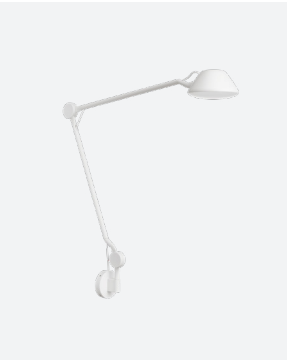
Color: White Cord: White Item: 62698805

Category: Table lamp (Plug-in) Dimensions: Height: 17.8 in Width: 17.7 in Cord specifications: Length: 98 in Material: PVC Materials: Shade/Base: Aluminum Diffuser: Polycarbonate (PC) Weight: 1,1 lb Light source: LED (Built-in) Features: Tilttable, Swivel, Dimmable