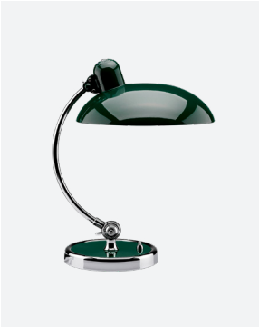
Color: Dark Green Item: 62702206

Category: Table lamp Model: 6631-T Luxus Dimensions: Height: 16.7 in Diameter (shade): 11.2 in Diameter (base): 7.6 in Cord specifications: Length: 78 in Color: Black Material: Textile Materials: Steel/Chrome Weight: 8,4 lb Socket: E26 max 25W Features: Tilttable