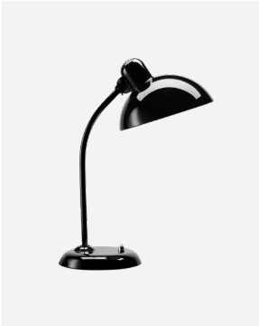
Color: Black Item: 62703308