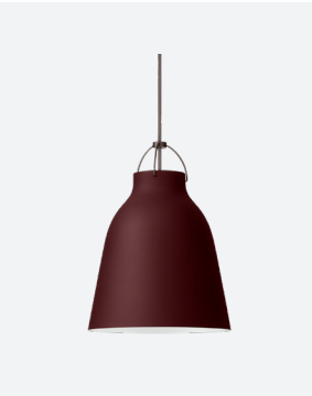
Color: Dark Sienna (Matt) Cord: Grey45 Item: 74715501

Category: Pendant Model: P2 Dimensions: Height: 13.2 in Diameter: 10.1 in Cord specifications: Length: High-gloss: 118 in / Matt: 236 in Color: Varies w. shade Color Material: Textile Materials: Shade: Steel Suspension: Steel Weight: 2,4 lb Socket: E26 max 100W