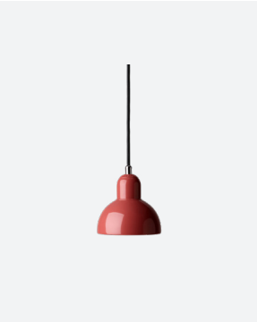
Color: Russet Red Item: 94721301

Category: Pendant Model: 6722-P Dimensions: Height: 6.1 in Diameter: 5.7 in Cord specifications: Length: 118 in Color: Black Material: Textile Materials: Steel/Chrome Weight: 2.2 lb Socket: E26 max 40W