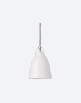
Color: White (High-gloss) Cord: Grey Item: 54270205

Isolation class: Class II IP rating: IP20 (Dry location) Certification: cULus Canopy: White