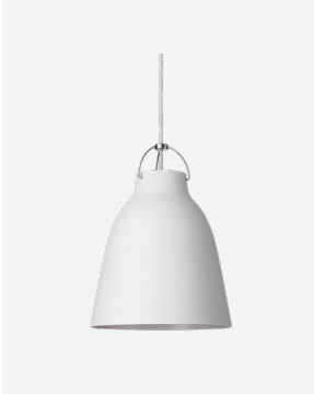
Color: White (Matt) Cord: White Item: 14289413