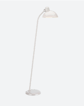
Color: White Item: 61703805

Isolation class: Class II IP rating: IP20 (Dry location) Certification: cULus Canopy: Chrome