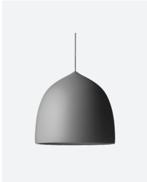
Color: Light Grey Cord: Matt Light Grey Item: 74709012