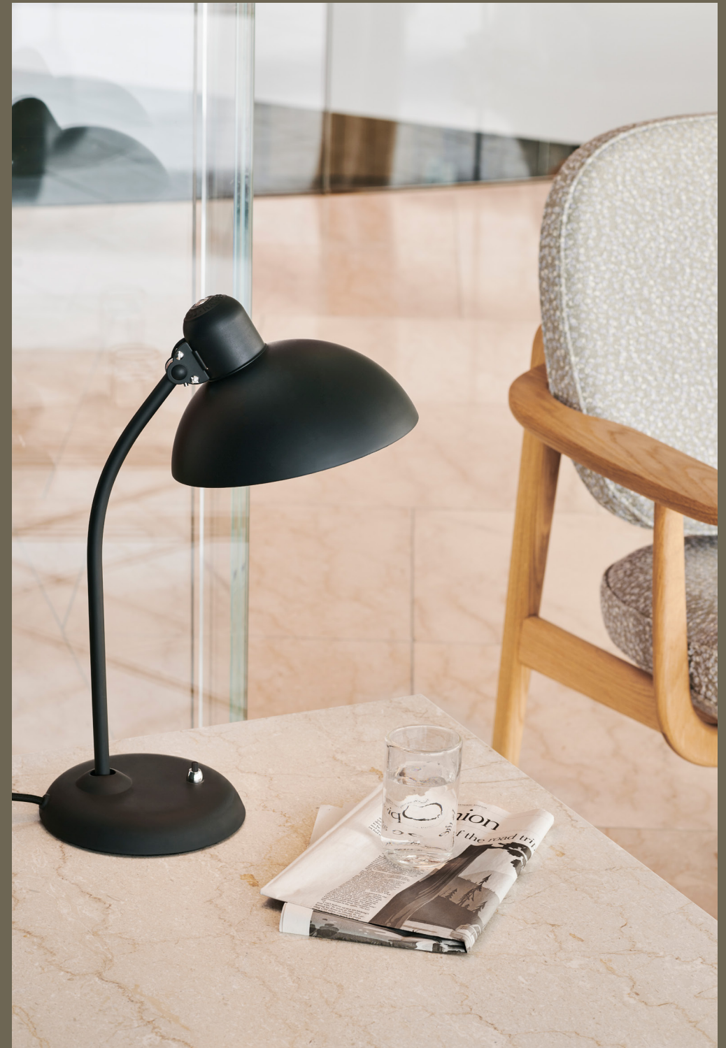
The KAISER idell™ table lamp (6556-T) in Matt Black.