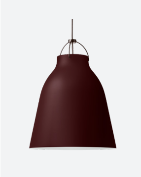
Color: Dark Sienna (Matt) Cord: Grey45 Item: 74715901