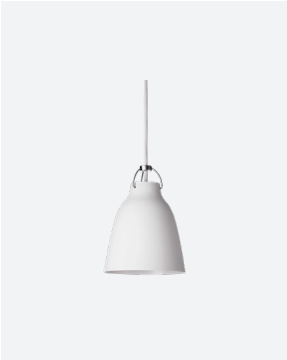
Color: White (Matt) Cord: White Item: 14289213