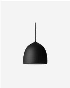
Color: Black Cord: Black Item: 74708508

Category: Pendant Model: P1 Dimensions: Height: 8.8 in Diameter: 9.4 in Cord specifications: Length: 236 in Material: PVC Materials: Shade: Aluminum, Polished copper Diffuser: Polycarbonate (PC) Weight: 2,2 lb (Copper: 3,1 lb) Socket: E26 max 50W