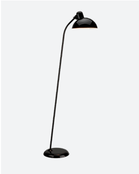
Color: Black Item: 61703908