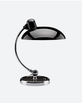
Color: Black Item: 62701908

Category: Table lamp Model: 6631-T Luxus Dimensions: Height: 16.7 in Diameter (shade): 11.2 in Diameter (base): 7.6 in Cord specifications: Length: 78 in Color: Black Material: Textile Materials: Steel/Chrome Weight: 8,4 lb Socket: E26 max 25W Features: Tilttable