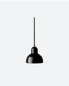
Color: Black Item: 94722008

Category: Pendant Model: 6722-P Dimensions: Height: 6.1 in Diameter: 5.7 in Cord specifications: Length: 118 in Color: Black Material: Textile Materials: Steel/Chrome Weight: 2.2 lb Socket: E26 max 40W