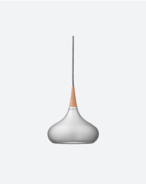
Color: Aluminium/Oak Cord: Grey Item: 84718972

Isolation class: Class II IP rating: IP20 (Dry location) Certification: cULus Canopy: Black (Aluminum/Oak), White (Black/Rosewood, Copper/Rosewood)