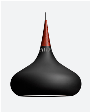
Color: Black/Rosewood Cord: Black Item: 74708308

Category: Pendant Model: P3 Dimensions: Height: 21.2 in Diameter: 19.6 in Cord specifications: Length: 236 in Material: Textile Materials: Aluminum/Oak Black lacquered aluminum/Rosewood Copper/Rosewood Weight: 4.4 lb Socket: E26 max 100W