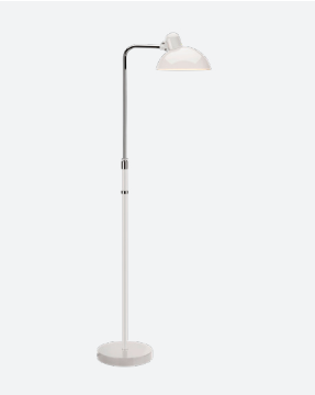
Color: White Item: 61704405

Isolation class: Class II IP rating: IP20 (Dry location) Certification: cULus Canopy: Chrome