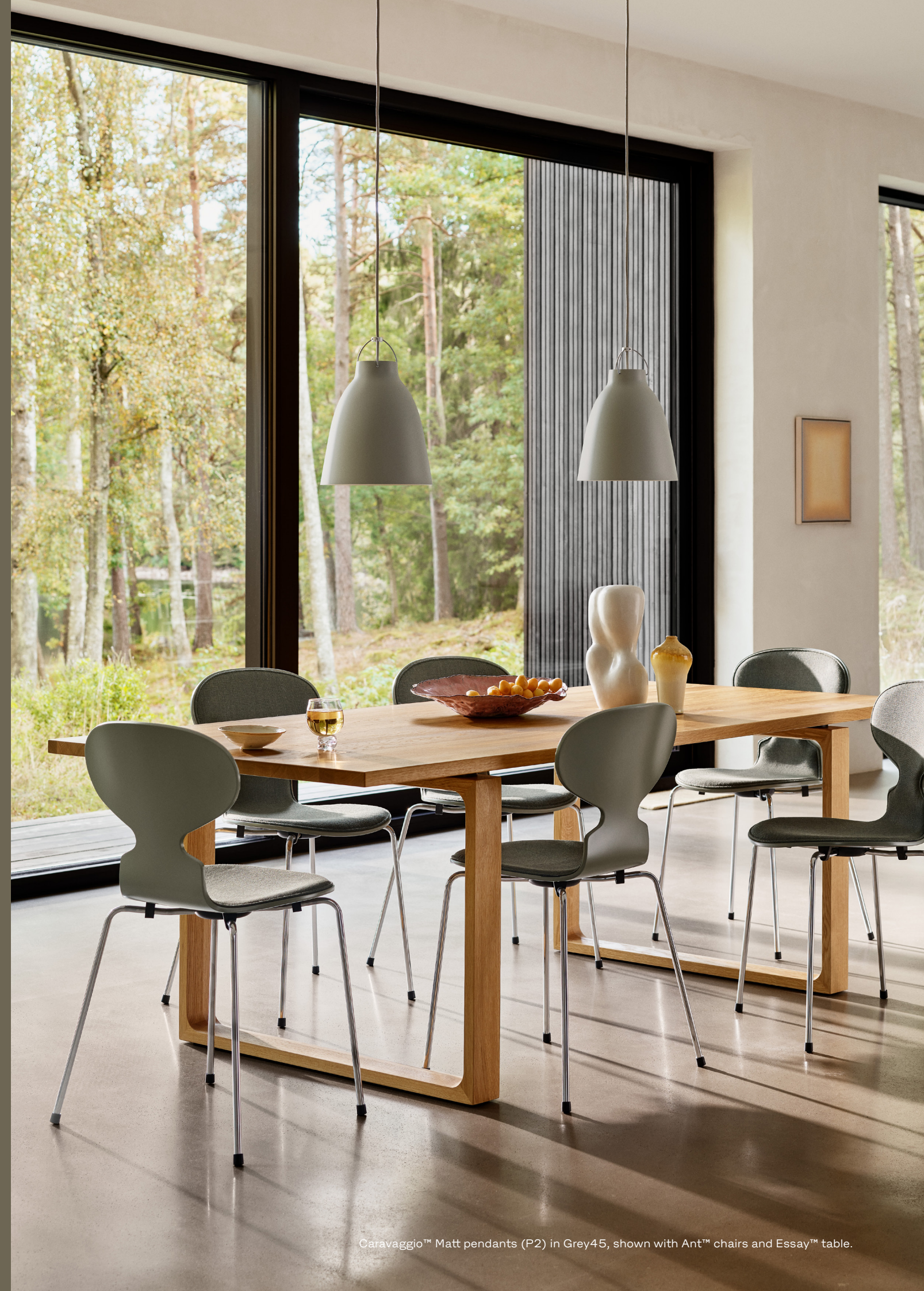
Caravaggio™ Matt pendants (P2) in Grey45, shown with Ant™ chairs and Essay™ table.

The simple, timeless Caravaggio™ pendant by Cecilie Manz consists of a metal shade with soft, feminine lines held by a metal suspension. The textile cable is particularly well integrated into the design and gives the lamp its finishing touch. The lamp casts a concentrated, downward light whilst also illuminating both the suspension and the cable through a hole at the top of the lamp. The shade is designed to prevent glare and provide beautiful, well balanced light.