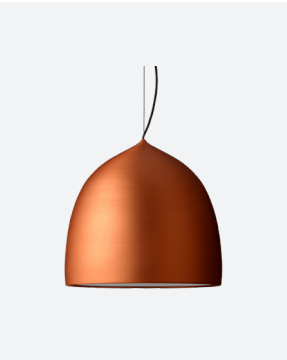
Color: Copper Cord: Black Item: 74709125

Category: Pendant Model: P2 Dimensions: Height: 14.2 in Diameter: 15.1 in Cord specifications: Length: 236 in Material: PVC (w. wire for Copper) Materials: Shade: Aluminum, Polished copper Diffuser: Polycarbonate (PC) Weight: 3,7 lb (Copper: 6,8 lb) Socket: E26 max 100W