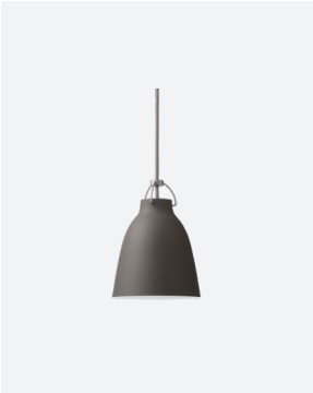
Color: Archipelago Stone (Matt) Cord: Grey45 Item: 74714912