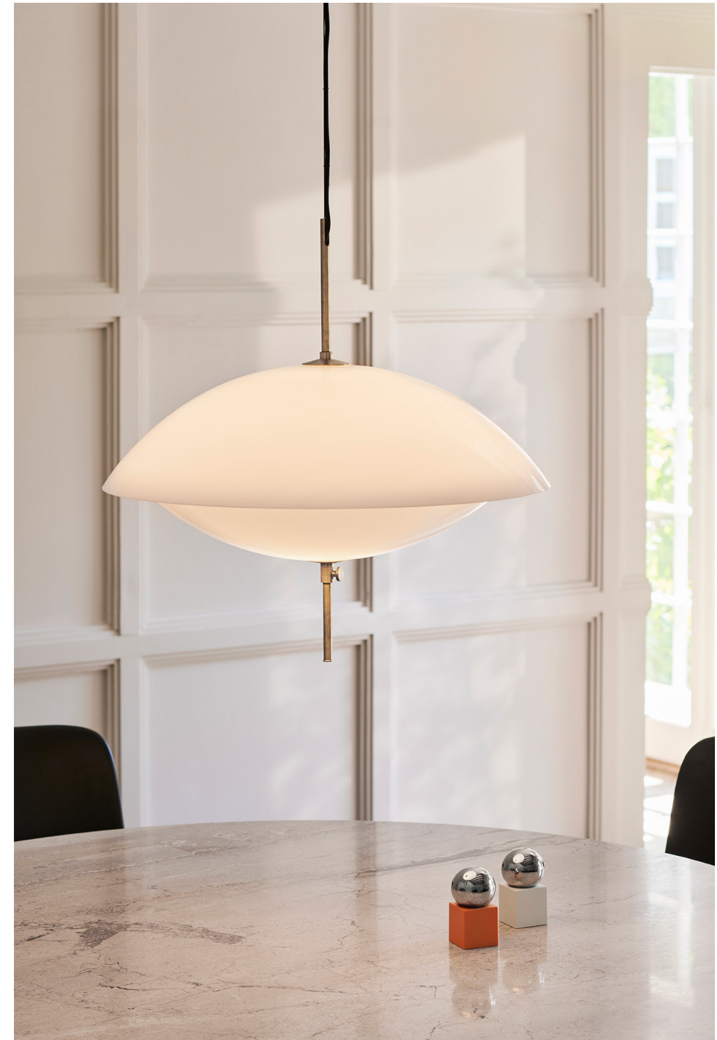
Clam™ pendant (Ø550).

For more information, visit fritzhanzen.com .