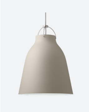
Color: Warm Silk (Matt) Cord: Grey45 Item: 74715812

Category: Pendant Model: P3 Dimensions: Height: 20.3 in Diameter: 15.7 in Cord specifications: Length: 236 in Color: Varies w. shade Color Material: Textile w. wire Materials: Shade: Aluminum Suspension: Steel Diffuser: Polycarbonate (PC)* Weight: 5,1 lb Socket: E26 max 200W