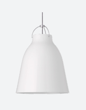
Color: White (High-gloss) Cord: Grey Item: 74270705

Isolation class: Class II IP rating: IP20 (Dry location) Certification: cULus Canopy: White