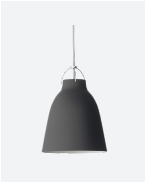
Color: Black (Matt) Cord: Grey45 Item: 14290108