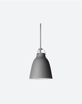
Color: Grey45 (Matt) Cord: Grey45 Item: 14288112

Category: Pendant Model: P1 Dimensions: Height: 8.5 in Diameter: 6.4 in Cord specifications: Length: High-gloss: 118 in / Matt: 236 in Color: Varies w. shade Color Material: Textile Materials: Shade: Steel Suspension: Steel Weight: 1,8 lb Socket: E12 max 60W