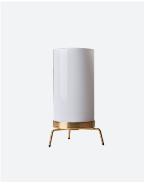
Color: Opal/Brass Item: 82719618

Category: Table lamp Dimensions: Height: 12.3 in Diameter: 5.3 in Cord specifications: Length: 98 in Color: Black Material: Textile Materials: Shade: Opal glass Base: Black lacquered steel/ Brass (untreated) Weight: 4 lb Socket: E26 max 60W