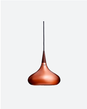
Color: Copper/Rosewood Cord: Black Item: 44289564

Category: Pendant Model: P1 Dimensions: Height: 9.6 in Diameter: 8.8 in Cord specifications: Length: 118 in Material: Textile Materials: Aluminum/Oak Black lacquered aluminum/Rosewood Copper/Rosewood Weight: 1.5 lb (Copper: 2.6 lb) Socket: E26 max 60W