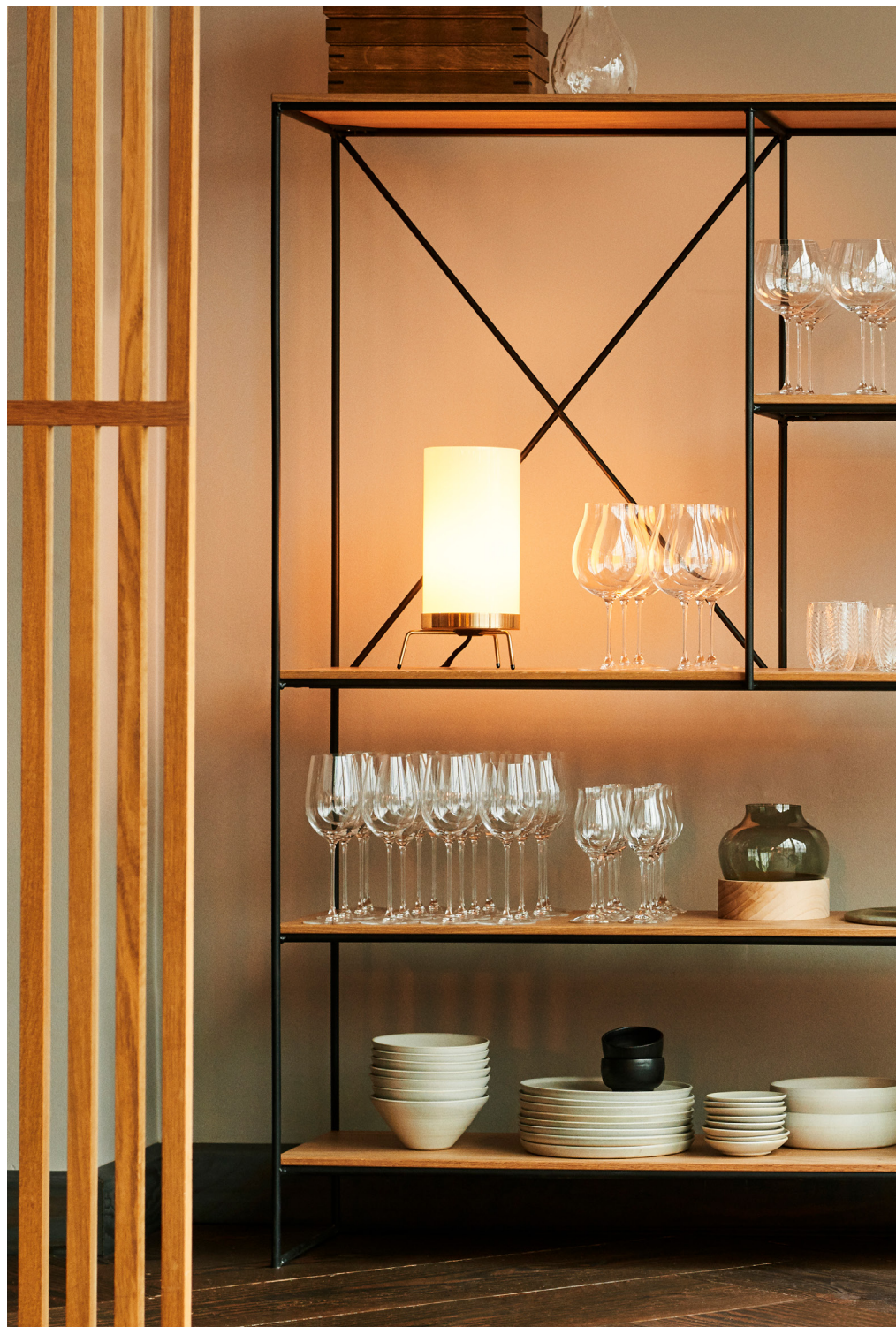
PM-02 table lamp in Brass shown in a Planner™ Shelving.