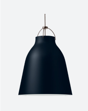
Color: Dark Ultramarine Cord: Grey45 Item: 74715603