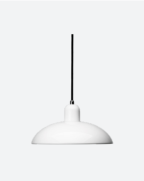
Color: White Item: 64700905

Isolation class: Class II IP rating: IP20 (Dry location) Certification: cULus Canopy: Chrome