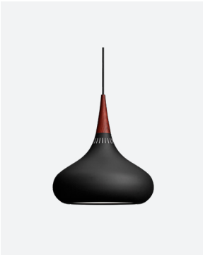
Color: Black/Rosewood Cord: Black Item: 74708208