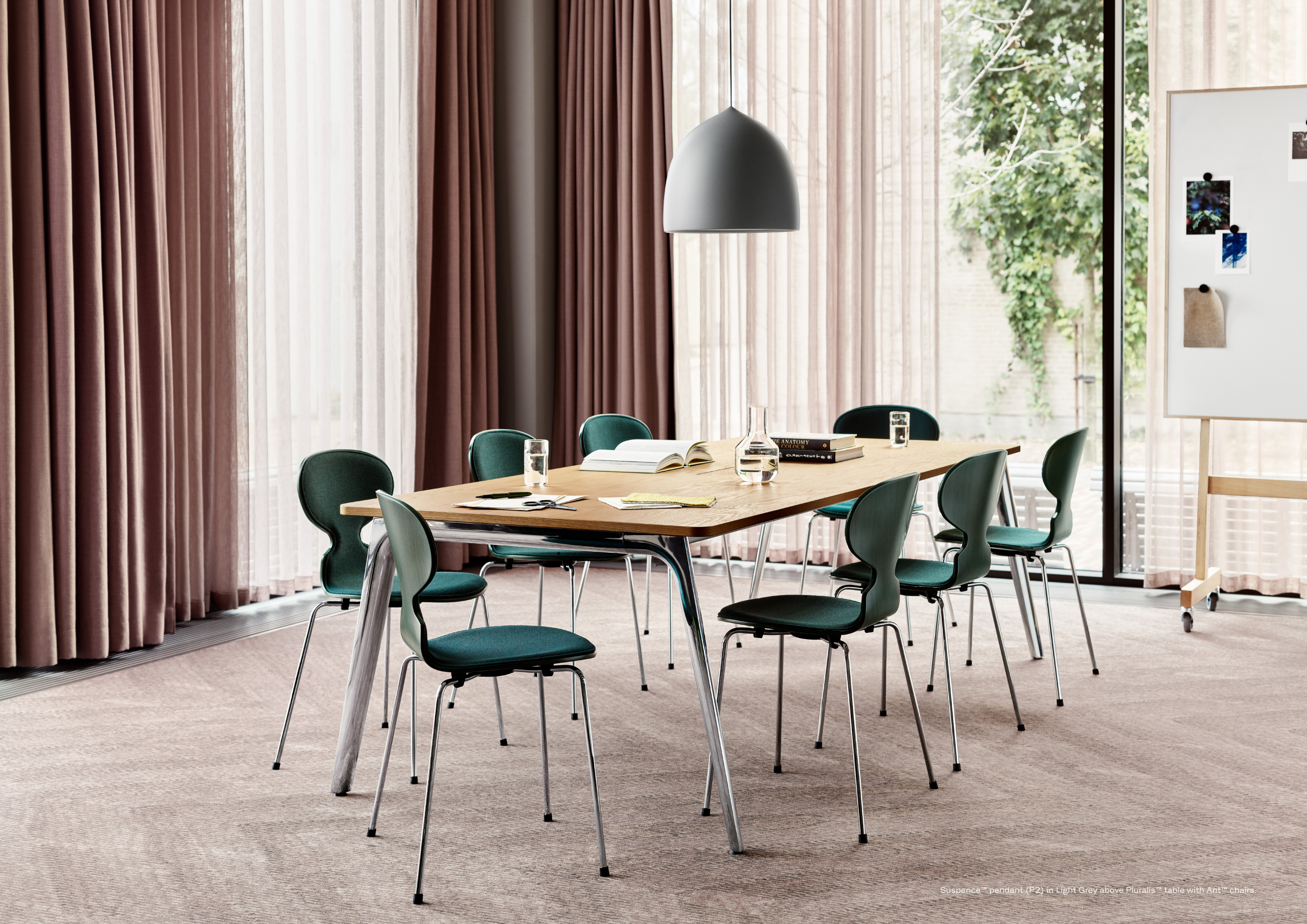
Suspence™ pendant (P2) in Light Grey above Pluralis™ table with Ant™ chairs.