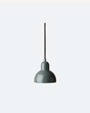
Color: Smooth Slate Item: 94721512

Isolation class: Class II IP rating: IP20 (Dry location) Certification: cULus Canopy: Chrome