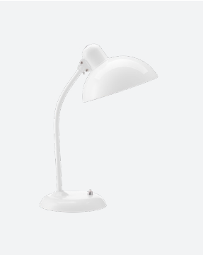
Color: White Item: 62703205

Isolation class: Class II IP rating: IP20 (Dry location) Certification: cULus Canopy: Chrome