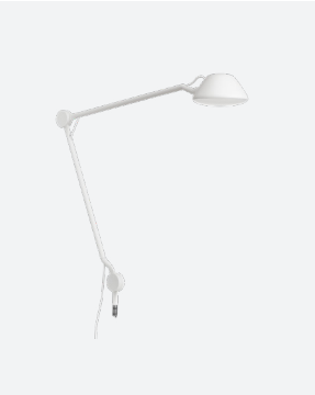
Color: White Cord: White Item: 62716005

Category: Table lamp Dimensions: Height: 7.3 in Width: 17.7 in Cord specifications: Length: 98 in Material: PVC Materials: Shade/Base: Aluminum Diffuser: Polycarbonate (PC) Weight: 1,1 lb Light source: LED (Built-in) Features: Tilttable, Swivel, Dimmable