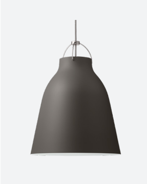
Color: Archipelago Stone (Matt) Cord: Grey45 Item: 74715712