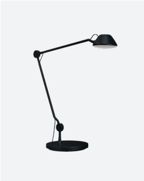
Color: Black Cord: Black Item: 62699008