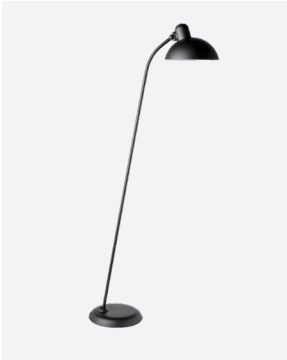
Color: Matt Black Item: 61704008

Category: Floor lamp Model: 6556-F Luxus Dimensions: Height: 49.2 in Diameter (shade): 8.5 in Diameter (base): 8.9 in Cord specifications: Length: 78 in Color: Black Material: Textile Materials: Steel/Chrome Weight: 11,4 lb Socket: E26 max 25W Features: Tilttable