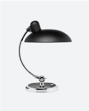
Color: Matt Black Item: 62702008