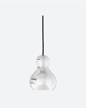
Color: Silver Item: 14283172

Isolation class: Class II IP rating: IP20 (Dry location) Certification: cULus Canopy: Black