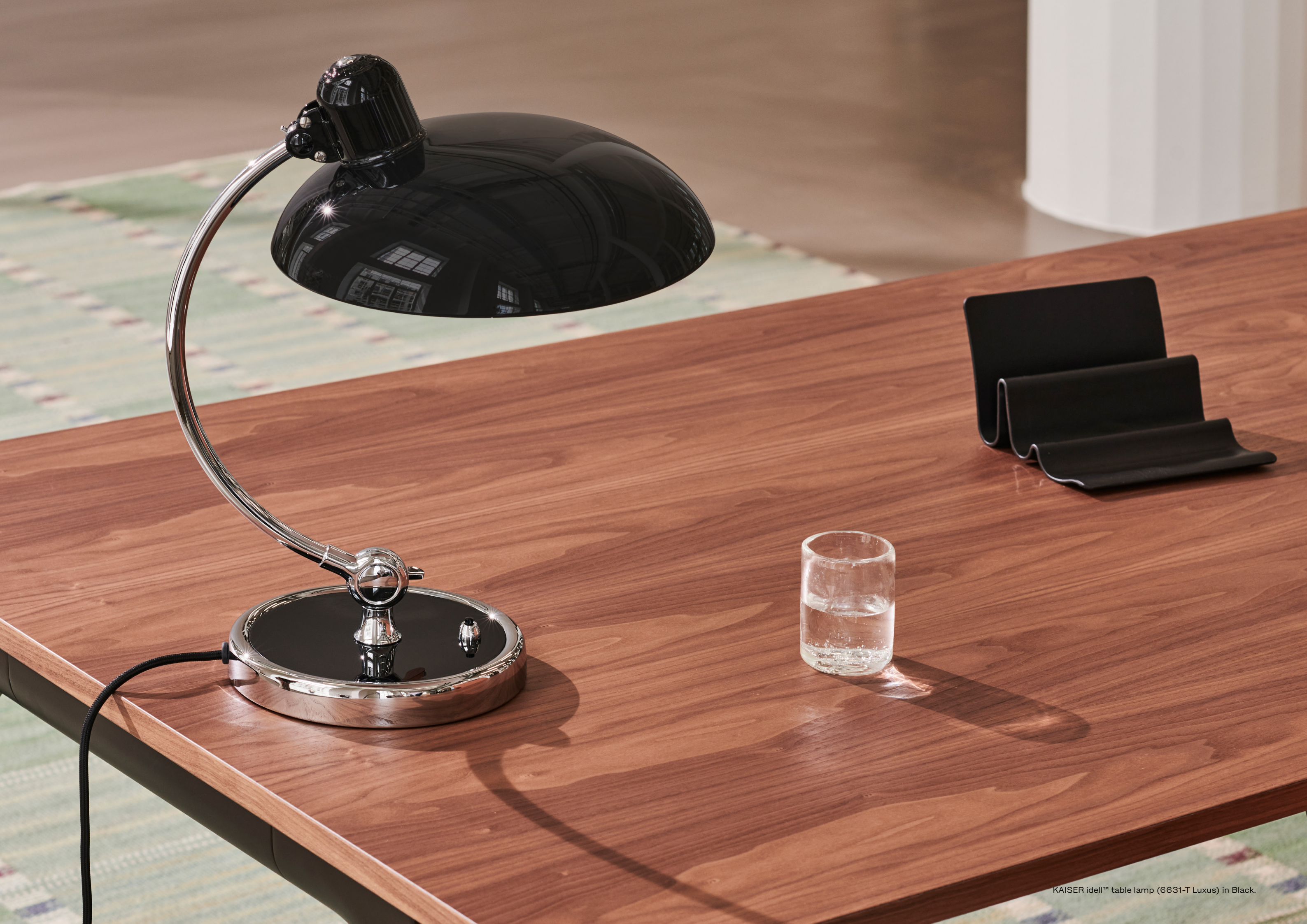
KAISER idell™ table lamp (6631-T Luxus) in Black.