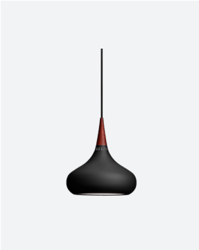
Color: Black/Rosewood Cord: Black Item: 74708108