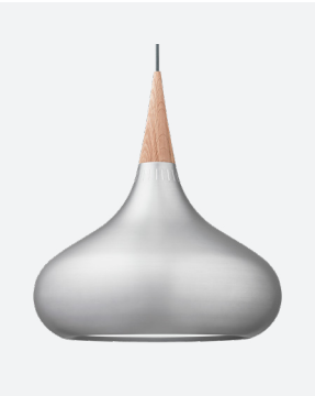
Color: Aluminium/Oak Cord: Grey Item: 84719172

Category: Pendant Model: P2 Dimensions: Height: 14.5 in Diameter: 13.3 in Cord specifications: Length: 118 in Material: Textile Materials: Aluminum/Oak Black lacquered aluminum/Rosewood Copper/Rosewood Weight: 2.4 lb (Copper: 4.9 lb) Socket: E26 max 75W