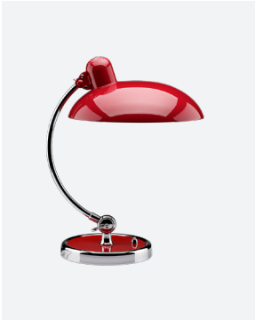
Color: Ruby Red Item: 62702101