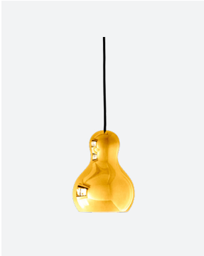
Color: Gold Item: 14283274

Category: Pendant Model: P1 Dimensions: Height: 8.3 in Diameter: 6.2 in Cord specifications: Length: 236 in Color: Black Material: Textile Materials: Aluminum Weight: 1,3 lb Socket: E26 max 40W