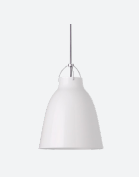
Color: White (High-gloss) Cord: Grey Item: 54270305

Isolation class: Class II IP rating: IP20 (Dry location) Certification: cULus Canopy: White