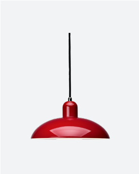
Color: Ruby Red Item: 64701201