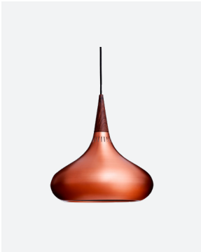
Color: Copper/Rosewood Cord: Black Item: 44289664

Category: Pendant Model: P2 Dimensions: Height: 14.5 in Diameter: 13.3 in Cord specifications: Length: 118 in Material: Textile Materials: Aluminum/Oak Black lacquered aluminum/Rosewood Copper/Rosewood Weight: 2.4 lb (Copper: 4.9 lb) Socket: E26 max 75W