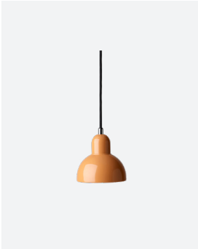
Color: Soft Ochre Item: 94721402