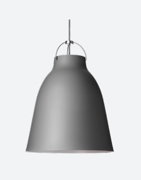
Color: Grey45 (Matt) Cord: Grey45 Item: 14288312

Category: Pendant Model: P3 Dimensions: Height: 20.3 in Diameter: 15.7 in Cord specifications: Length: 236 in Color: Varies w. shade Color Material: Textile w. wire Materials: Shade: Aluminum Suspension: Steel Diffuser: Polycarbonate (PC)* Weight: 5,1 lb Socket: E26 max 200W