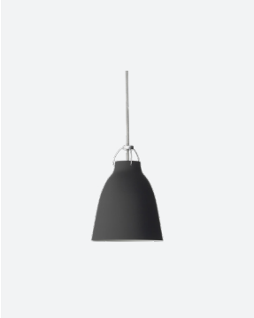
Color: Black (Matt) Cord: Grey45 Item: 14290008