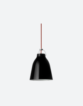
Color: Black (High-gloss) Cord: Red Item: 54270008