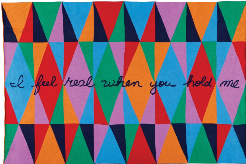
JEFFREY GIBSON, "I FEEL REAL WHEN YOU HOLD ME," 2024.