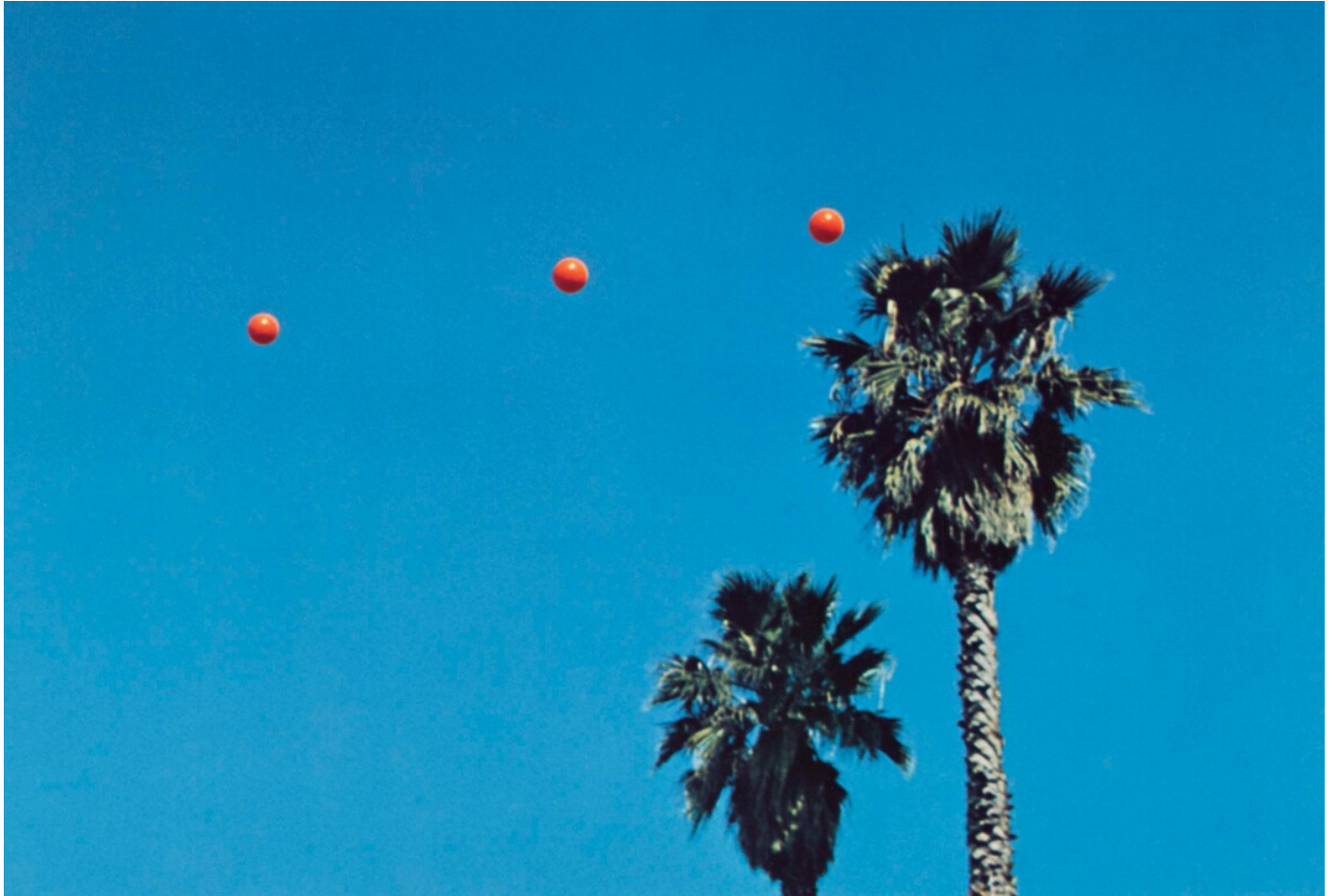
JOHN BALDESSARI, "THROWING THREE BALLS IN THE AIR TO GET A STRAIGHT LINE (BEST OF THIRTY-SIX ATTEMPTS)," (DETAIL), 1973.

I gave my daughter a set of lithographs of John Baldessari's series "Throwing Three Balls in the Air to Get a Straight Line." Baldessari did things that were at once so wonderfully silly and poignant. The images, captured on Kodak film, show just what the name suggests.