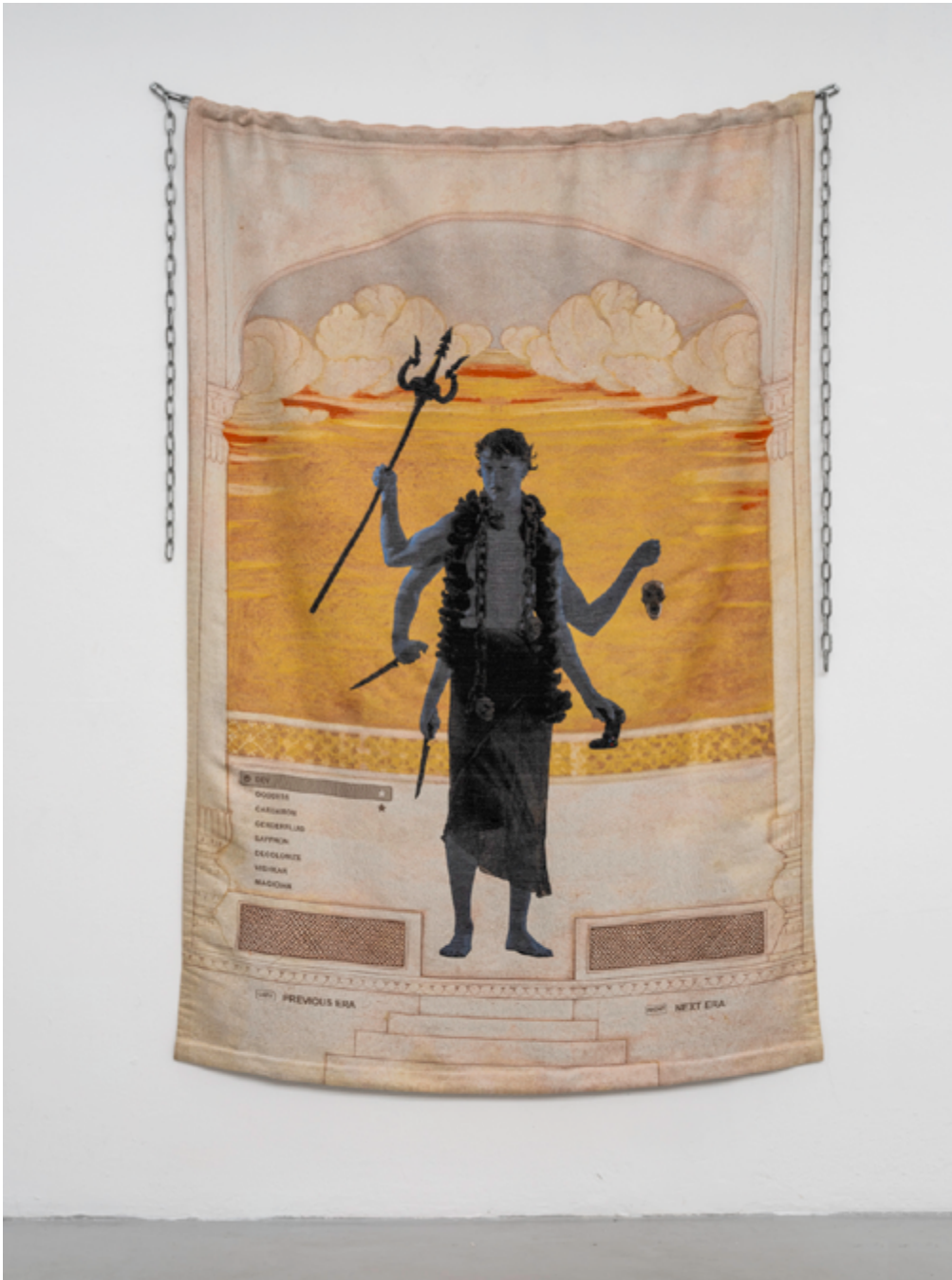
Tales They Don't Tell You / The Past 2024 150 x 220 cm Jacquard weave, wool, nylon, metal chain 9 300 EUR