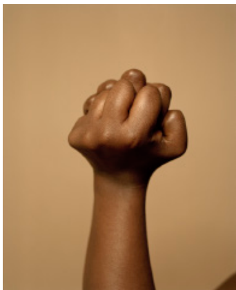
Grippel #1 2021 125 x 155 cm Analog C-print Edition of 3 + 2 AP