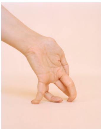
Virux #2 2018 100 x 120 cm Inkjet print Artist's proof