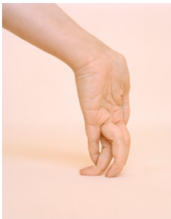
Virux #1 2018 100 x 120 cm Inkjet print Artist's proof