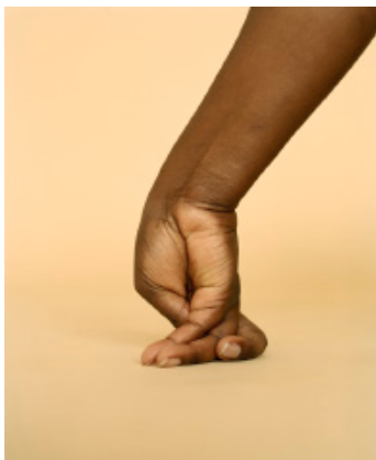
Handl #5 2020 125 x 155 cm Analog C-print Edition of 3 + 2 AP