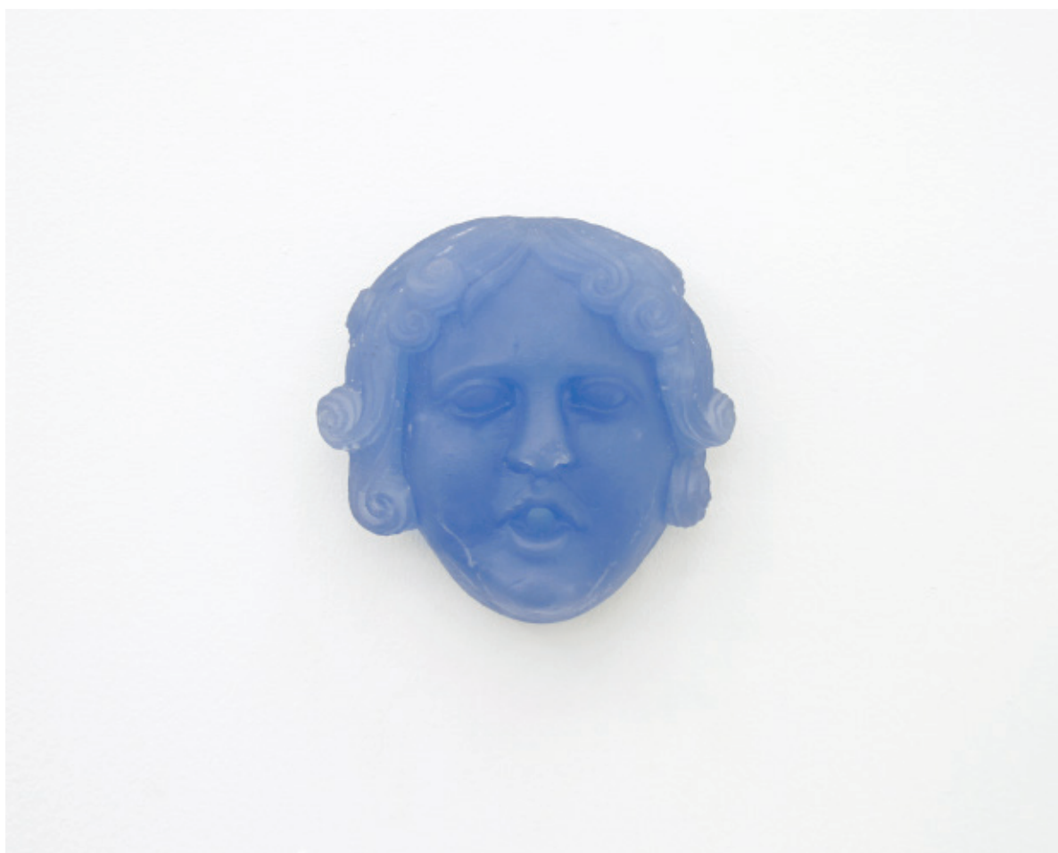
O (Blue), 2019 23 × 23 × 10 cm Epoxy resin, pigment Unique 16.000 NOK