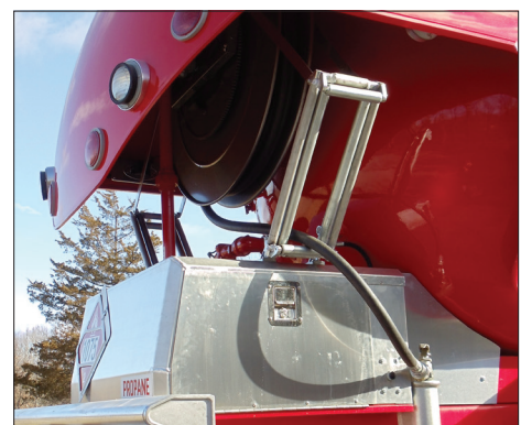
Inverted hose reel with rear canopy protection and four way roller system