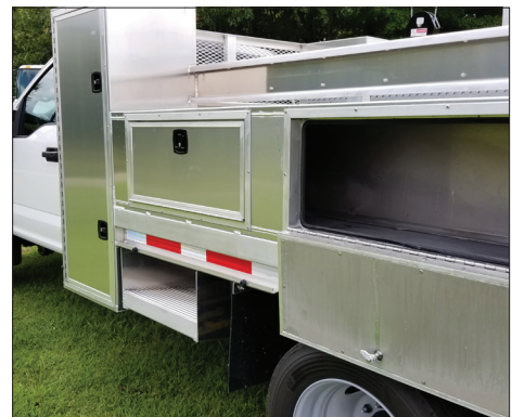
Several cabinet options available