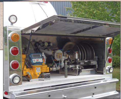
Rear combo box protecting equipment