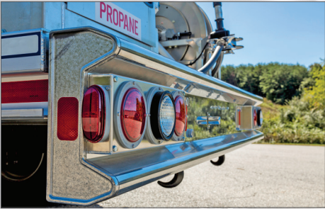
Guardrail Style Rear Bumper