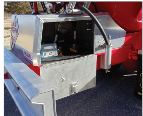
In frame meter box that houses meter and controls