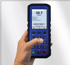
Base System/Remote Shut Down