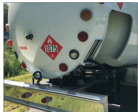
Full rear head canopy with LED lighting