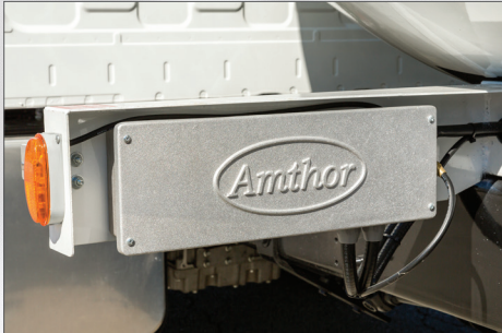
Casted Aluminum Water Tight Electrical Box