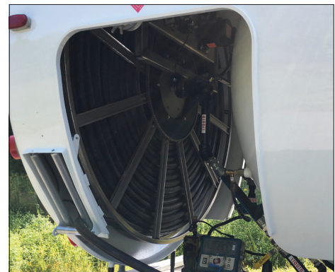
Rear single wrap or multi wrap hose options