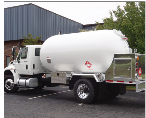
Single axle Amthor propane combo delivery truck