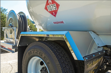
Aluminum Formed Rear Fenders