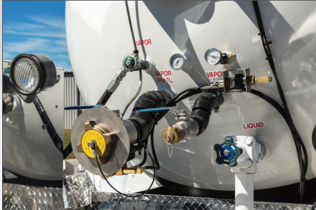
Rear Gauges and Fills