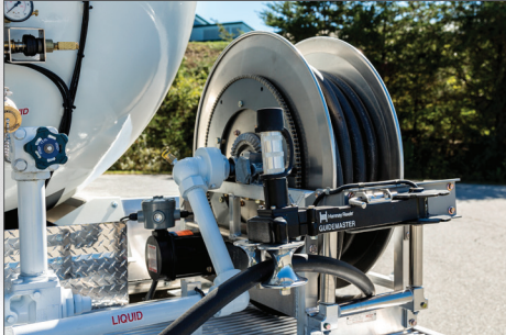
Polished Aluminum Hose Reel