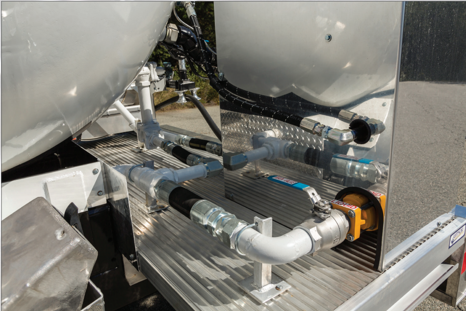
Aluminum Extruded Rear Deck