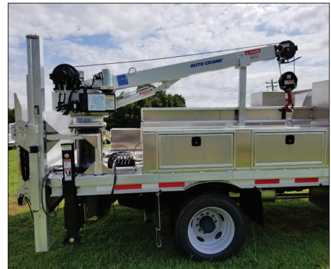
Several different makes and models of cranes with various lifting capacities