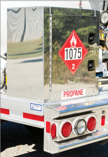
Polished Aluminum Meter Box