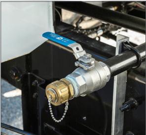
Side Suction Line