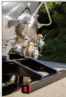
Square tubing rear bumper and a rear "A" frame hose holder