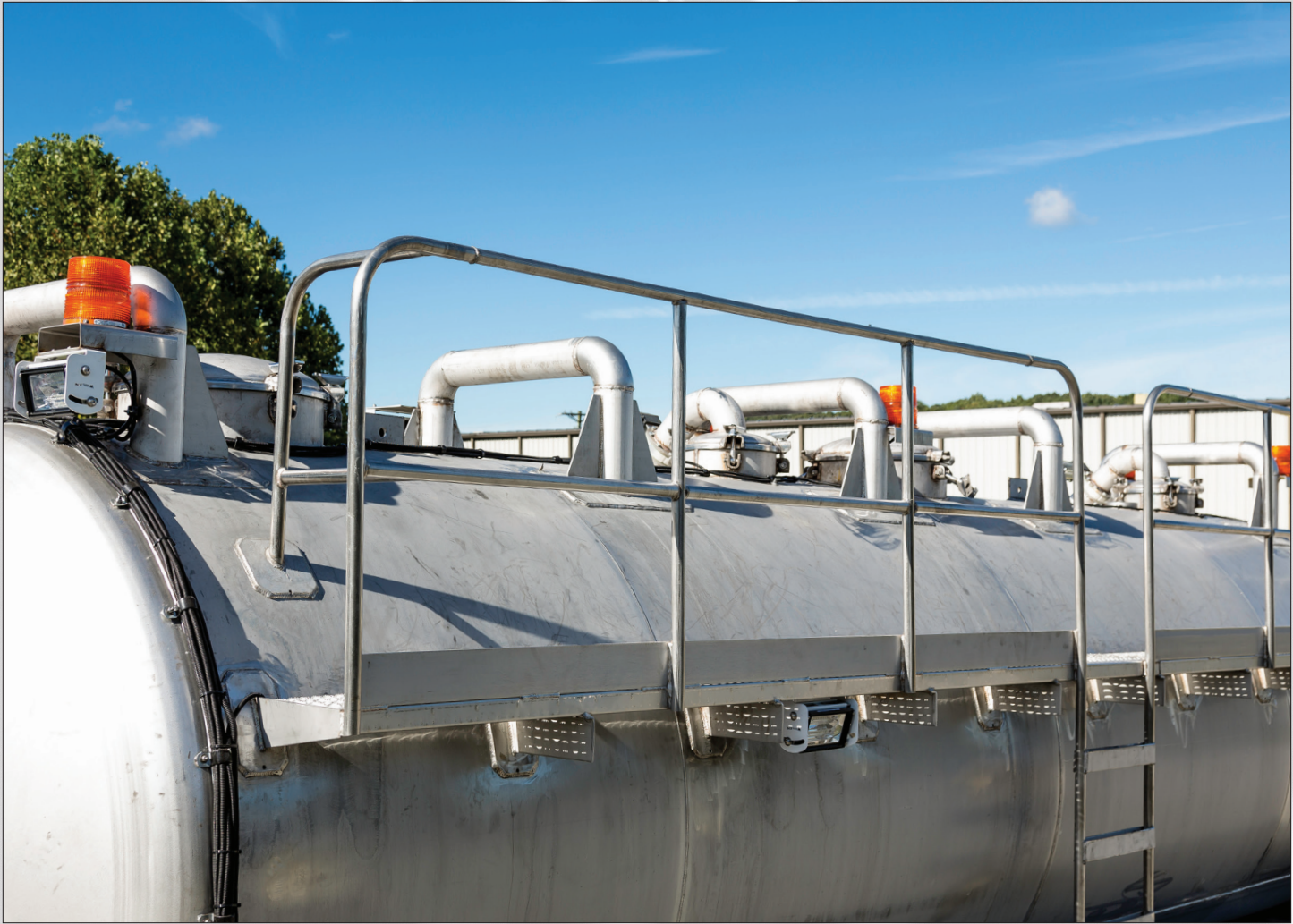
Side grip strut catwalk option with railing