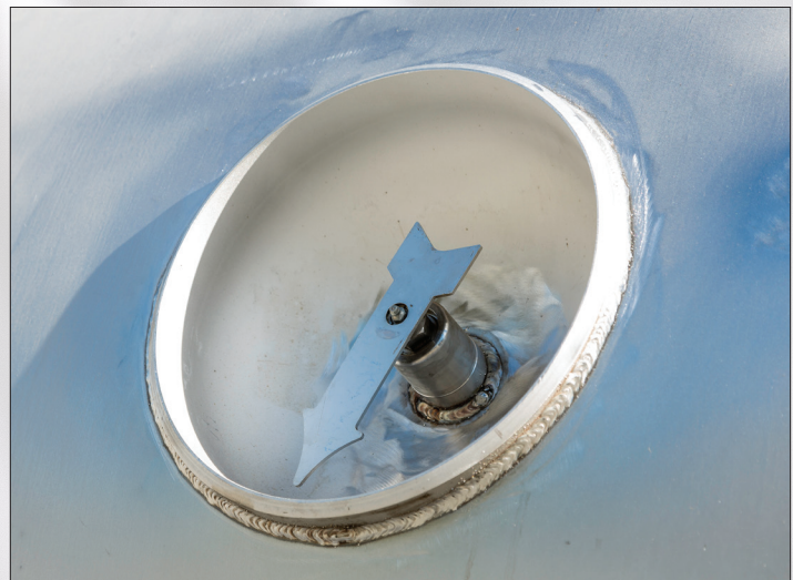
Recessed float level indicator