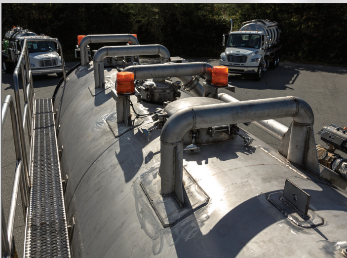
Top overturn protection to protect the tank in case of a rollover