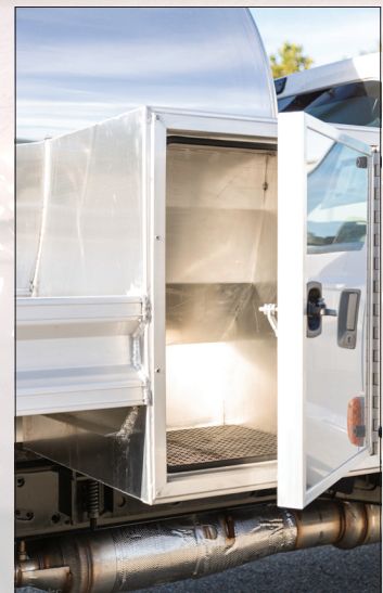
Tank mounted cabinets with a double-paneled aluminum extruded door and compression latch