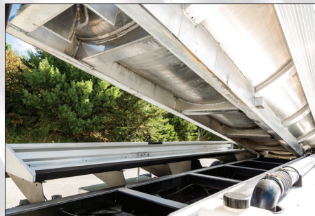
Dumping tank subframe