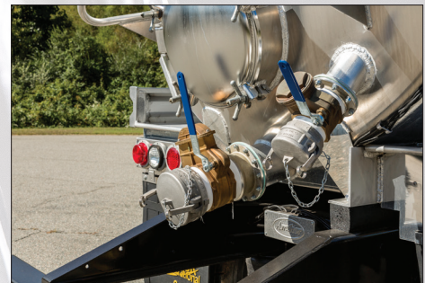
Several inlet and discharge options. A standard rear tank inlet comes with a riser pipe and stainless steel deflector plate