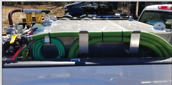
Curbside or driver side tank mounted water hose and suction hose with hose hooks