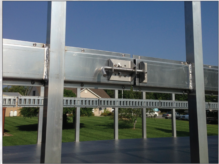
Removable side rack with E-track