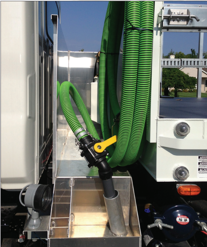
Driver side dropdown workstation