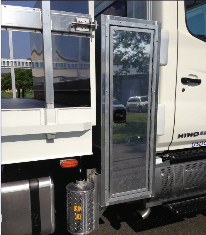
Vertical cabinet with a double paneled aluminum extruded door and compression latch