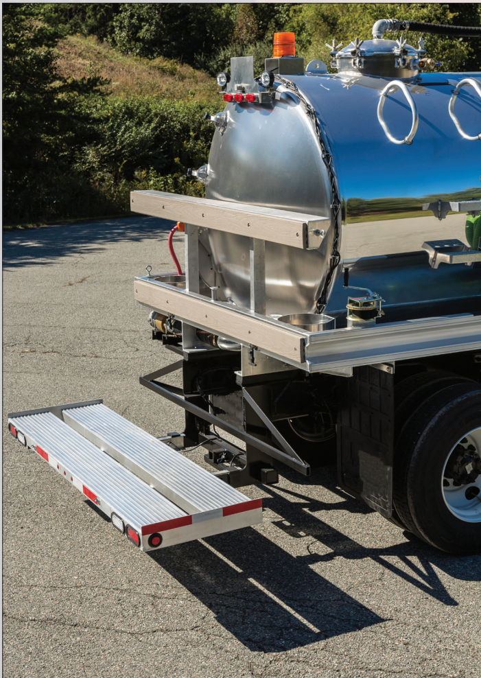
Aluminum extruded rear portable restroom holder with a receiver hitch and a rear "T" bar with Trex for portable restroom support