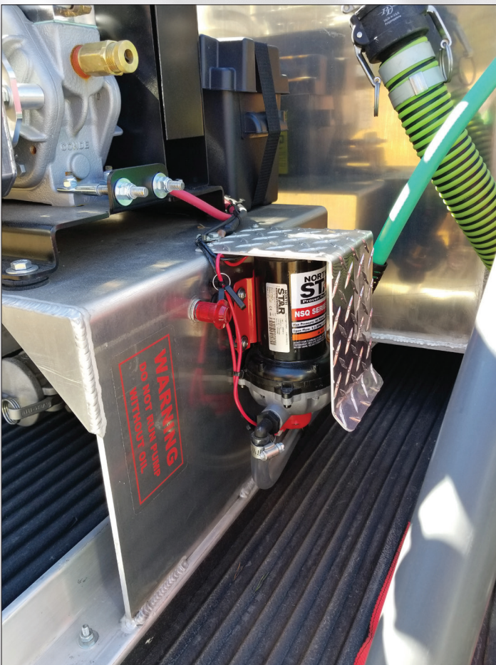
Curbside mounted 12V water pump to rear pump platform with switch