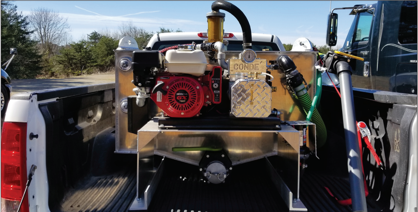
Raised rear pump platform with waste compartment discharge underneath