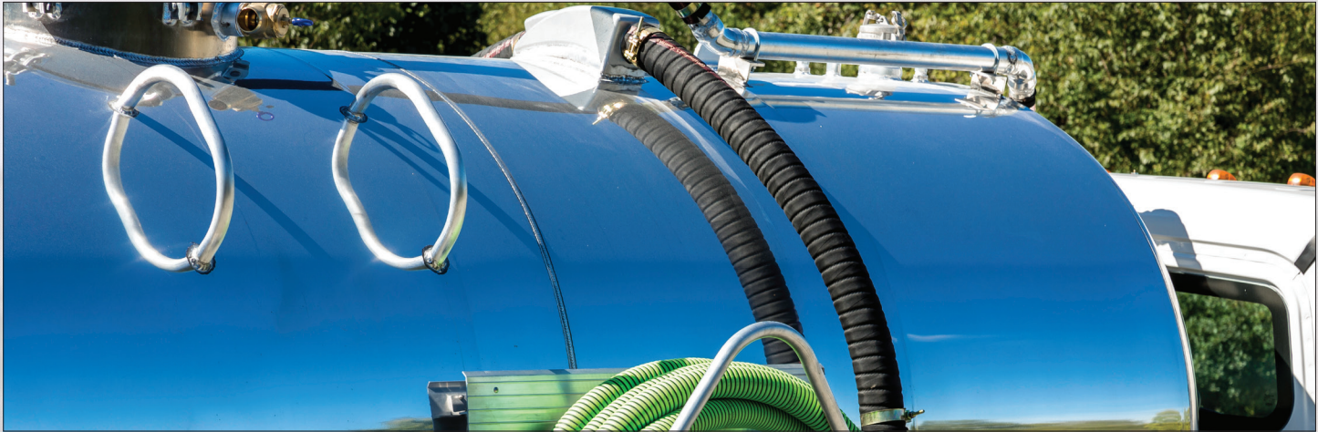
Top plenum style waste inlet