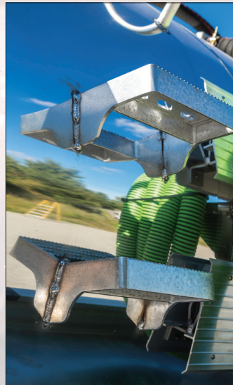
Grip strut ladder steps with hand holds