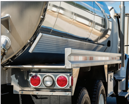
Side hose troughs with hose protectors and an outside rub rail. Front and rear fenderettes for tank lighting and mud flap mounting