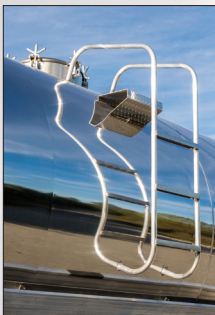
Tank ladder with heavy duty grip strut steps