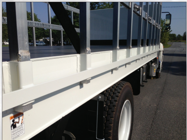
Outside rubrail with stake pockets for side racks