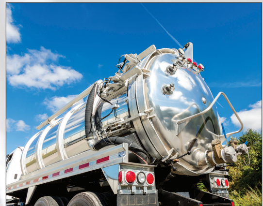
"Claw" hydraulic rear door opening system