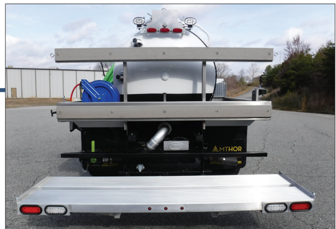
Rear aluminum extruded potty holder with LED lights and receiver hitch