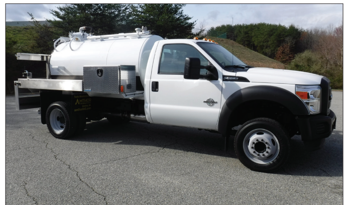
Full wrap around troughs with driver side and curbside trough mounted 36" toolbox