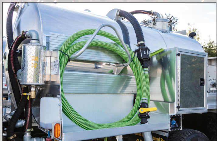
Standard driver's side; optional curbside drop down workstation with a hose holder, wand holder and hose protectors