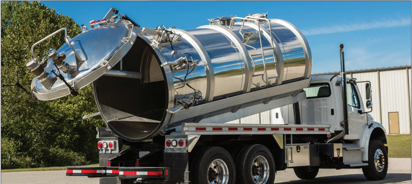
Dumping tank options are available with a full - opening rear door, 20" manway or a 36" manway. Troughs can be stationary or dump with the tank