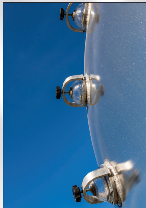
Several different types of liquid level indicators from the standard site glasses to electronic readouts