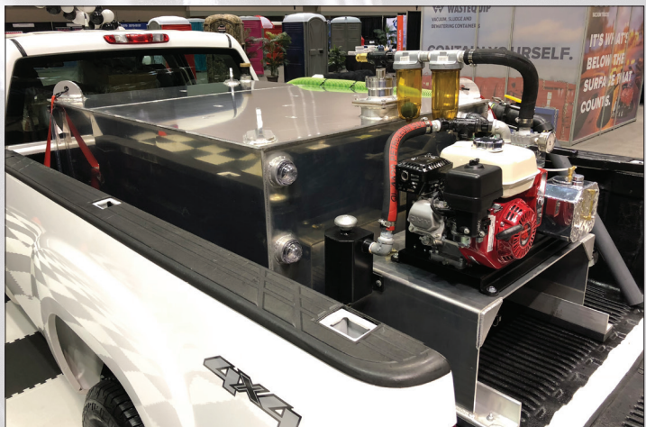
Rear head mounted 2" waste compartment site glasses and top lifting lugs