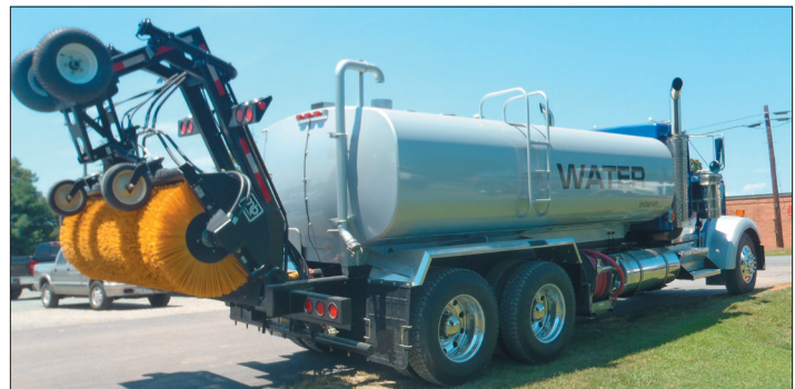
Steel Non-Potable water tanker with a rear sweeper