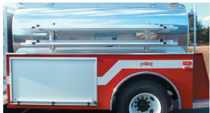
Full side skirting with built in cabinets with roll-up door