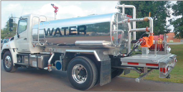
Aluminum non-potable water tank with a top mounted spray cannon, side mounted spray heads, rear spray bar, and rear platform