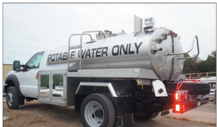
1,200 gallon stainless steel potable water truck with side delivery cabinets