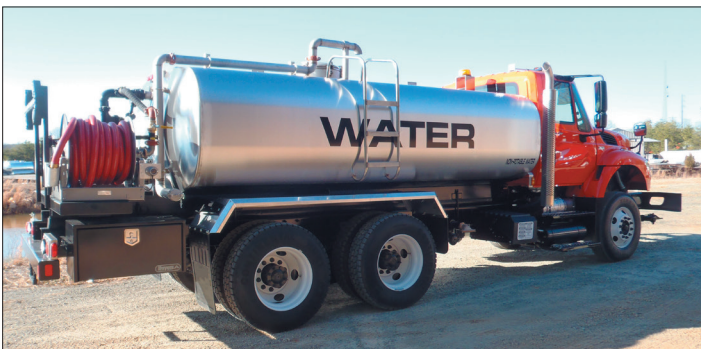
Stainless steel non-potable water tanker with hose reel and pump on a raised platform with rear LED directional traffic advisory bar sign and front and side mounted spray heads