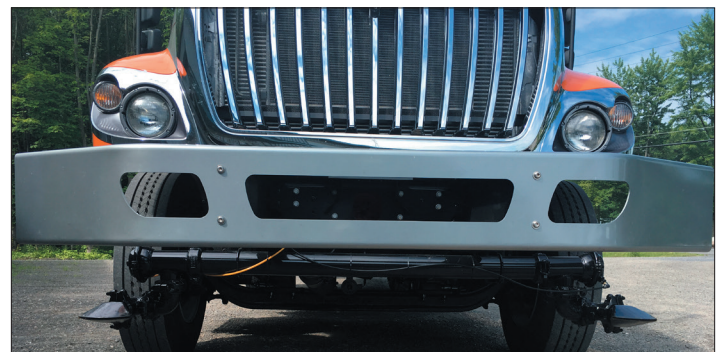
A pair of front mounted dual spray heads underneath the front bumper