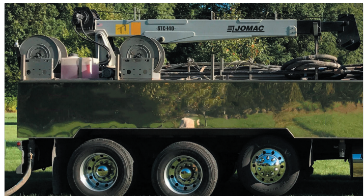
Several different types of crane makes and models available with various lifting capacities