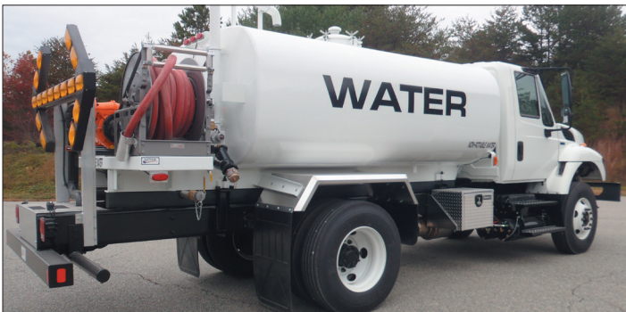
Steel non-potable water tanker with hose reel and pump on a raised platform with rear LED directional traffic advisory bar sign