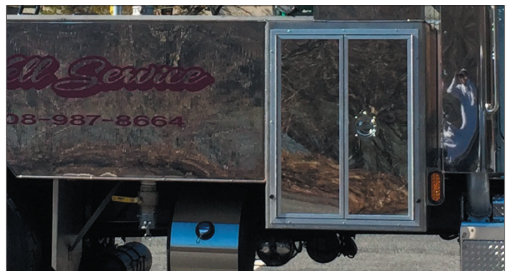
Body mounted vertical or horizontal storage compartments