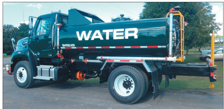
Steel non-potable water tank with raised spray heads and rear platform