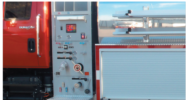
Pump module mounted behind cab with top hose storage