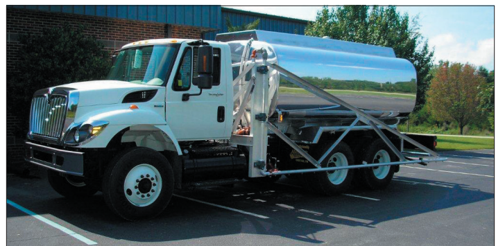
Aluminum Non-Potable water tanker with a driver side swing arm with built in spray heads