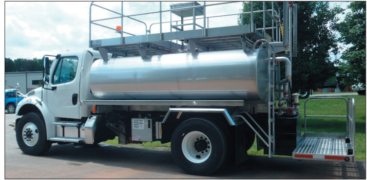
Stainless Steel Non-Potable water tanker with a rear step platform and a top adjustable work area with a vertical and horizontal spray bar to clean out tunnels