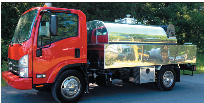
Aluminum Non-Potable water tank with a surrounding enclosure and a rear dispensing area