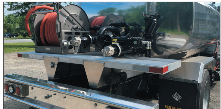
Rear aluminum extruded platform platform to house dispensing equipment and a curbside rear hydrant fill