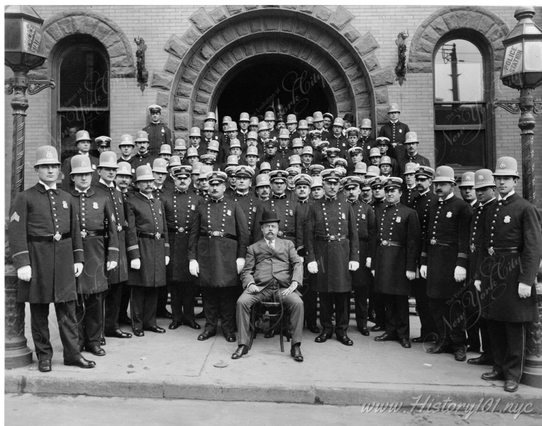
New York City Police Officers 1890-1900's