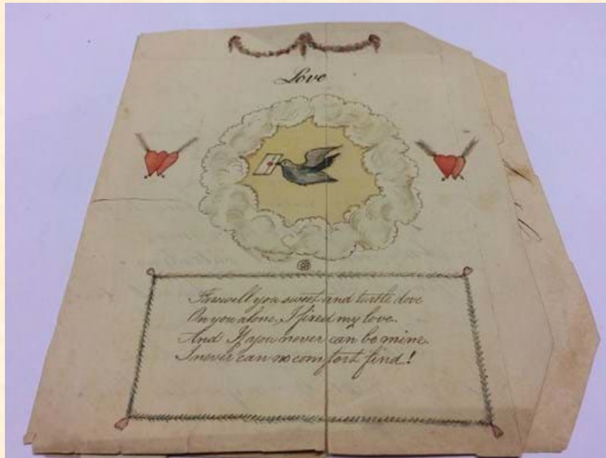
One of the world's oldest surviving Valentine cards. The Valentine card dating to c.1790-1810.

One of the world's oldest surviving Valentine cards has sold today for £5800.