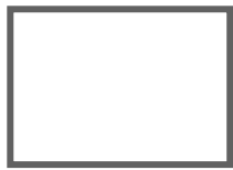
YES Landscape format

* teamXXXX - replace XXXX with your own team ID.