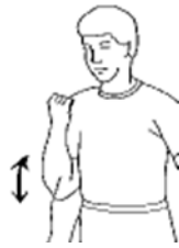
Elbow active range of motion

Actively turn your palm up, then down. Do this 10 times to work on hand and wrist rotation.