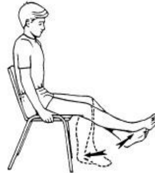
Ice Position 15 minutes 2-3 x per day