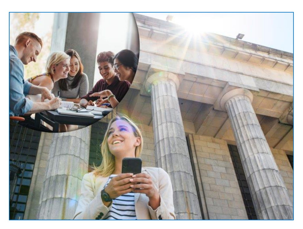
Erasmus+ Training and Cooperation Activity (TCA):

Spreading innovative results from EUA to other higher education institutions: Compilation of session reports