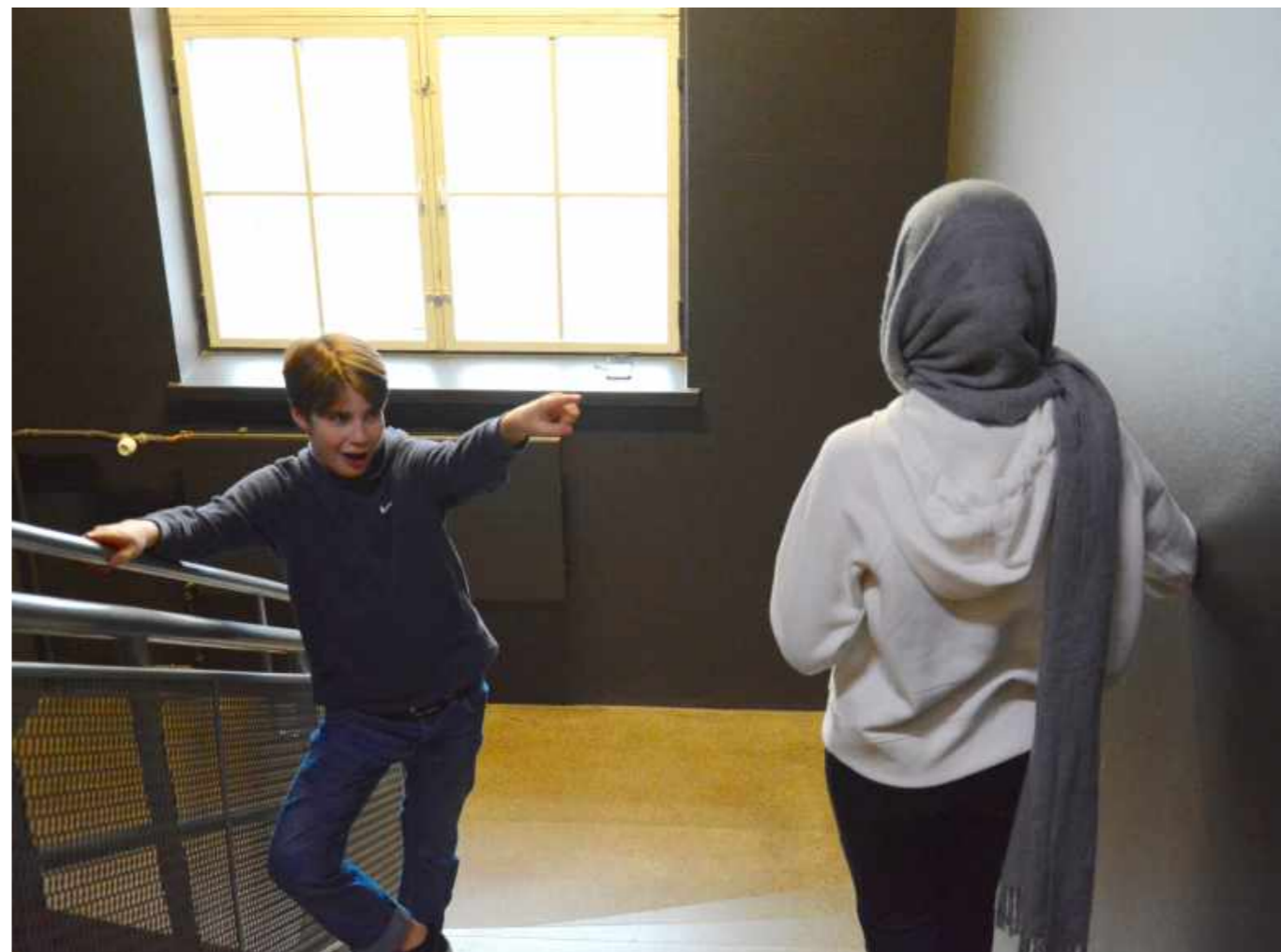
Photo on freedom of religion, Espoo, Finland.