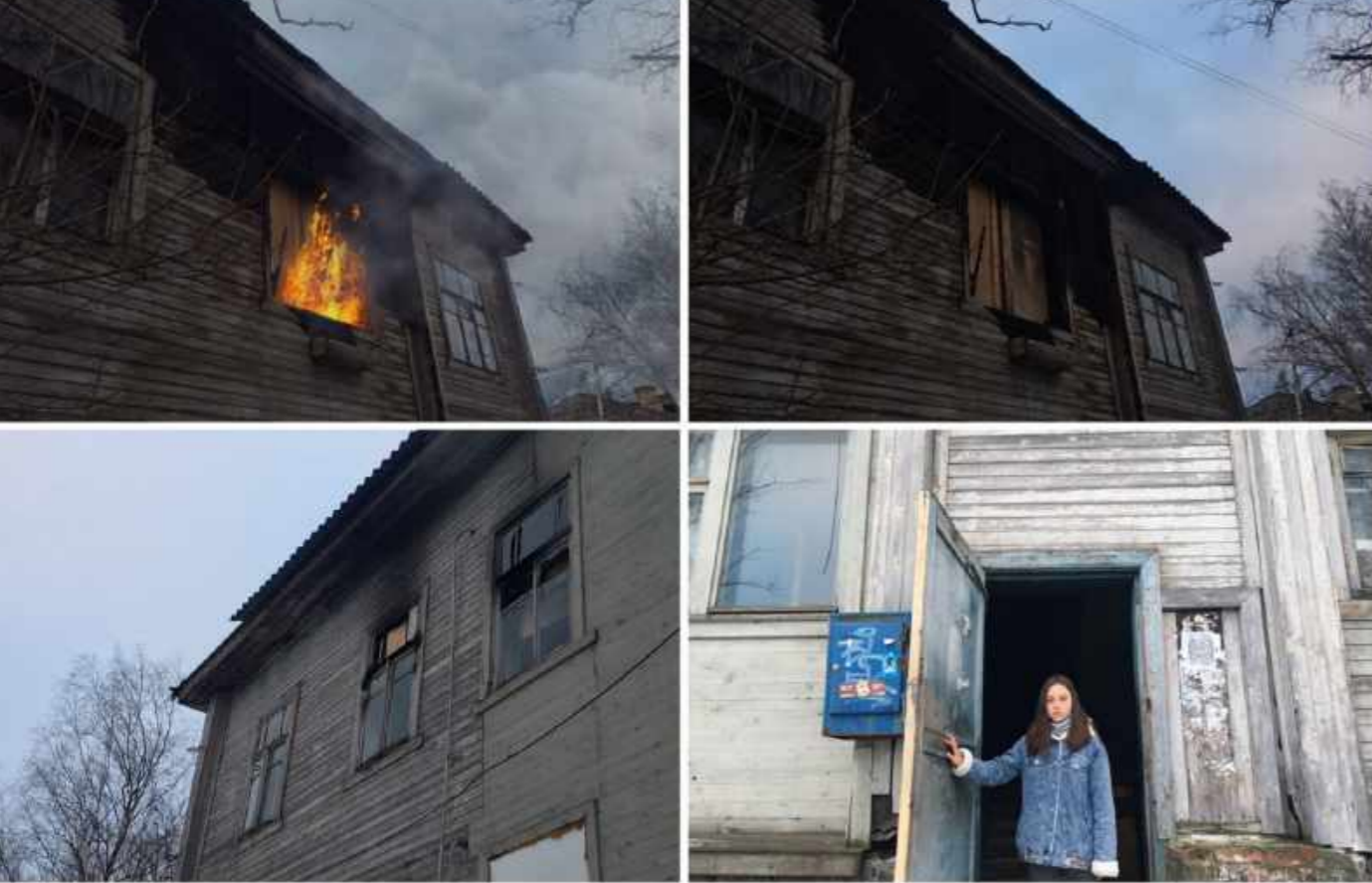
Photo on adequate standard of living, Petrozavodsk, Russia.