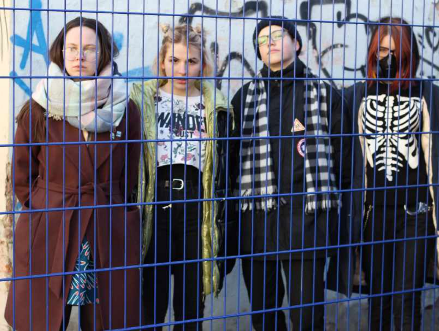
Photo on freedom of speech, St Petersburg, Russia.

"It is a delight to see how eager the kids are to run around and take pictures of the place they live."