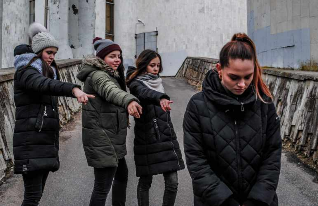
Photo on bullying, Veliky Novgorod, Russia.