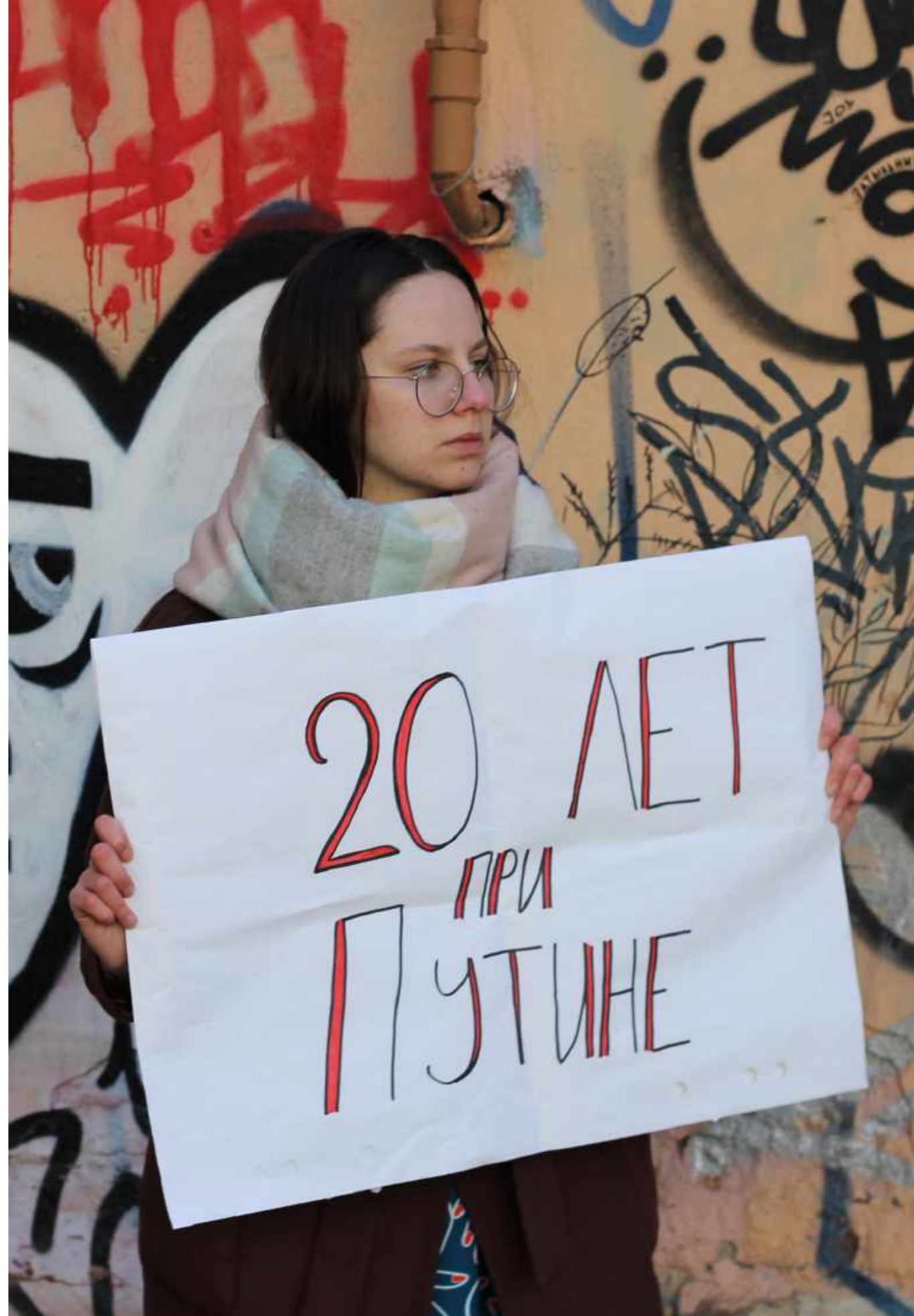
Photo on freedom of speech, St Petersburg, Russia.