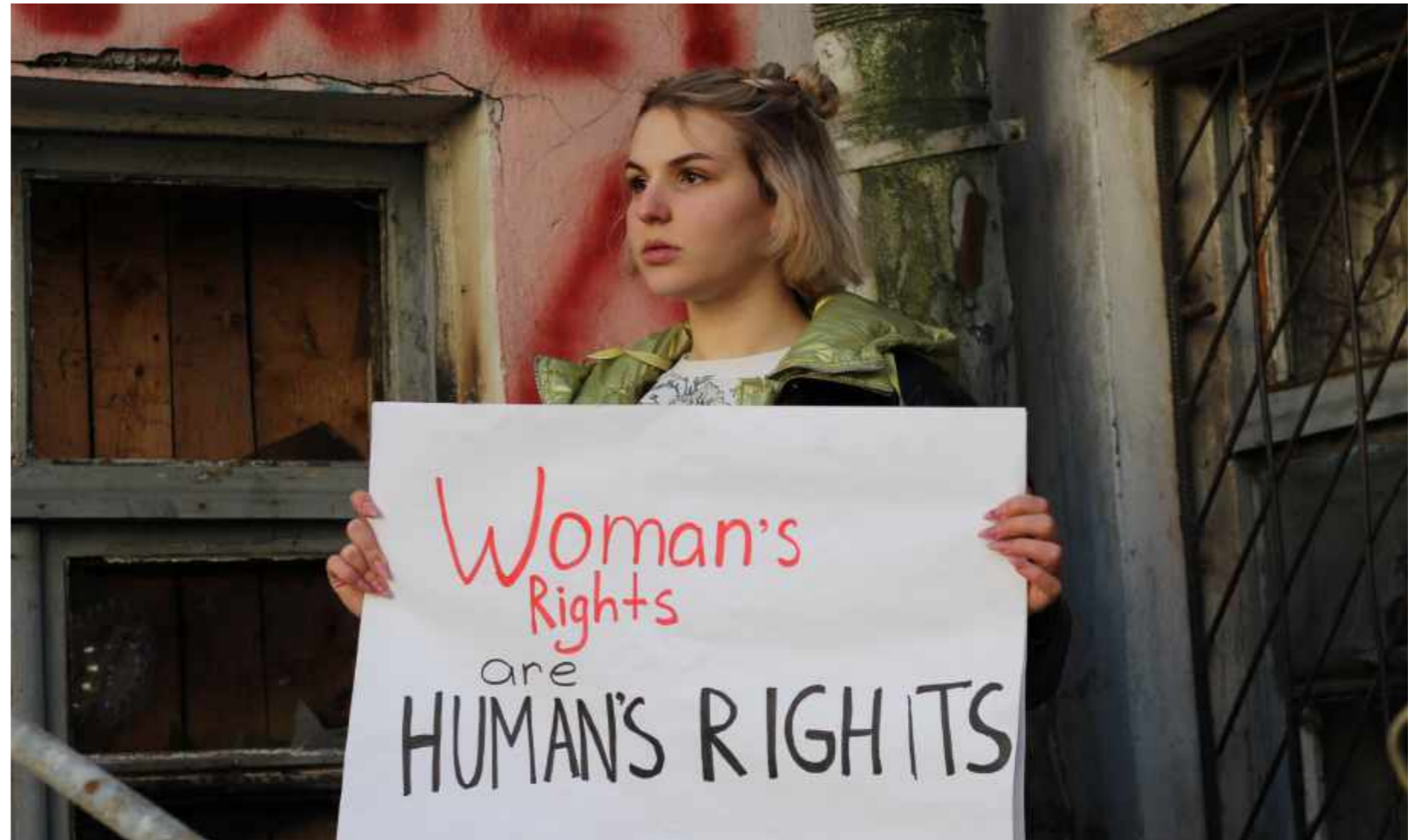
Photo on women's rights, St Petersburg, Russia.

Eight regions of the Northwest Russia (Arkhangelsk, Kaliningrad, Murmansk, Petrozavodsk, Pskov, Veliky Novgorod, St. Petersburg, Leningrad oblastj); Finland (Espoo); Sweden (Stockholm); and Norway (Oslo).