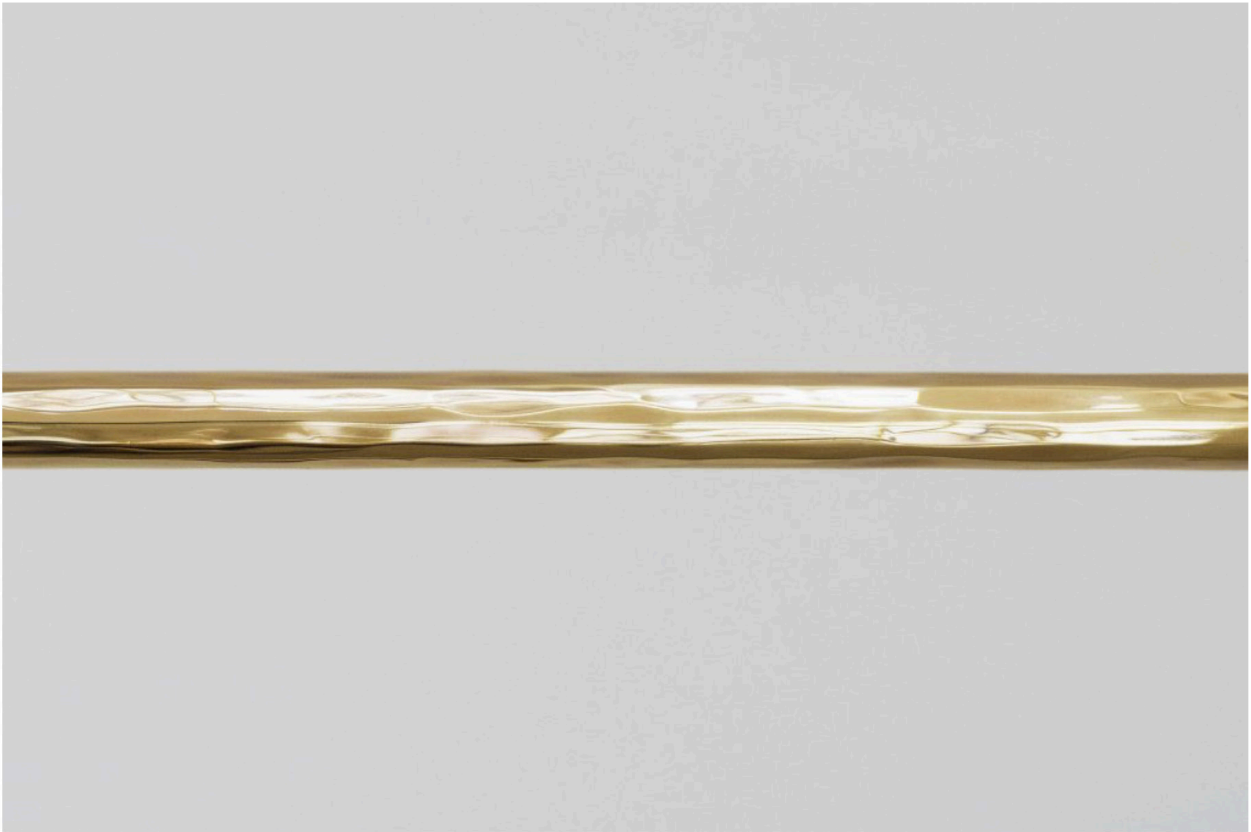
Resonance (detail), 2021.