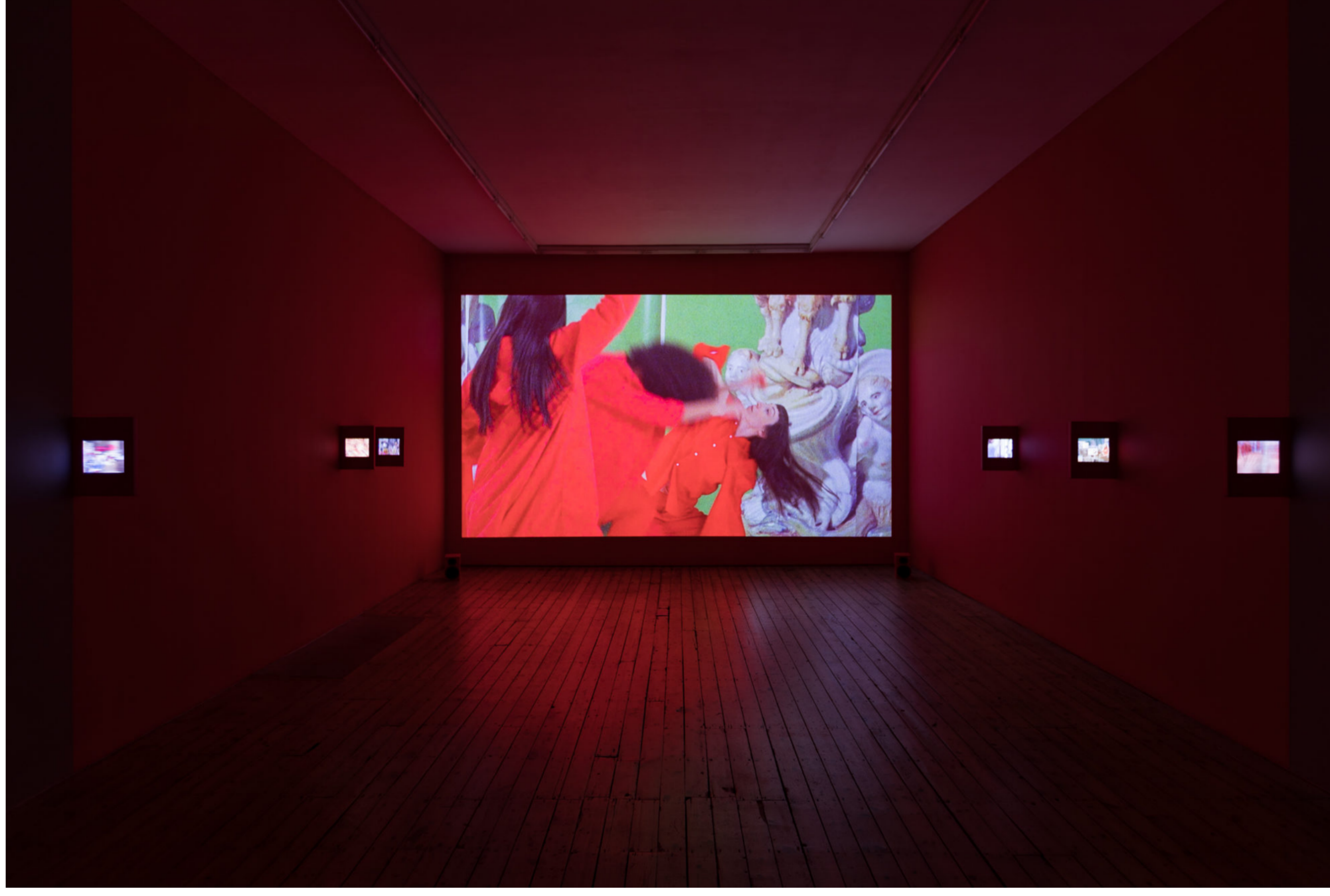
Sara Cwynar, Marilyn, 2020. Installation view.

That collage approach extends to her looped installation videos, in particular, "Scroll 1" and "Scroll 2," in which the camera seems to move back and forth or up and down what could best be described as mood boards of advertising iconography, glamour photography, and various other types of glittering images and props. Then there's "Fausta," which features a woman posing and adjusting herself in a photoshoot against a colorful floral backdrop; and "Pantyhose Factory, Italy," in which Cwynar's camera captures pantyhose being stretched and molded in rather suggestive ways on an assembly line. And in Barneys New York, Cwynar wanders around the luxury department store before it closed back in February, taking special note of all the extravagantly high prices of some of its goods even after massive markdowns.